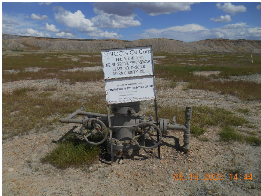
Wellhead with sign