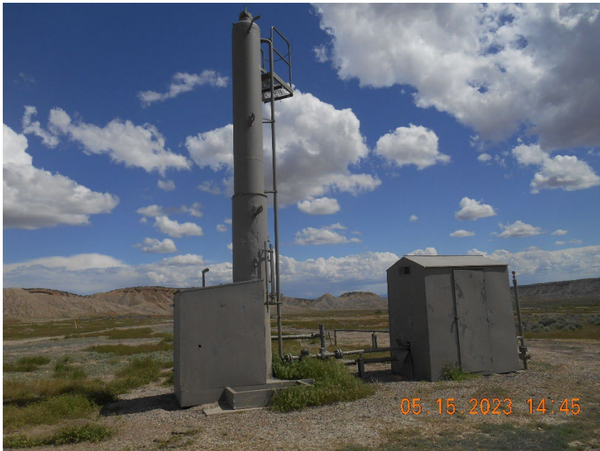
Meter housing and Dehydrator