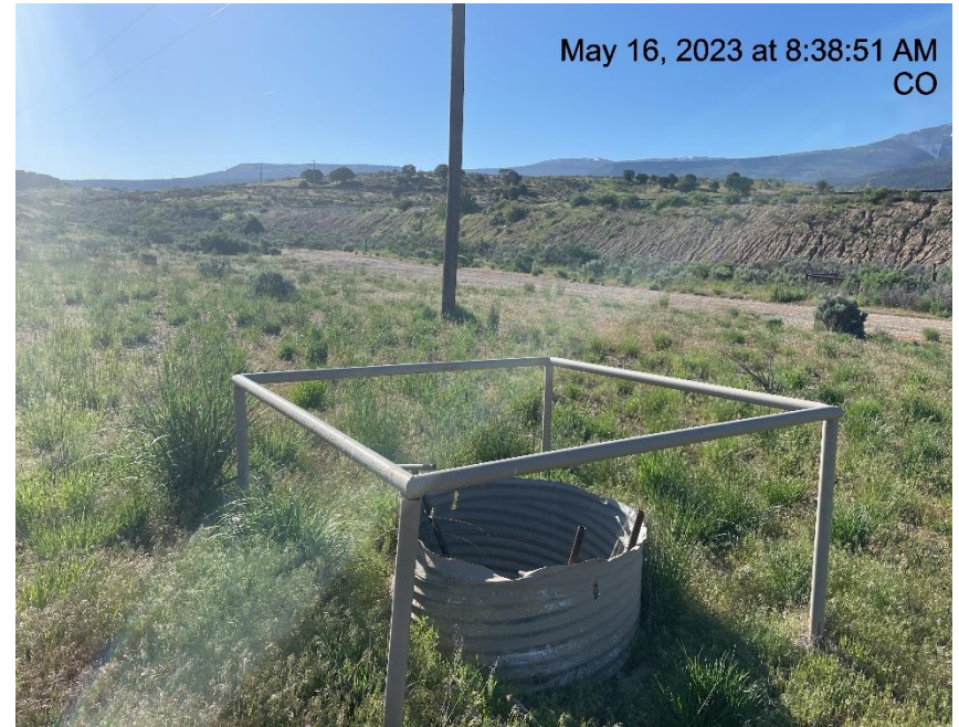
Photo # 7867 Open cellar/wildlife hazard (Cellar is off the north side of lease road approximately 1/10 of a mile from location)