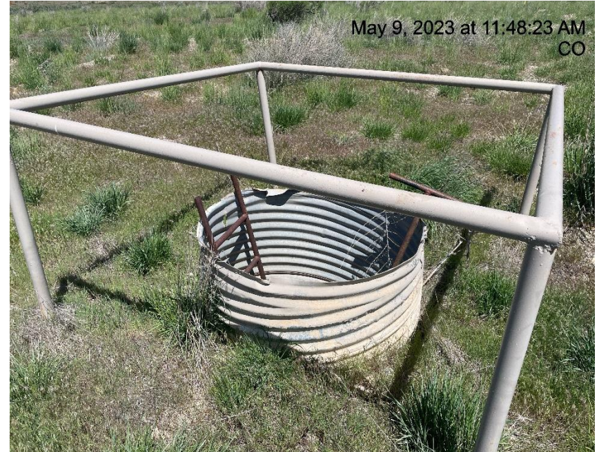
Photo # 7360 From inspection 708900441 conducted on 05/09/2023 Open cellar/wildlife hazard (Cellar is off the north side of lease road approximately 1/10 of a mile from location)