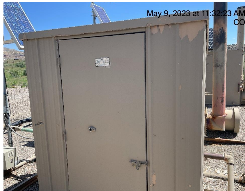
Photo # 7351 From inspection 708900441 conducted on 05/09/2023 Meter calibration info not conspicuously posted