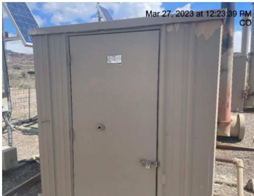
Photo # 3409 From inspection 708900173 conducted on 03/27/2023 Meter calibration info not conspicuously posted