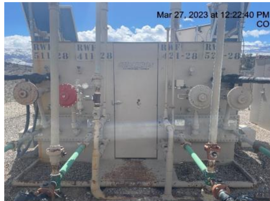
Photo # 3407 From inspection 708900173 conducted on 03/27/2023 Meter calibration info not conspicuously posted