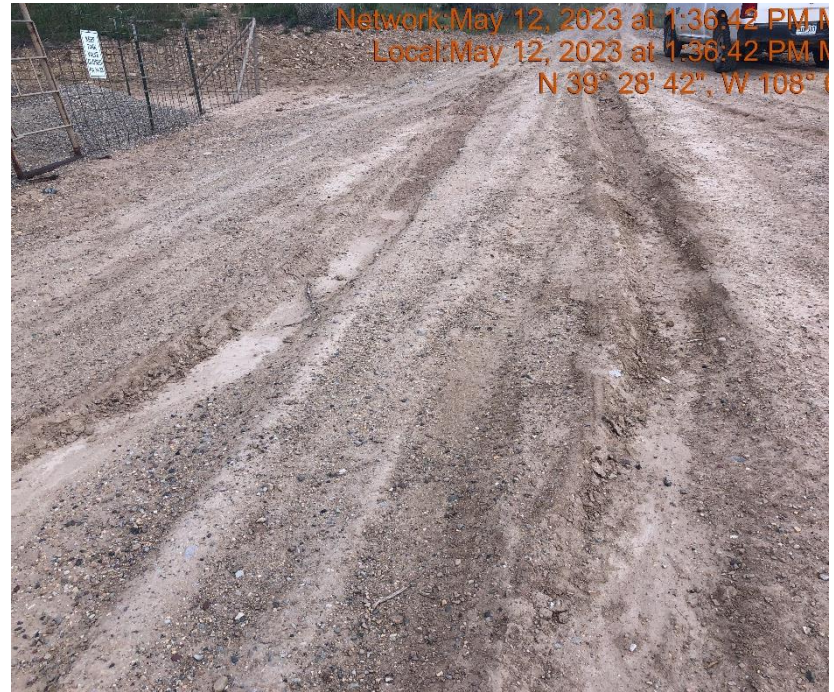
Photo #9972 Insufficient tracking BMP at entrance to minimize the transport of sediment.