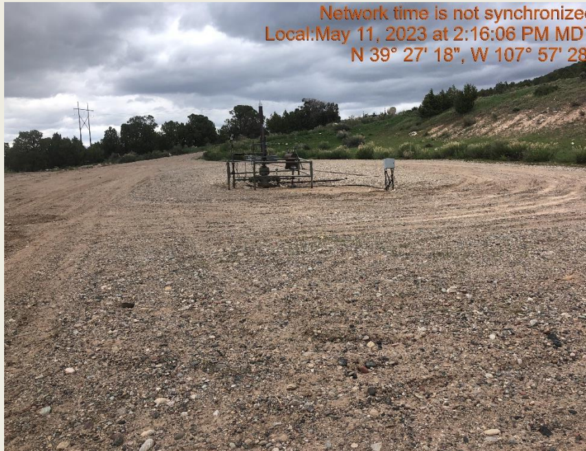
Photo #9958 Insufficient tracking BMP at entrance to access road to minimize the transport of sediment.