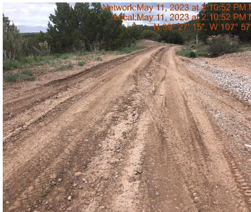
Photo #9950 Insufficient tracking BMP at entrance to minimize the transport of sediment.