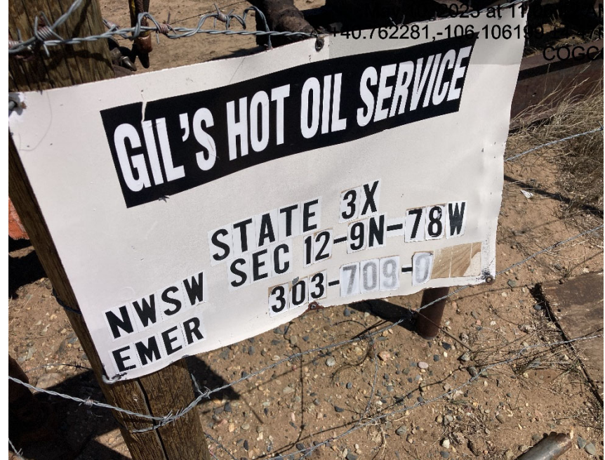
Well head signage lacking information