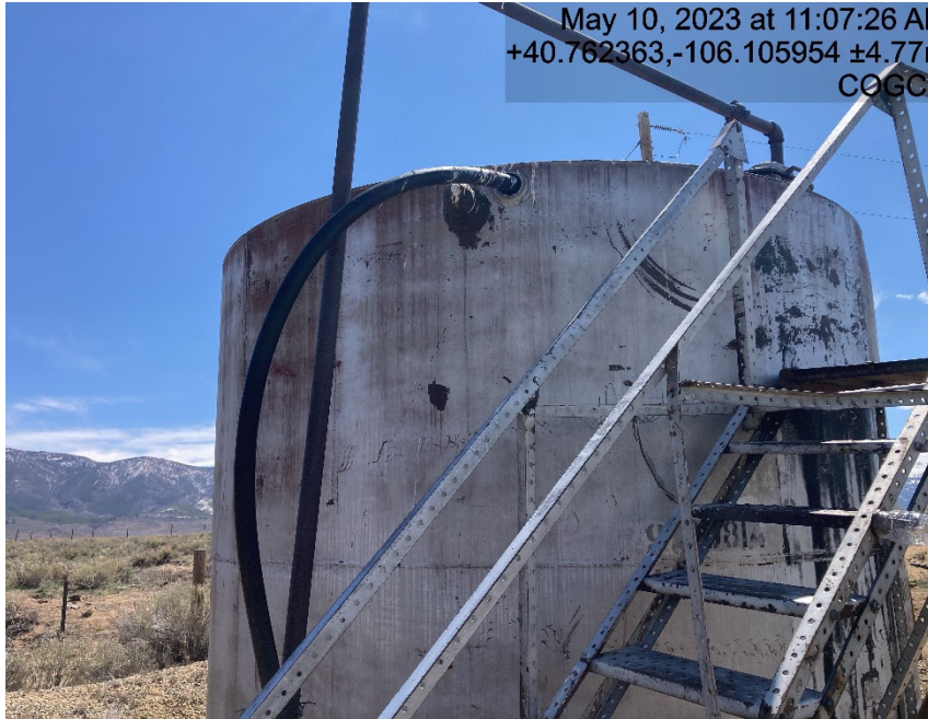
Flow line from State 12-1 put trough hole on side of tank open to atmosphere. Strong hydrocarbon odor.