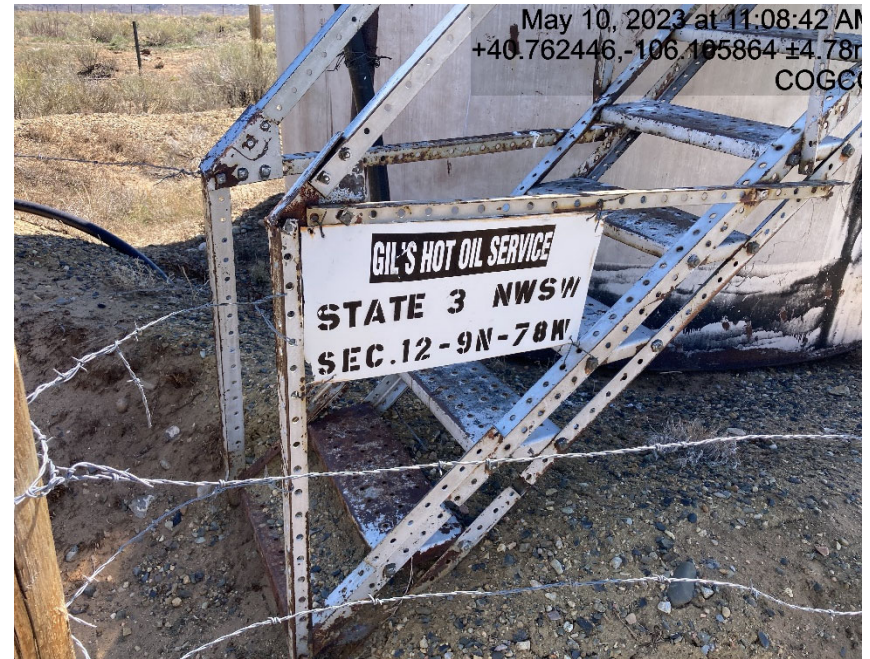
Battery signage is lacking information