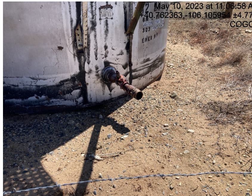
Valve lacking cap/plug