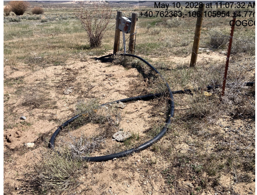
Flow line from State 12-1