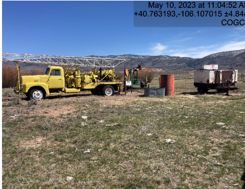
Location and stored equipment