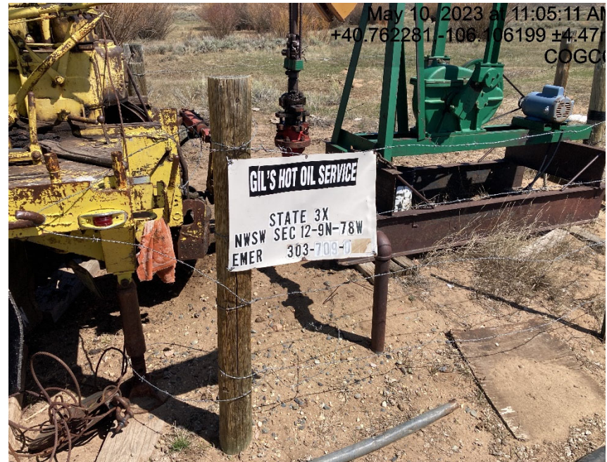
Well head signage lacking information