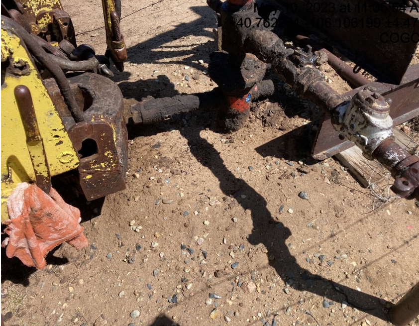
No Braden head access