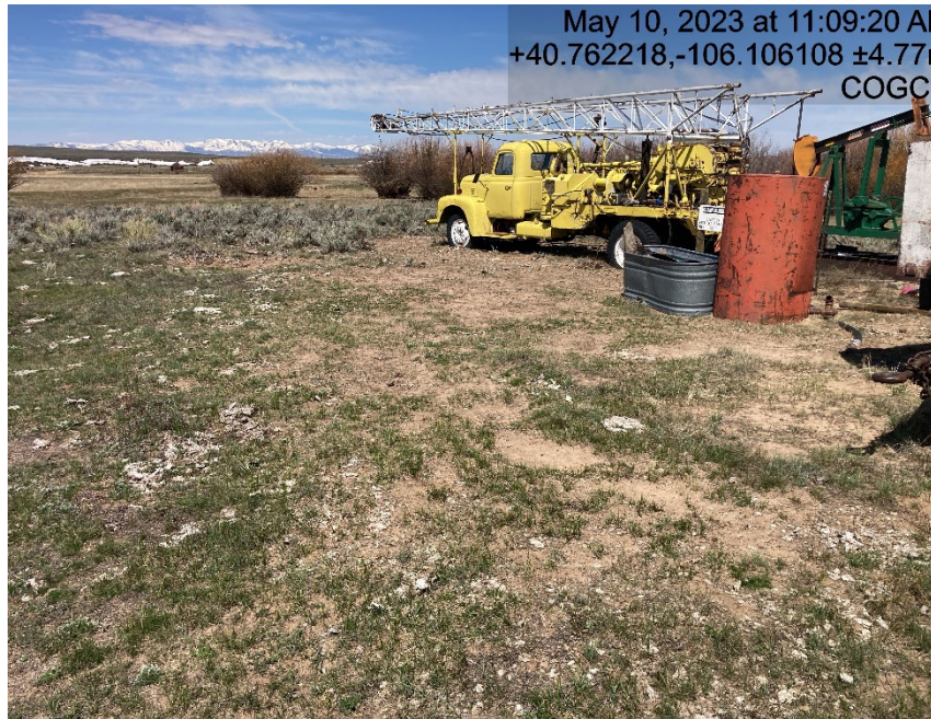
Debris and stored equipment