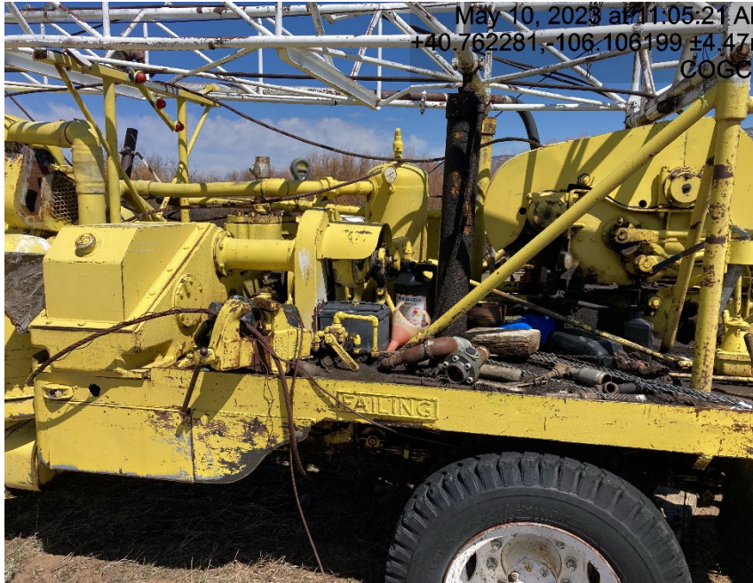
Debris and stored equipment