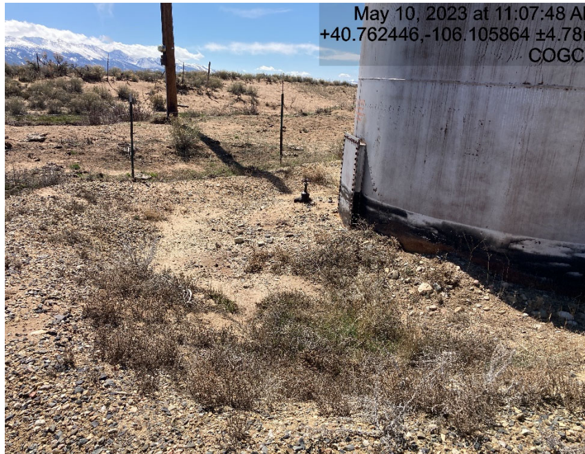
Insufficient secondary berms