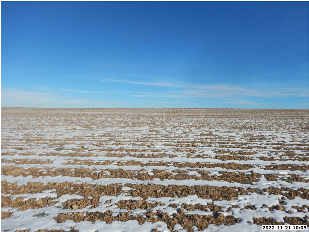
LOCATION PICTURE OF VISTA 13-16HZ WELL PAD - CAMERA VIEW NORTH

S1/2 SW1/4 SECTION 16, TOWNSHIP 5 NORTH, RANGE 67 WEST, 6TH P.M., GREELEY, COLORADO