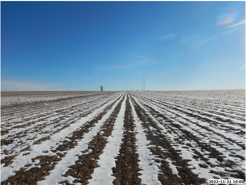
LOCATION PICTURE OF VISTA 13-16HZ WELL PAD - CAMERA VIEW EAST