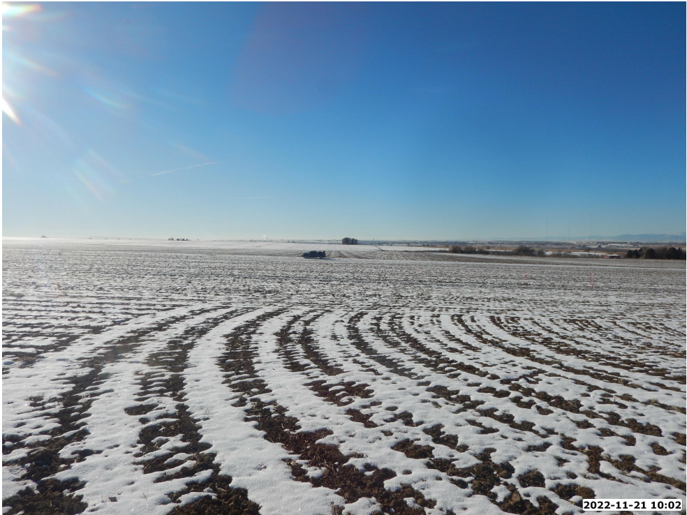
LOCATION PICTURE OF VISTA 13-16HZ WELL PAD - CAMERA VIEW SOUTH