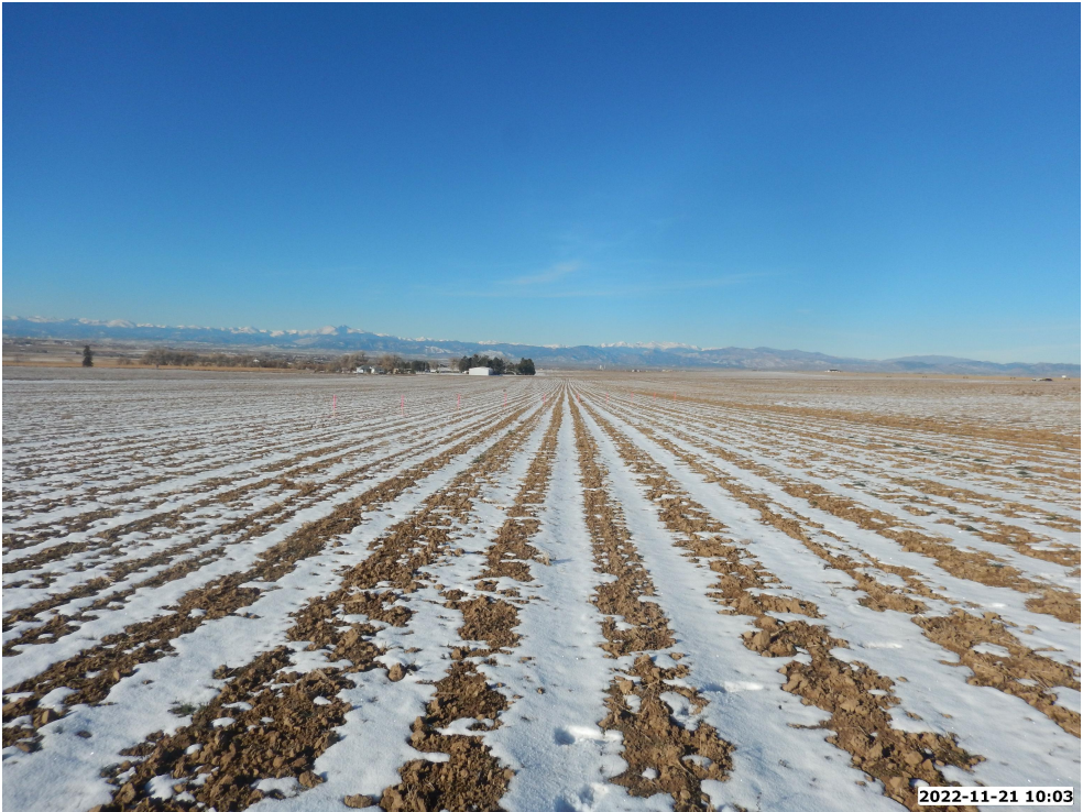
LOCATION PICTURE OF VISTA 13-16HZ WELL PAD - CAMERA VIEW WEST