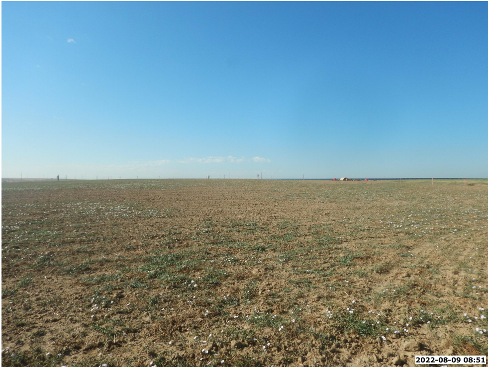
LOCATION PICTURE OF SCHMERGE 9-4HZ WELL PAD - CAMERA VIEW SOUTH