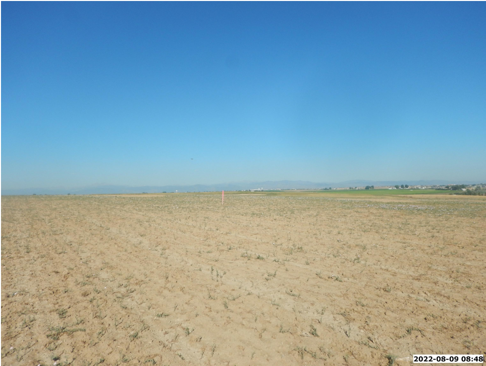
LOCATION PICTURE OF SCHMERGE 9-4HZ WELL PAD - CAMERA VIEW WEST

K:\ANADARKO\2022\2022_97_SCHMERGE_TSN_R67W_SEC_4\DWG\SCHMERGE_TSN_R67W_SEC_4_OPTION_2.dwg, 11/11/2022 3:09:01 PM, steven