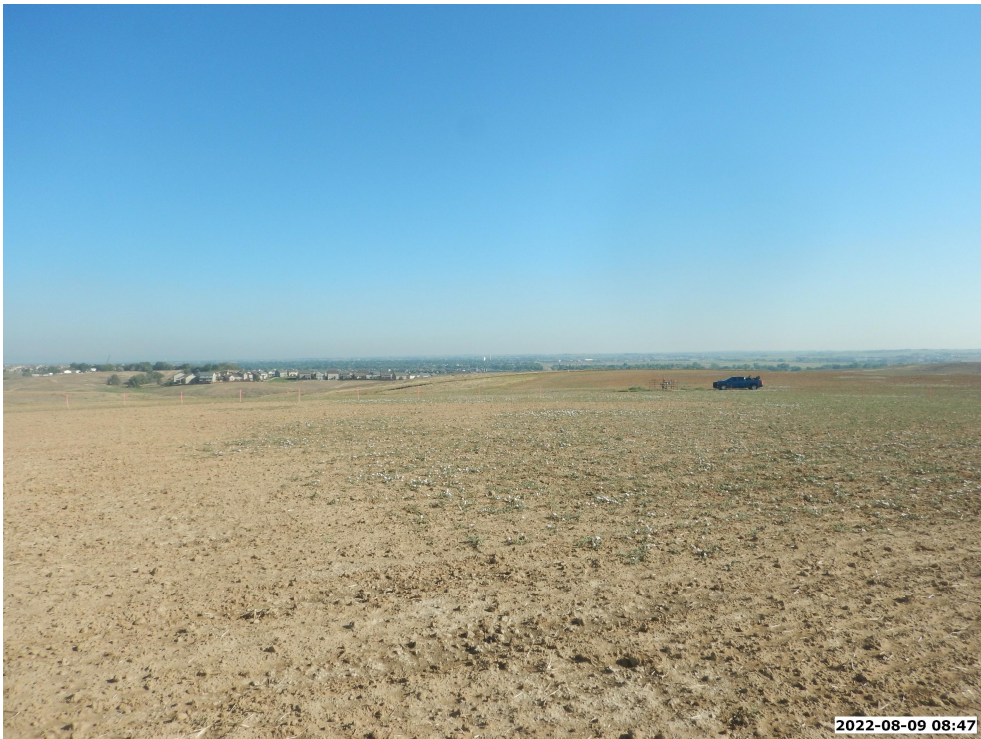
LOCATION PICTURE OF SCHMERGE 9-4HZ WELL PAD - CAMERA VIEW NORTH

NE1/4 SE1/4 SECTION 4, TOWNSHIP 5 NORTH, RANGE 67 WEST, 6TH P.M., WELD COUNTY, COLORADO