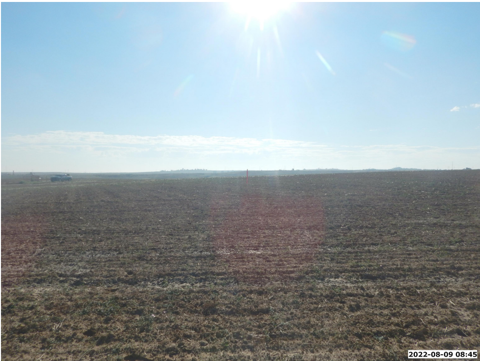
LOCATION PICTURE OF SCHMERGE 9-4HZ WELL PAD - CAMERA VIEW EAST