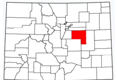
Index Map of Elbert County, Colorado

Location ID: 322183 Coordinates: 39.515431 -104.576882