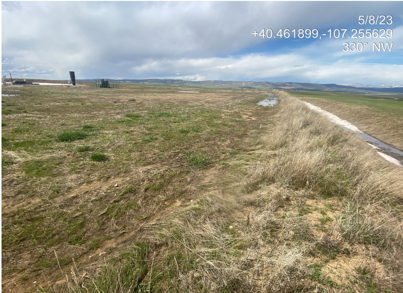
Photo 3. Photo taken from the east of the location shows unreclaimed areas at the east and north which are not necessary for production operations. Interim reclamation has not been performed.