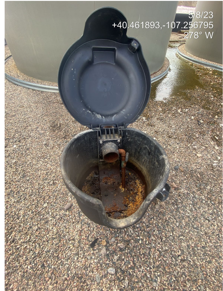
Photo 10. Photo shows a load line without a bull plug installed.