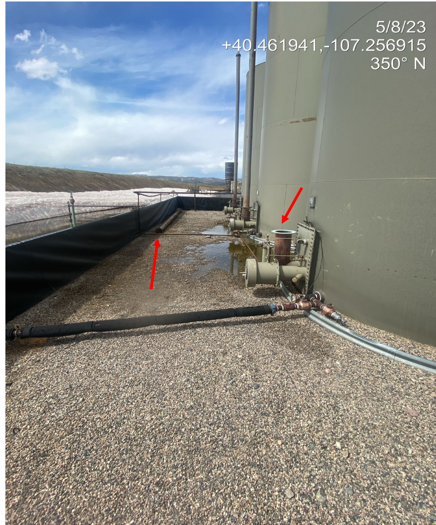
Photo 11. Photo shows stored equipment/debris and an open hole for wildlife to enter.