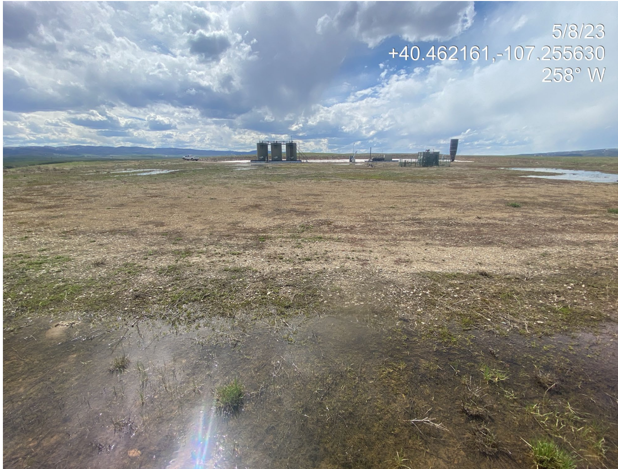
Photo 4. Photo taken from the east of the location shows unreclaimed areas which are not necessary for production operations. Interim reclamation has not been performed.