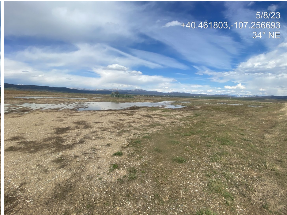
Photo 2. Photo taken from the Location entrance shows an overview of the eastern portion of the location. Photo also shows areas not necessary for production Operations which have not been reclaimed.