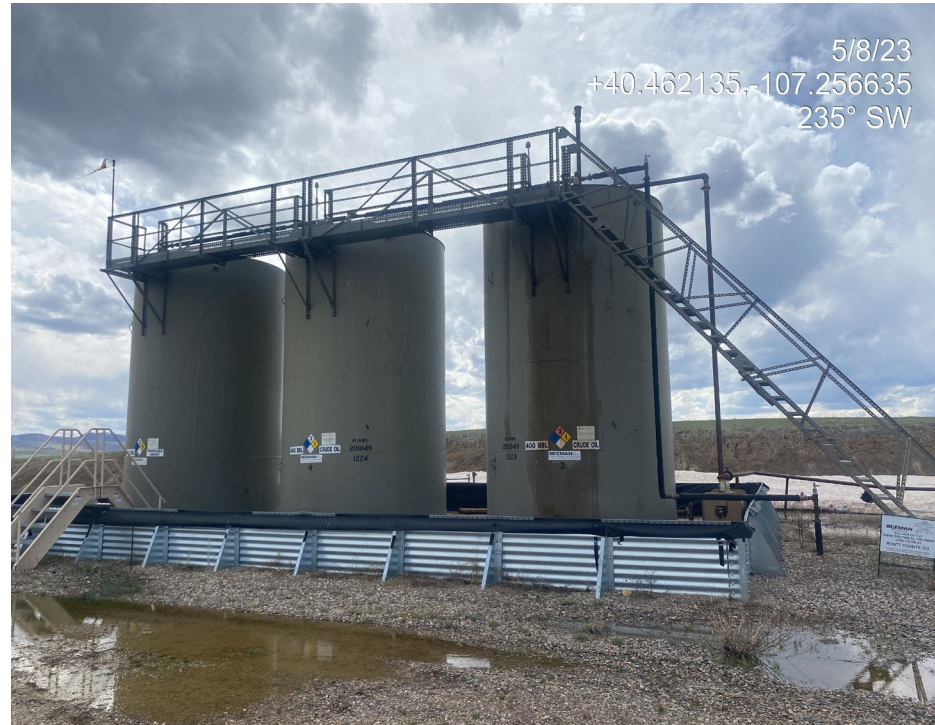
Photo 12. Photos show production areas.