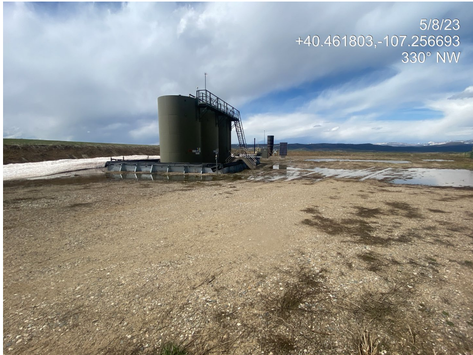
Photo 1. Photo taken from the Location entrance shows an overview of the western portion of the Location.