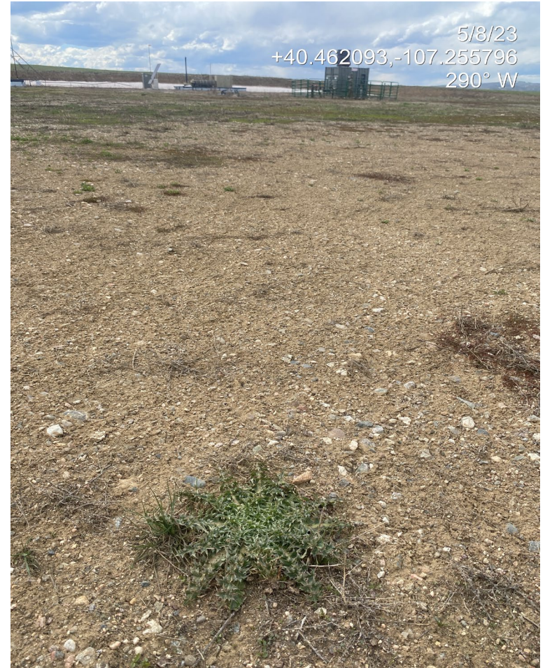
Photo 6. Photos show List B Noxious Weeds Dalmatian toadflax (left) and musk thistle (right) found throughout the Location.