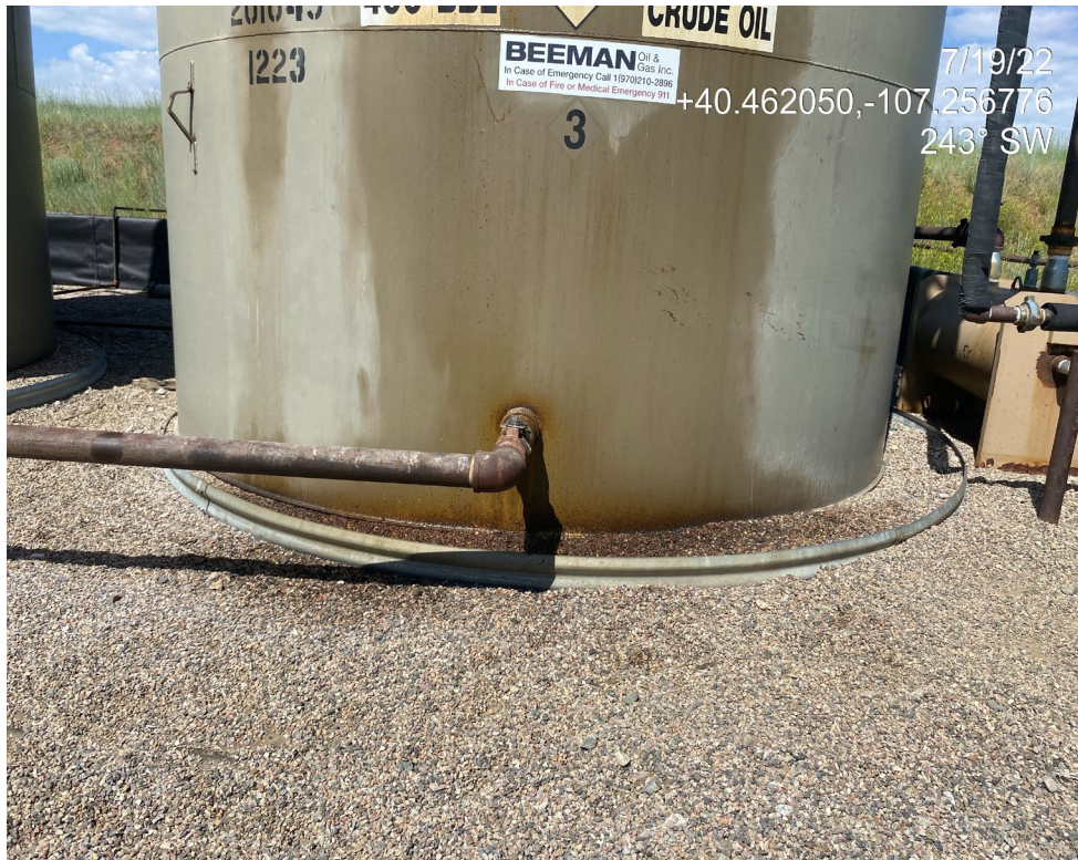
Photo 9. Photo shows staining.