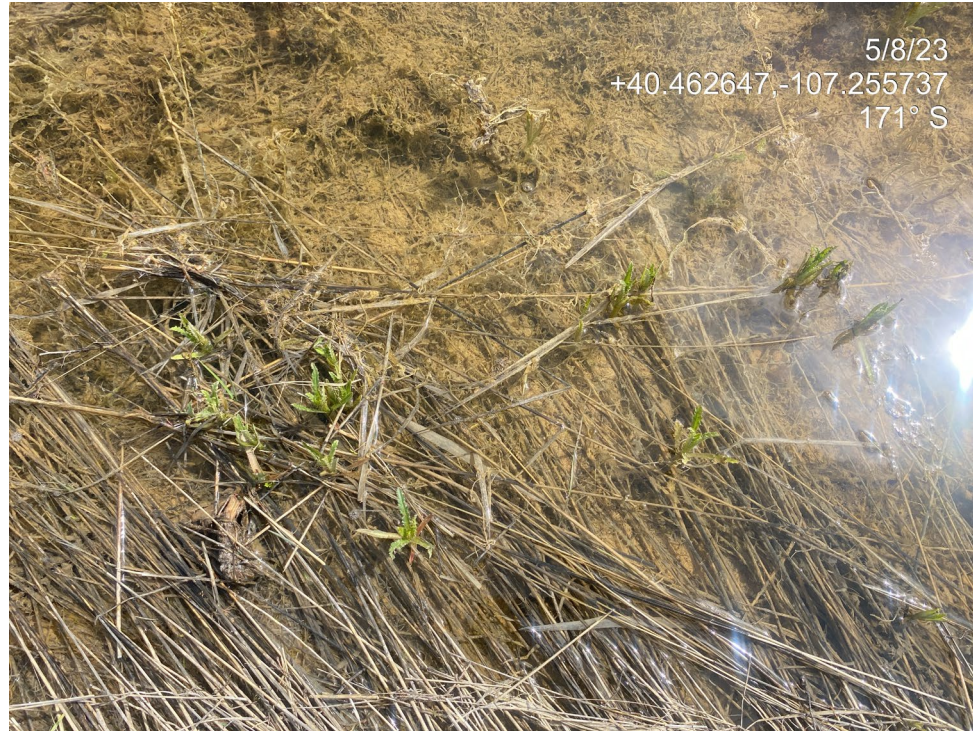
Photo 5. Photos show Canada thistle a CO List B Noxious Weed found throughout the Location.