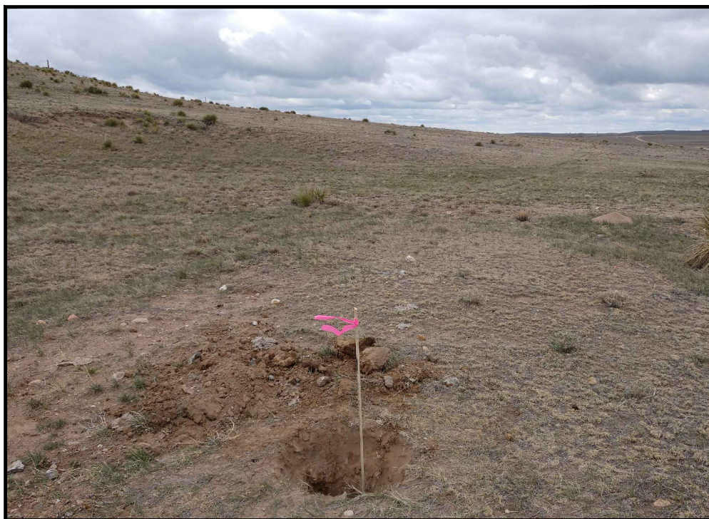
PHOTO: VIEW OF AS-DRILLED LOCATION