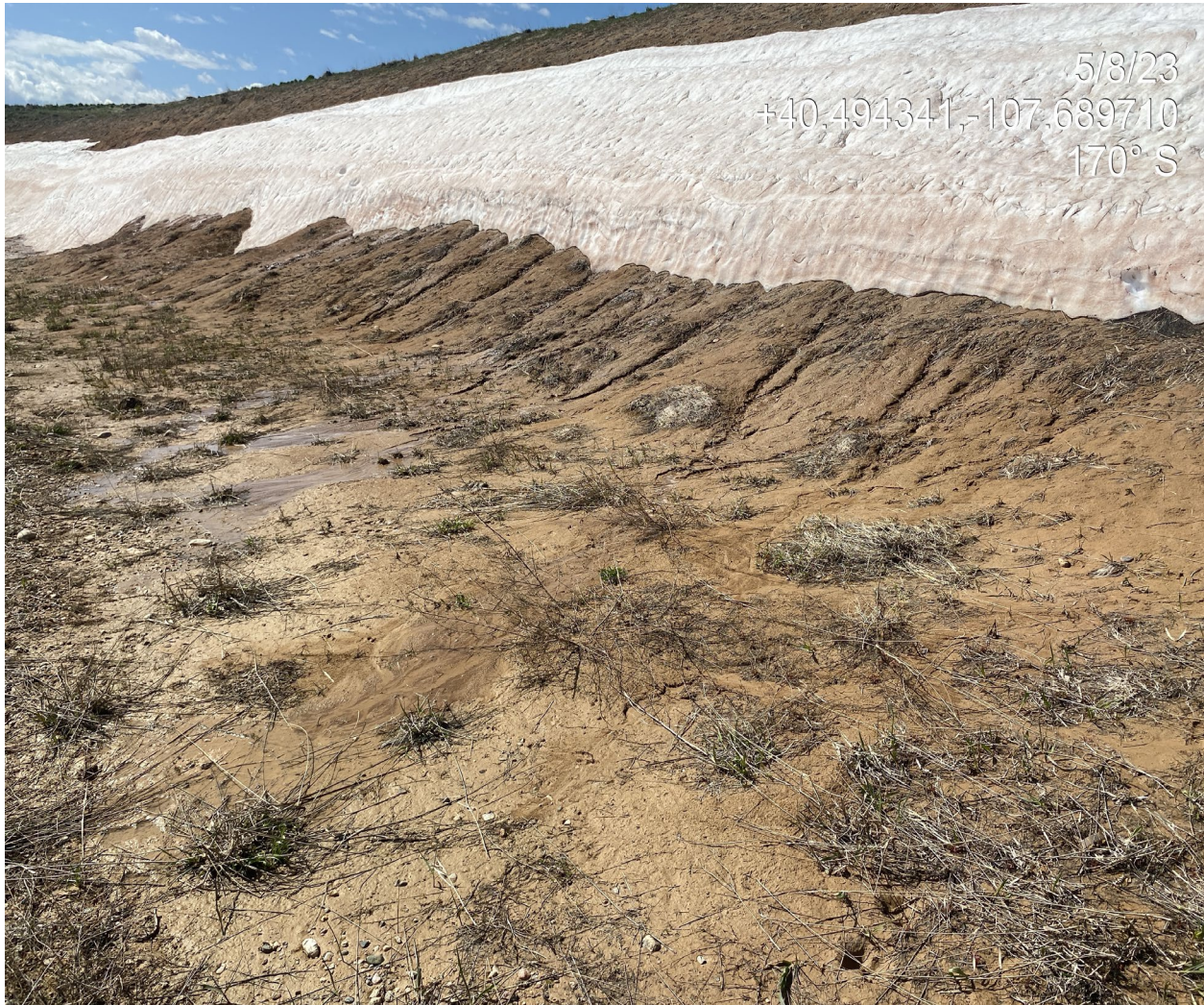
Photo 6. Photos shows unstabilized cut slopes at the west of the location.