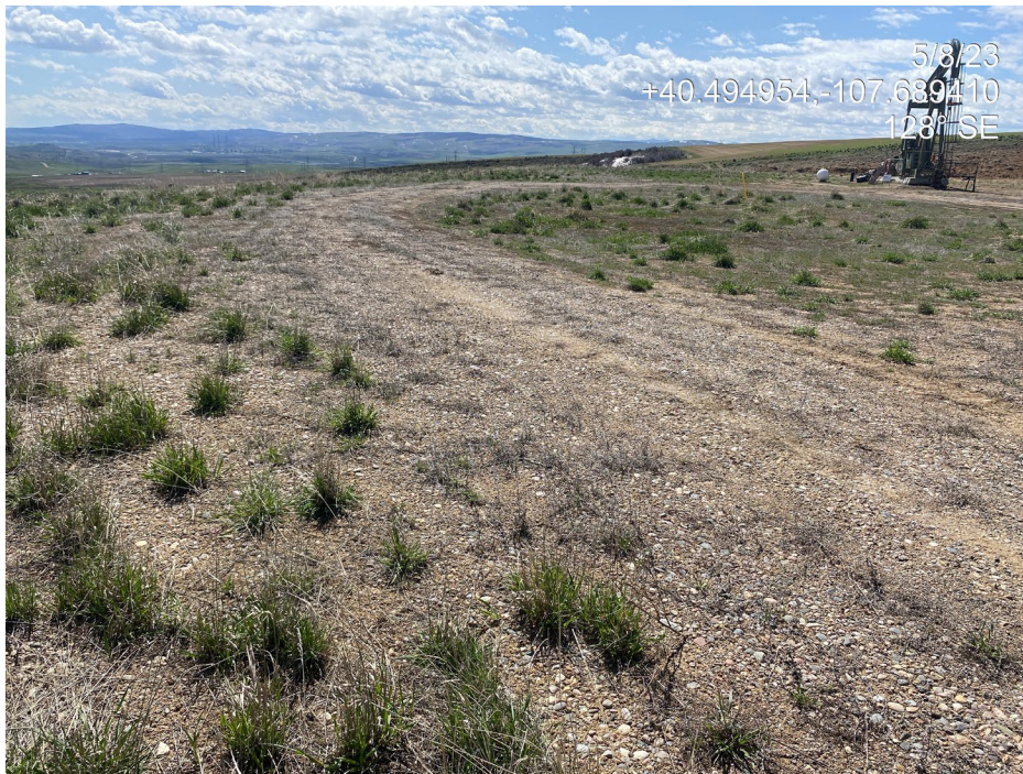
Photo 21. Photo taken from the northeast of the Location shows an example of areas not necessary for production operations where interim reclamation is required.