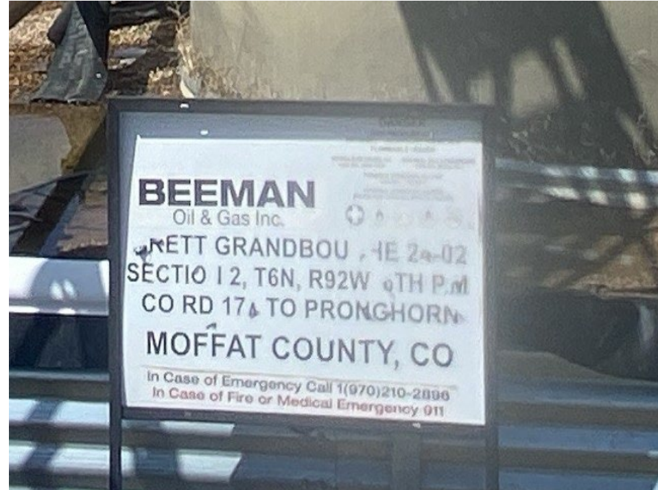
Photo 7. Photos show production areas. The tank battery sign (circled) does not comply with Rule 605.e and is partially illegible.