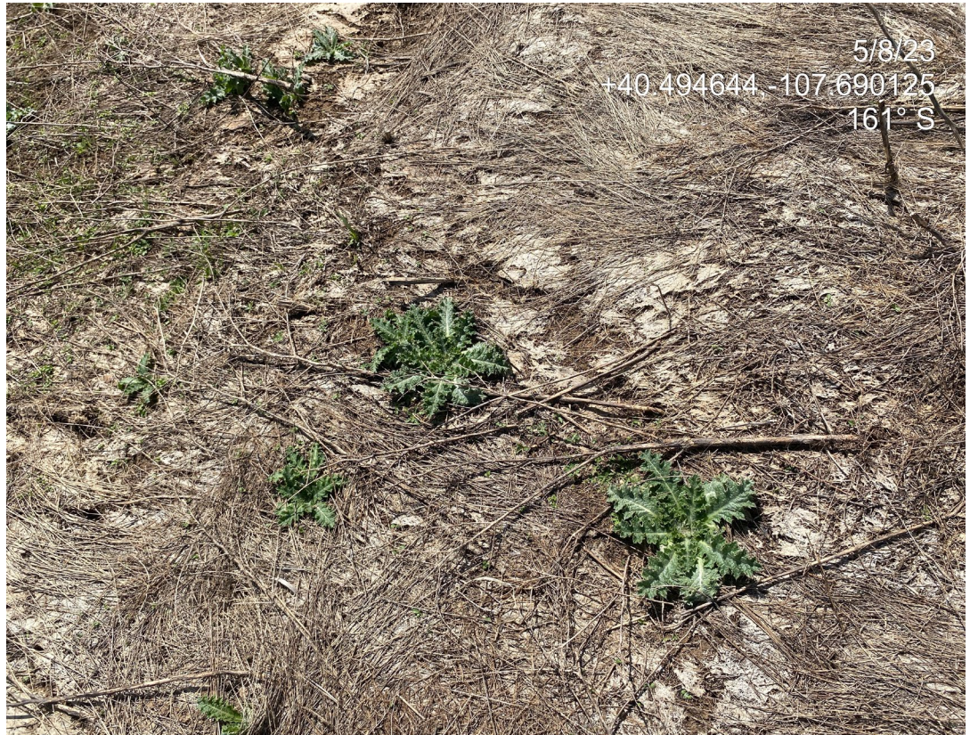
Photo 18. Photos taken from the northwestern cut slope of the Location shows scotch thistle (List B Noxious).