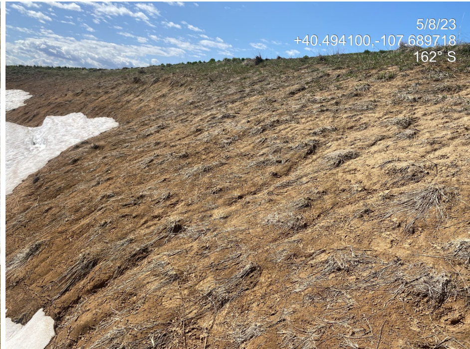
Photo 3. Photos show unstabilized cut slopes at the west of the location.