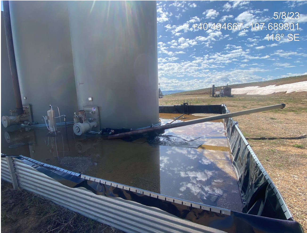
Photo 12. Photo shows a burner assembly pipe not installed/in disrepair. Open pipe equipment now poses a risk to wildlife.