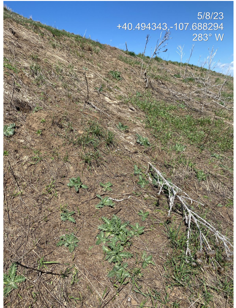
Photo 19. Photos taken from the eastern fill slope of the Location shows scotch thistle (List B Noxious).