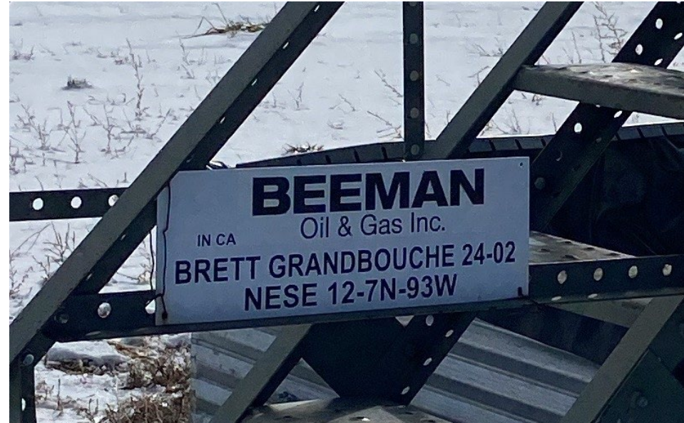
Photo 8. Photos show production areas. The smaller sign (circled) contains inaccurate information; the legal location is incorrect.