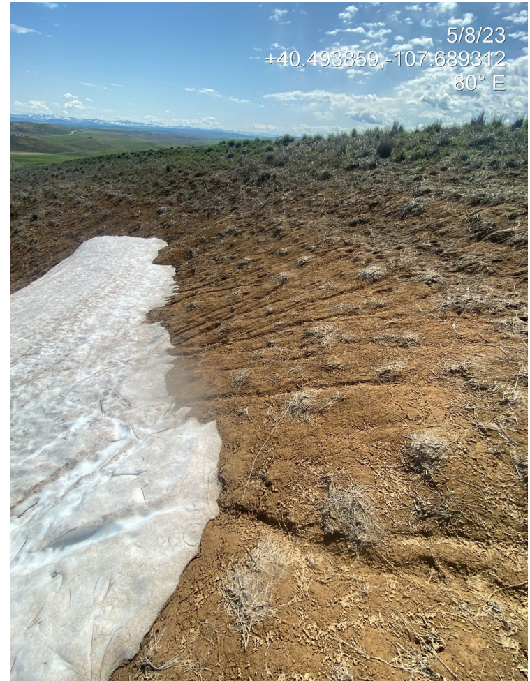
Photo 4. Photos shows unstabilized cut slopes at the west of the location.