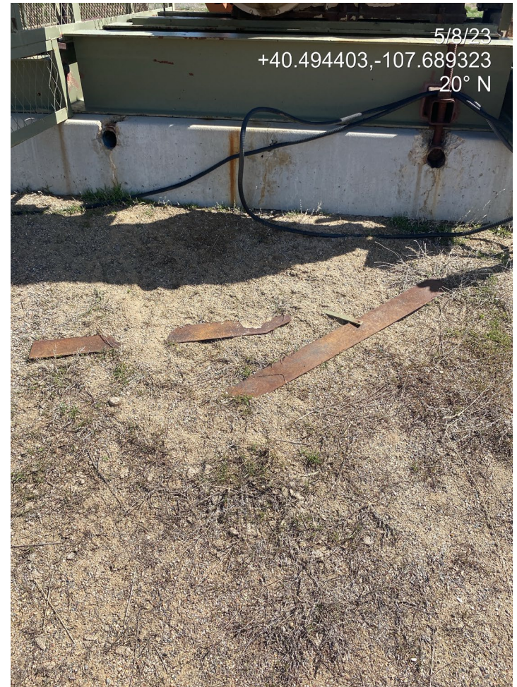
Photo 13. Photos show trash/debris at the eastern fills slope (left) and pumpjack (right).