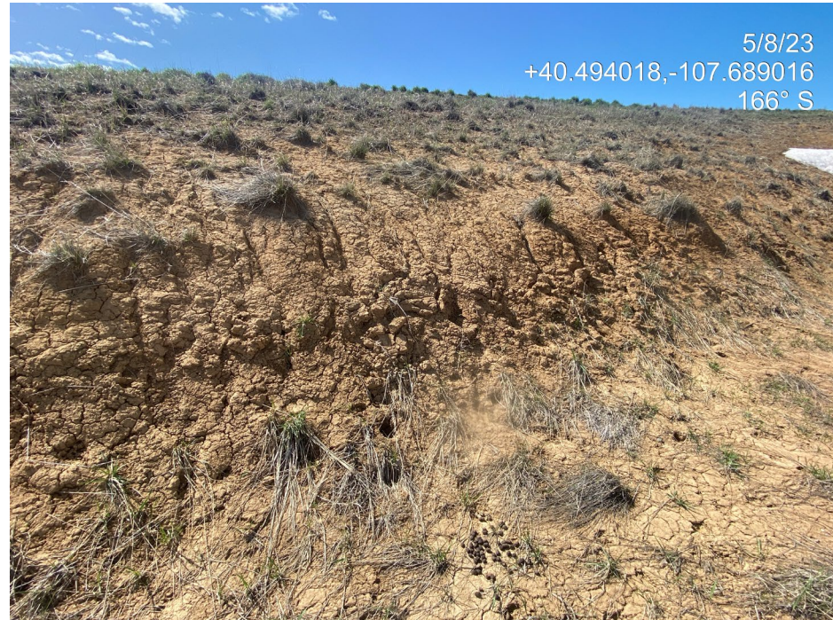
Photo 5. Photos shows unstabilized cut slopes at the southwest of the location.