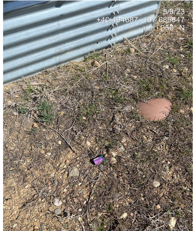
Photo 14. Photos show trash observed during the previous, 11/16/22 inspection (left) and again on 5/8/23 (right).