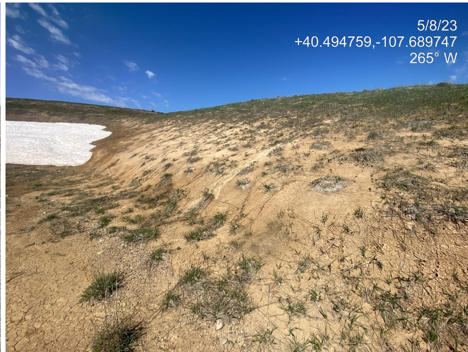
Photo 2. Photos show rill erosion on unstabilized cut slopes at the north of the Location.