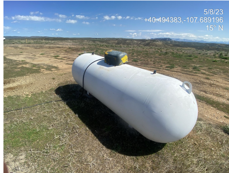
Photo 17. Photos show a tank at the pumpjack lacks safety labeling.