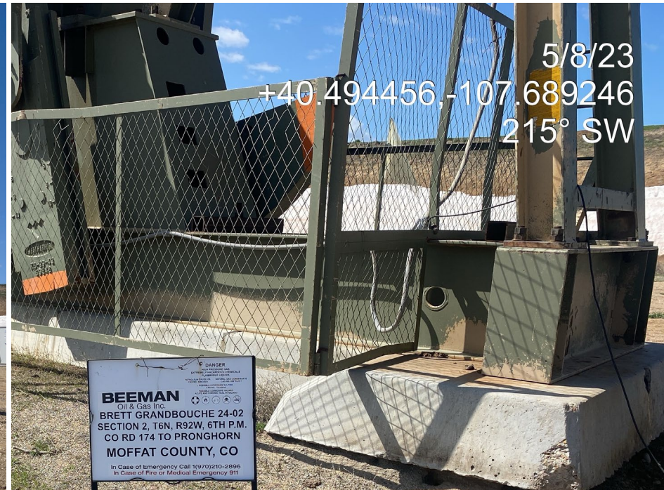
Photo 9. Photos show production areas. The well sign does not comply with Rule 605.d.