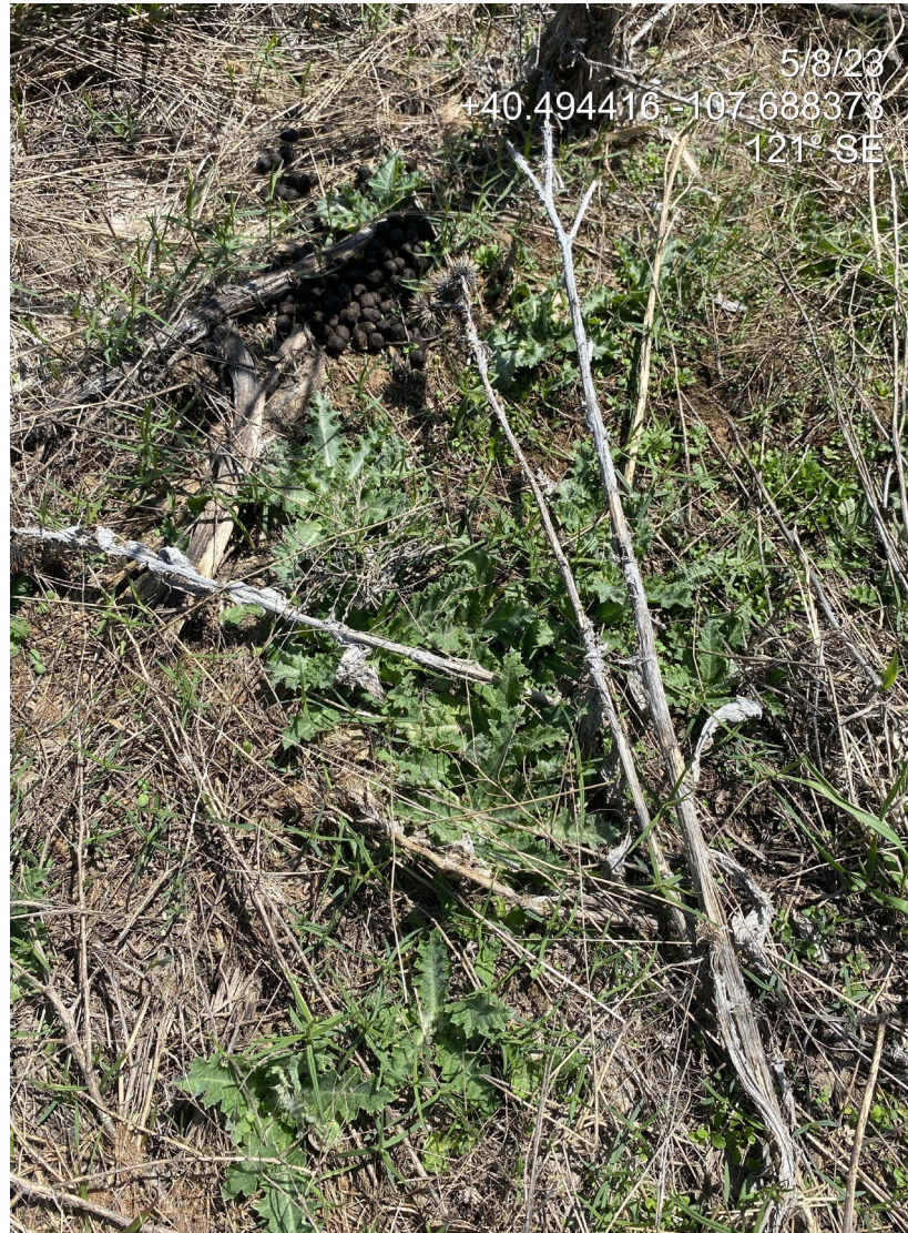
Photo 20. Photo taken from the eastern fill slope of the Location shows scotch thistle (List B Noxious).