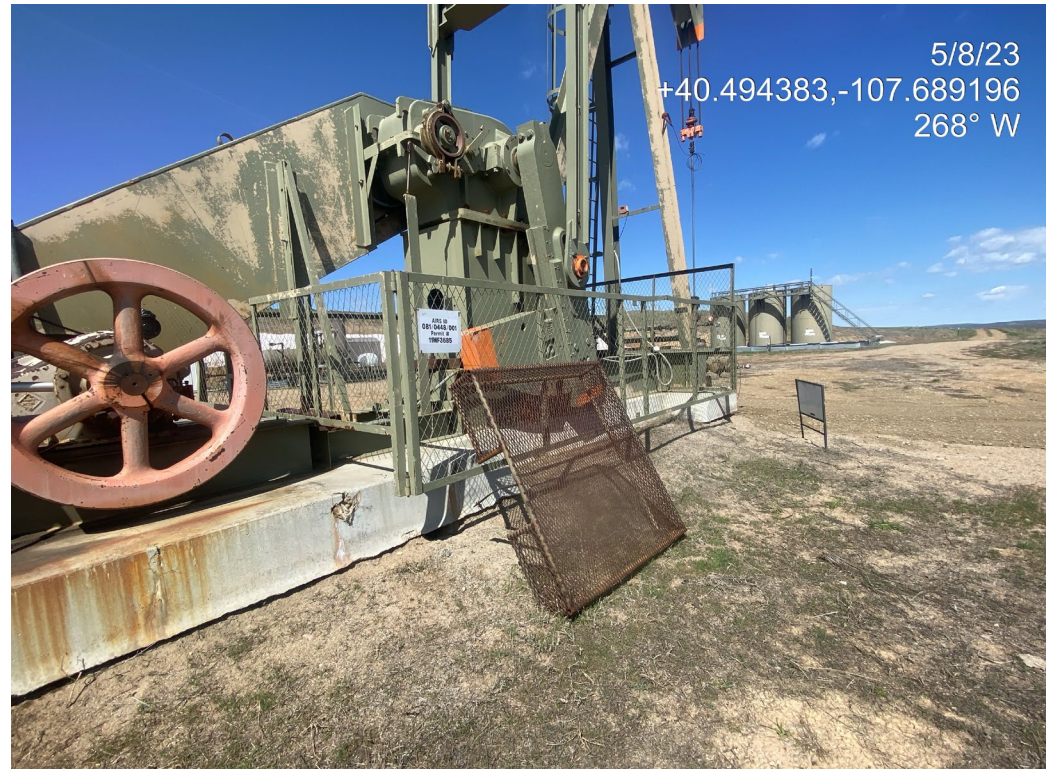
Photo 16. Photo shows the guard not installed on the pumpjack.