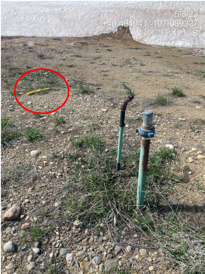
Photo 15. Photo taken from the southwest shows two (2) unused risers and trash/debris (anchor marker).