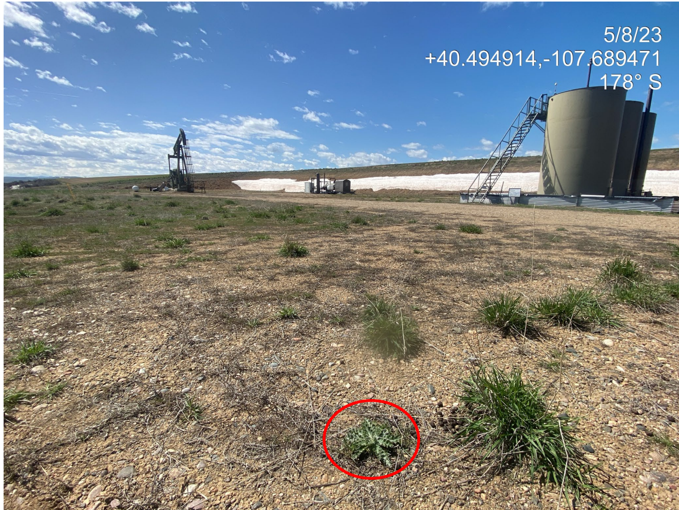
Photo 1. Photo taken from the northeast shows an overview of the Location. Photo also shows Scotch thistle, a List B Noxious Weed.