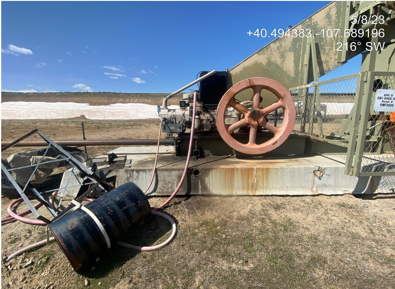
Photo 11. Photo shows a stand for a motor oil tank has tipped over at the pumpjack.