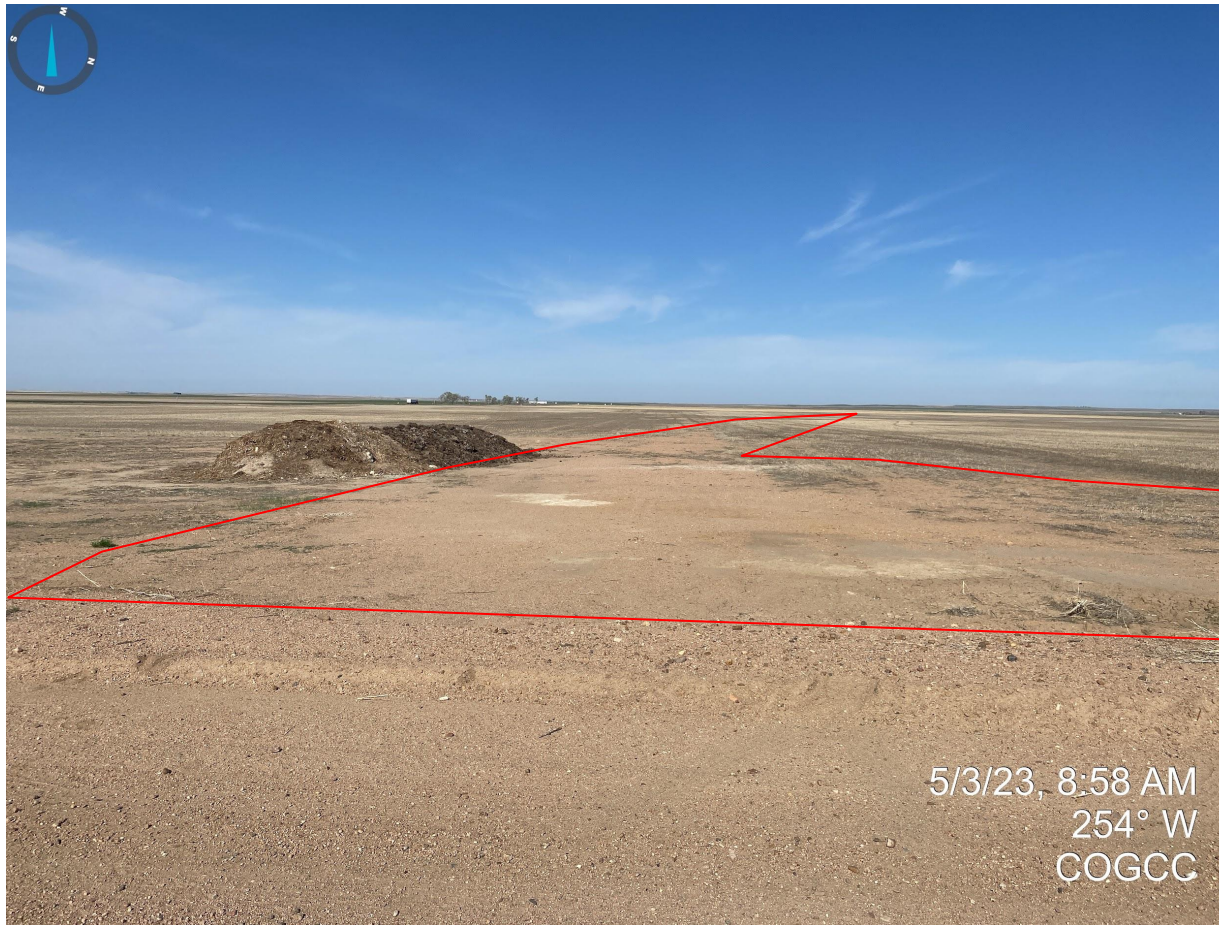
Photo 1. Facing west from adjacent county road. Photo illustrates that the former production areas and access road do not appear to have been reclaimed (highlighted in red) with evidence of road base material and lack of vegetation reflective of reference areas (millet stubble at time of this inspection).