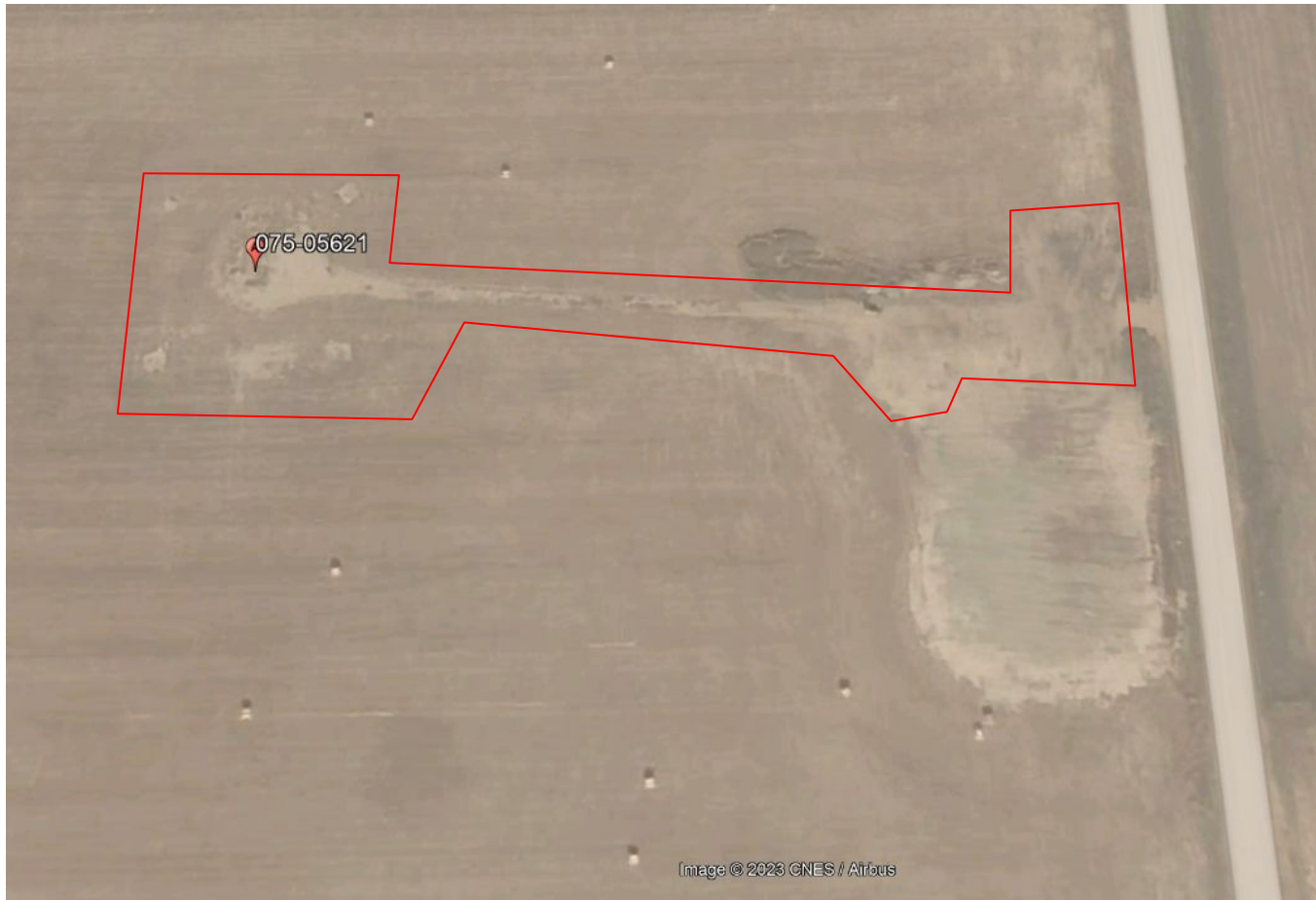
Photo 10. Google Earth aerial imagery (circa 10/2020) illustrating red outline of former access road, well location, and production area disturbances that will require final reclamation activities ASAP. Active remediation should not preclude the commencement of final reclamation activities on the above identified areas. Final reclamation should have been completed by 07/22/2019, per 1004 Rules.