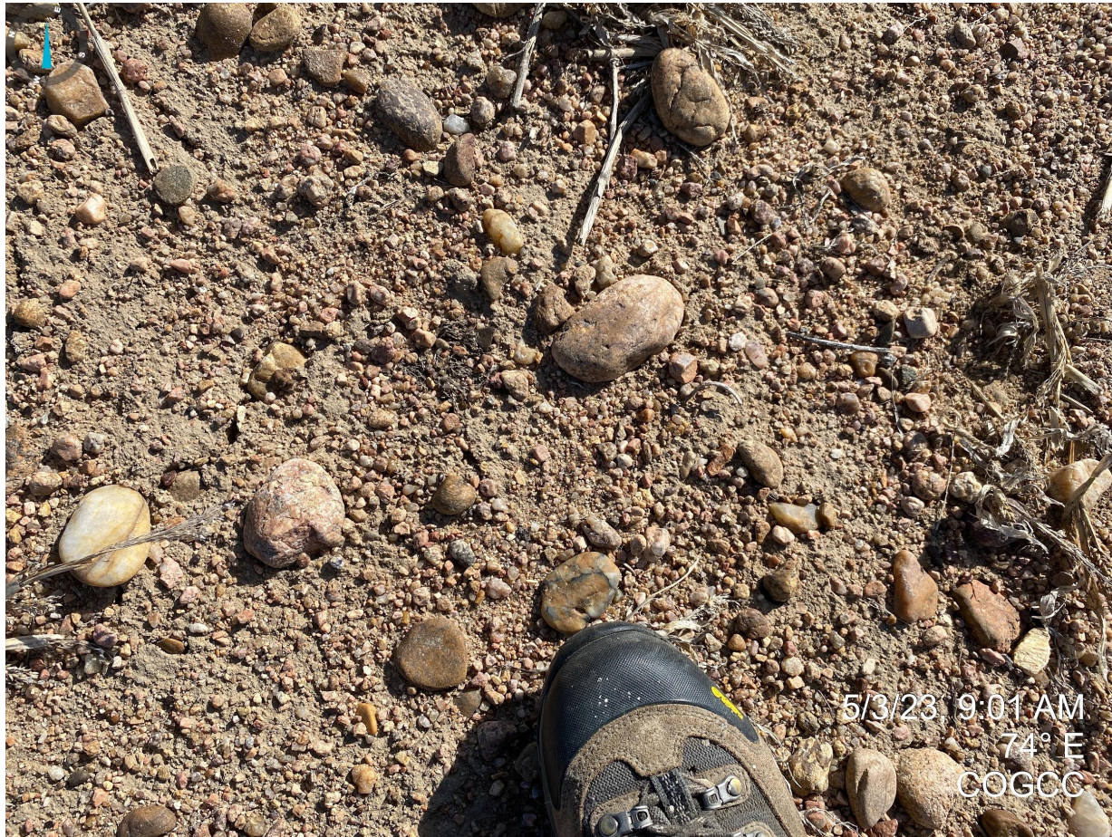
Photo 3. Close up photo of road base material left on the former production area and access road to well API# 075-05621.