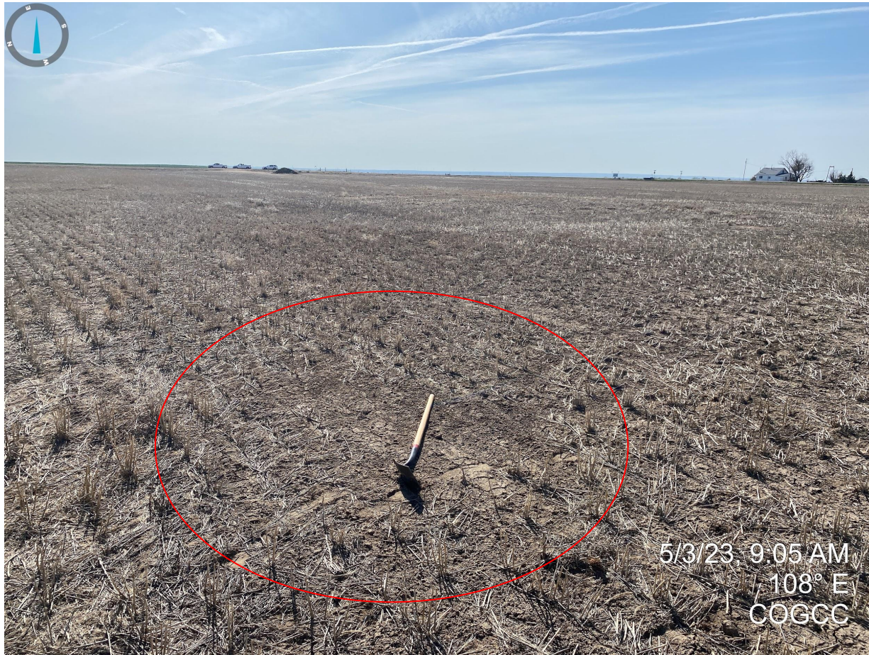
Photo 8. Northwest guy line anchor highlighted in red. No visible stubble from recent crop, possibly a result of compaction issues. This area will also require additional reclamation activities. Note: these are only examples as all four guyline anchors have poor or little to no growth (see Photo 10 for further).