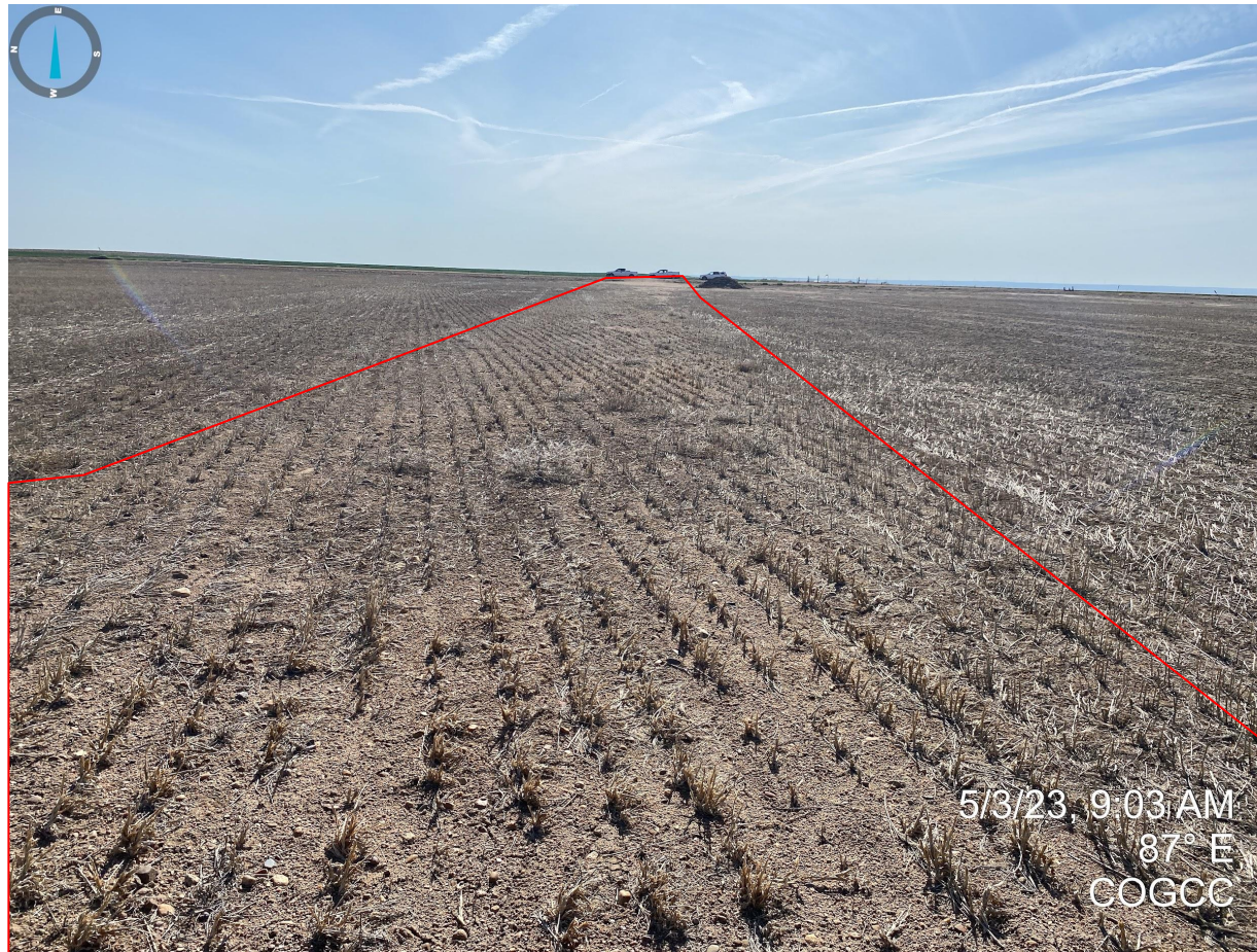
Photo 7. Facing east from the access road to the well location. Red outline illustrates the access road that will require further reclamation activities to meet Rule 1004 standards.