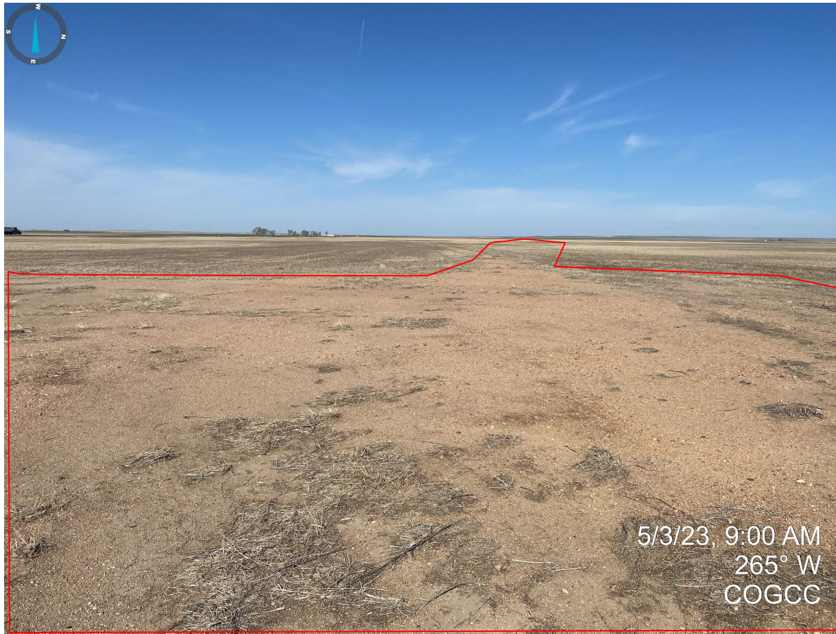
Photo 2. Facing west from former production areas. Active remediation (not pictured; off to the left (South) of photo) should not preclude the commencement of final reclamation activities. Road base material still evident in this photo; does not appear the location has been reclaimed.