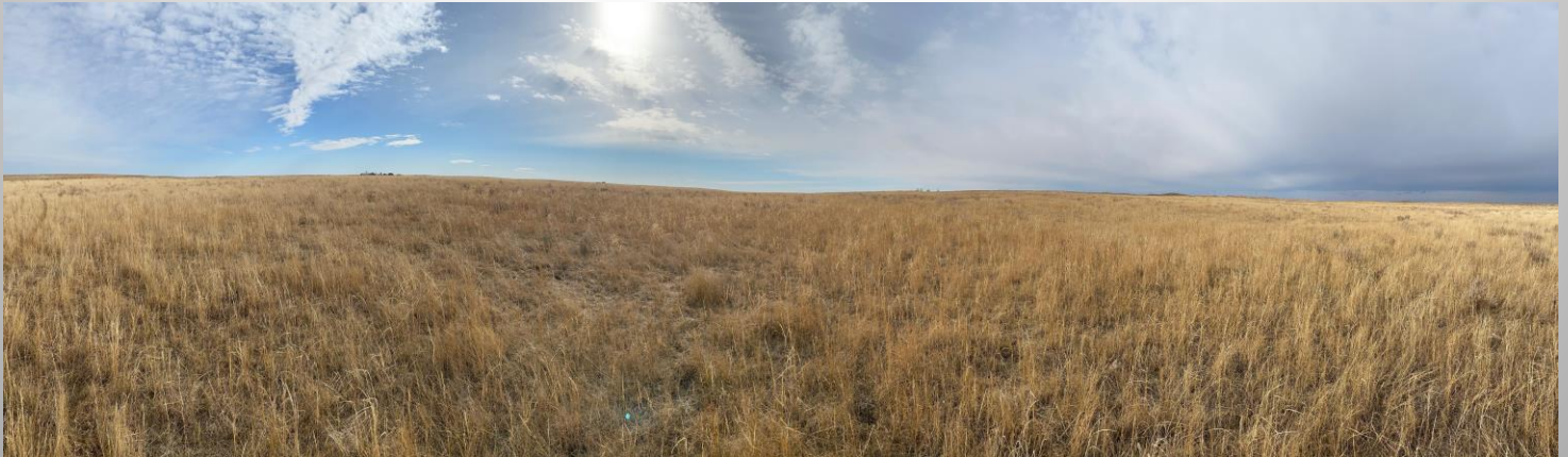
Dune #1 • South-West-North