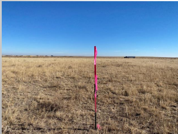
Dune #1 • East View