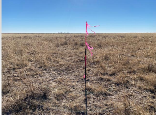
Dune #1 • South View