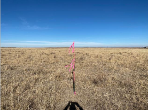
Dune #1 • North View

SHL: NE-1/4 of NE-1/4 Section 28-T1S-R50W-6 th PM Washington County, Colorado