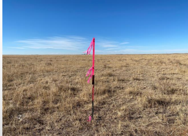
Dune #1 • West View