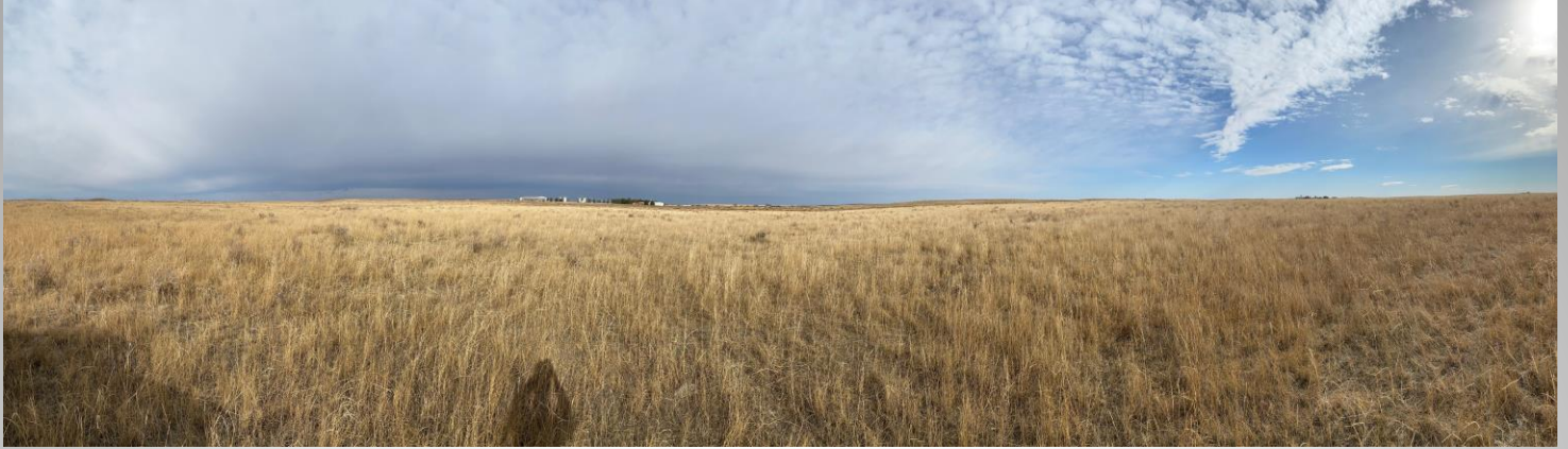
Dune #1 • North-East-South

SHL: NE-1/4 of NE-1/4 Section 28-T1S-R50W-6 th PM Washington County, Colorado