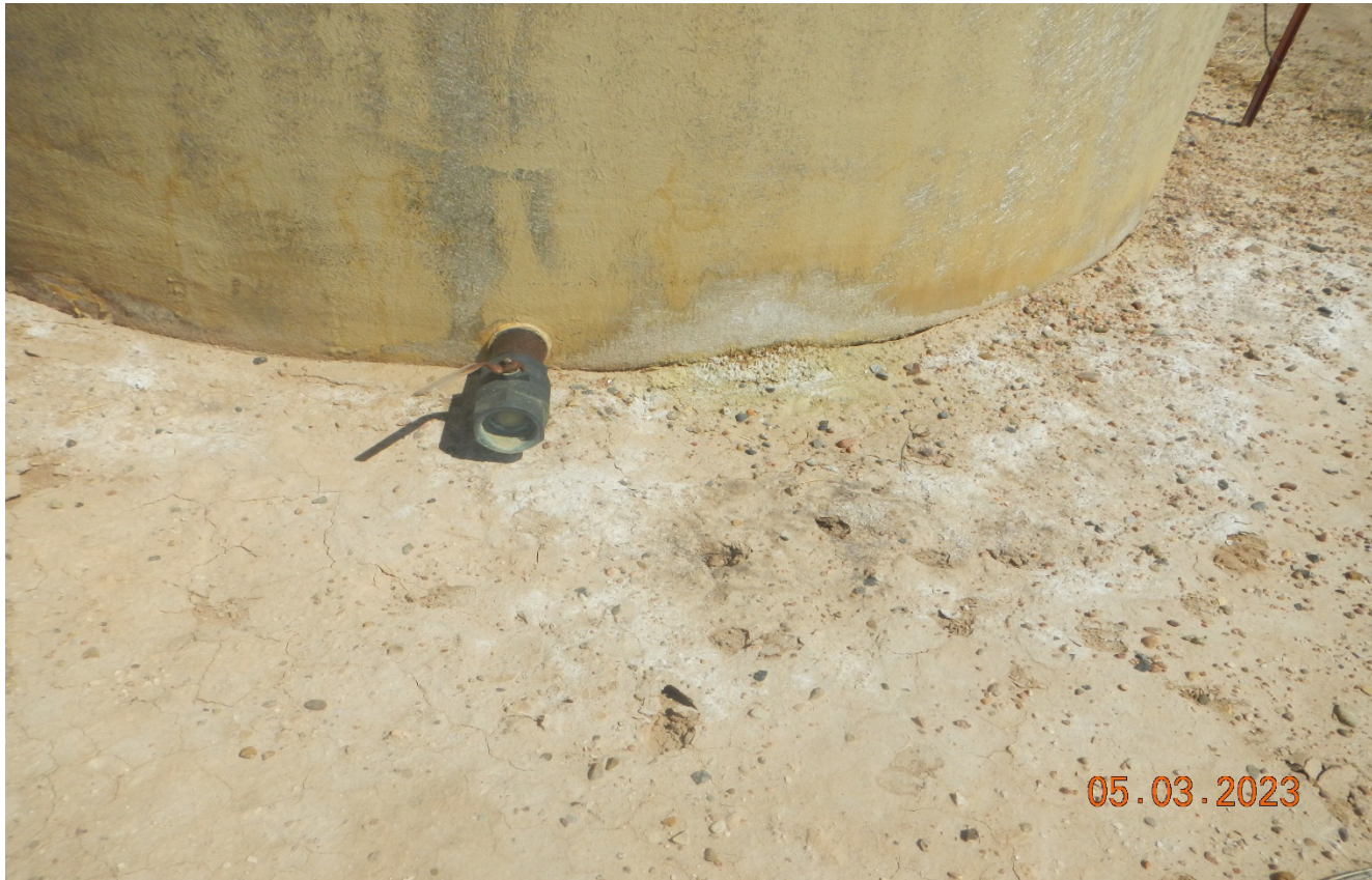
Photo 11. There are signs of a previous leak at the tanks due to white stained soils at the base of the tanks.