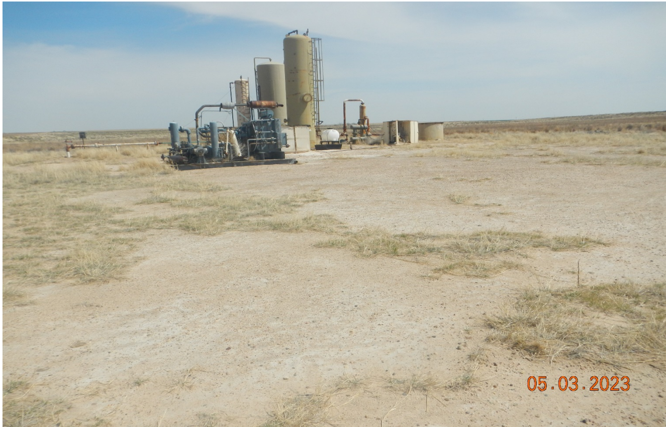
Photo 1. Facing northeast toward the gas treatment facility.