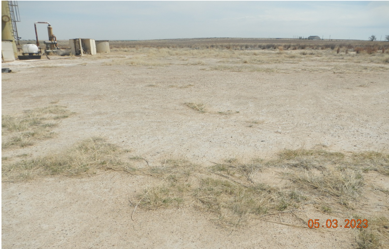
Photo 16. Facing east at the south side of the location. The surrounding disturbance area has areas that are bare of vegetation that need to be reclaimed per Rule 1003.