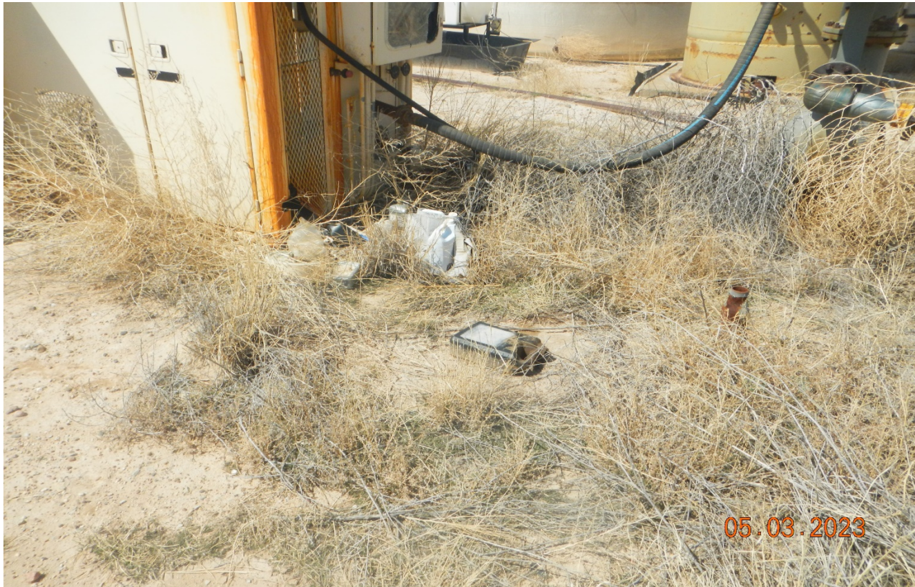
Photo 8. There is oil/chemical containers and trash not properly or disposed of. Previous corrective action is not completed.