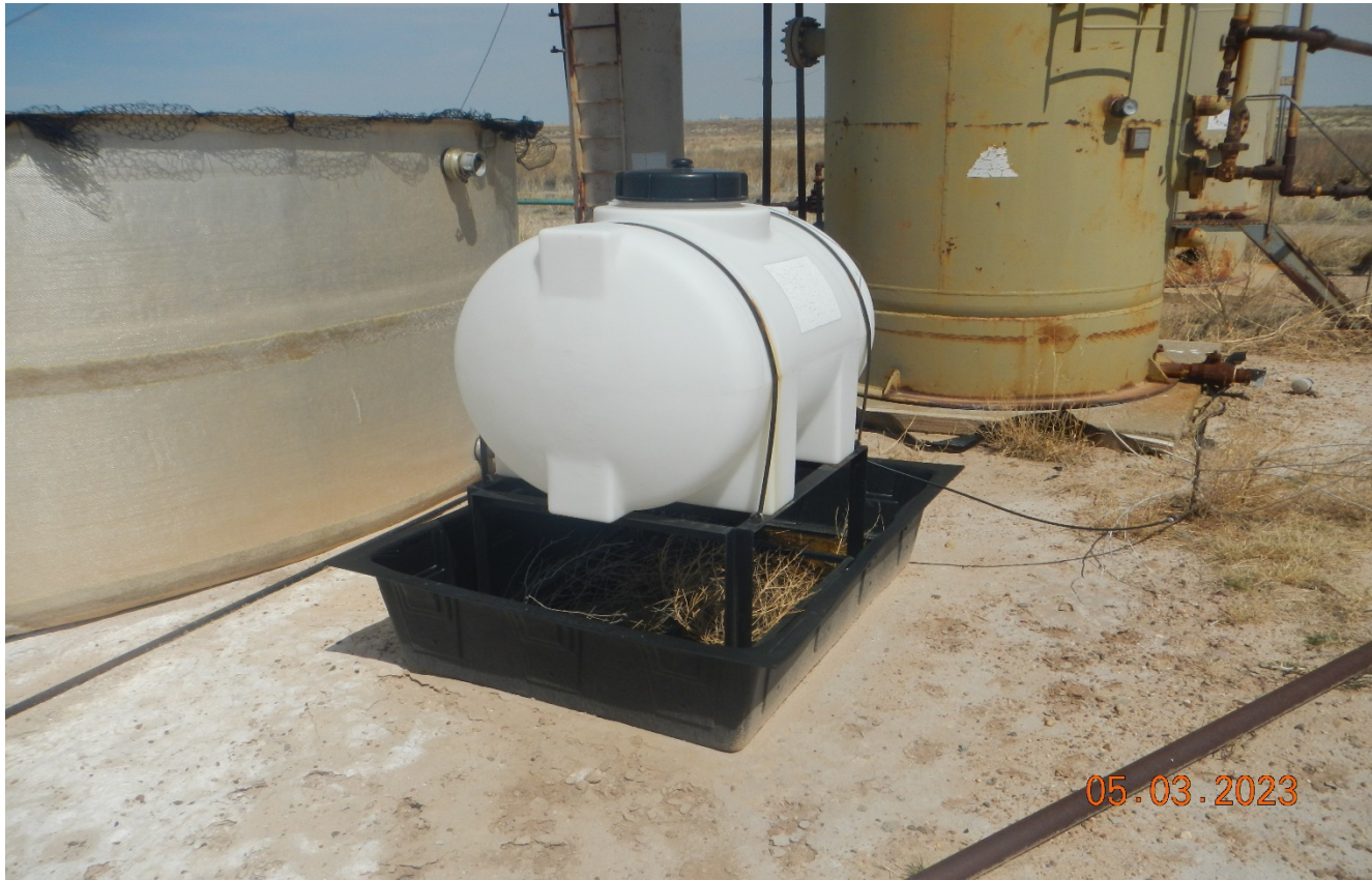
Photo 6. There is a new tank installed but the labeling is faded on the container so contents are unknown.