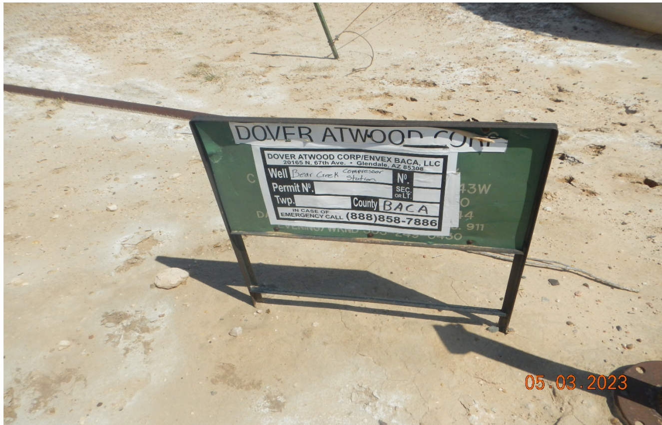
Photo 3. The facility sign is obscured behind the compressor. The sign does not meet the requirements and is not legible. Previous corrective action is not completed.