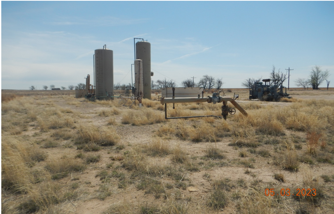
Photo 14. Facing east toward the facility.