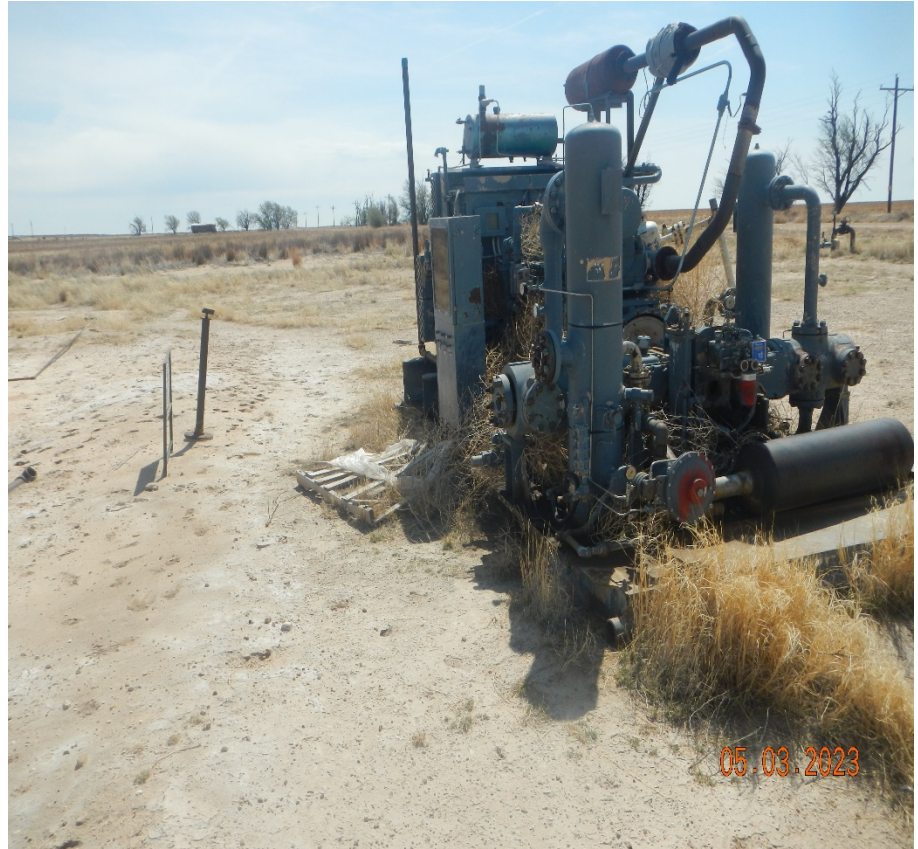
Photo 2. There is an unused compressor stored on location that need to be removed. The compressor engine has various unconnected parts and does not appear to be functional. Previous corrective action is not completed.