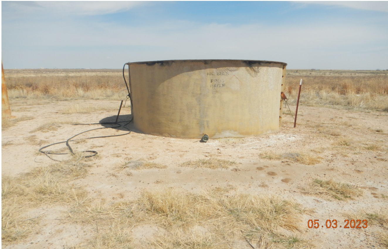
Photo 9. There is an open top tank at the east side of the location. It appears the tank has previously leaked due to white stained soil. There is no secondary containment around the tank. The signage has faded. Previous corrective action is not completed.