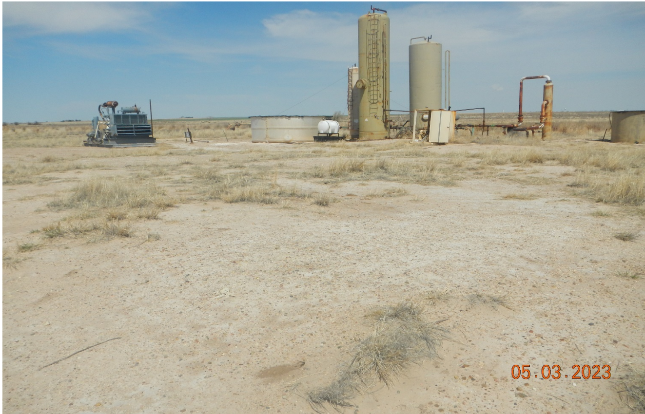
Photo 15. Facing north toward the facility. The surrounding disturbance area has areas that are bare of vegetation that need to be reclaimed per Rule 1003.