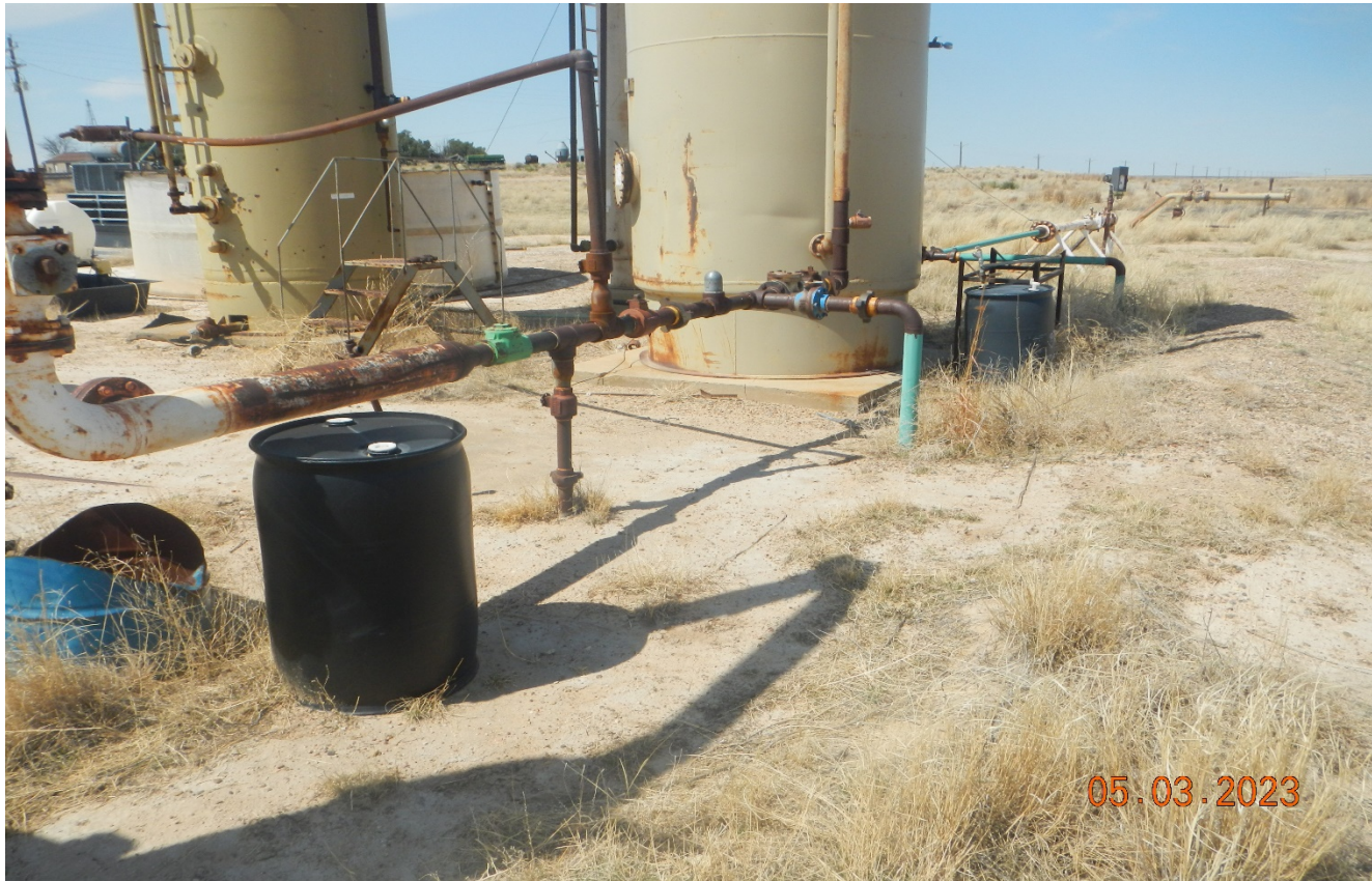
Photo 13. There is unused supplies and a black barrels with no labeling. There are weeds and vegetation around the equipment which is a fire hazard. Previous corrective action is not completed.