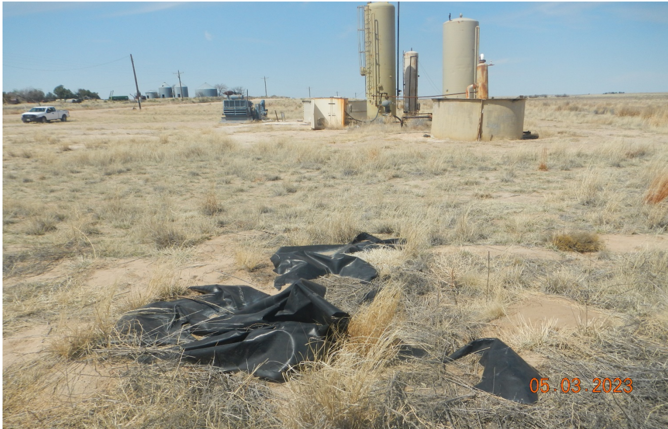
Photo 12. Facing west toward the location. There is a plastic liner debris at east side of the location that needs to be removed.