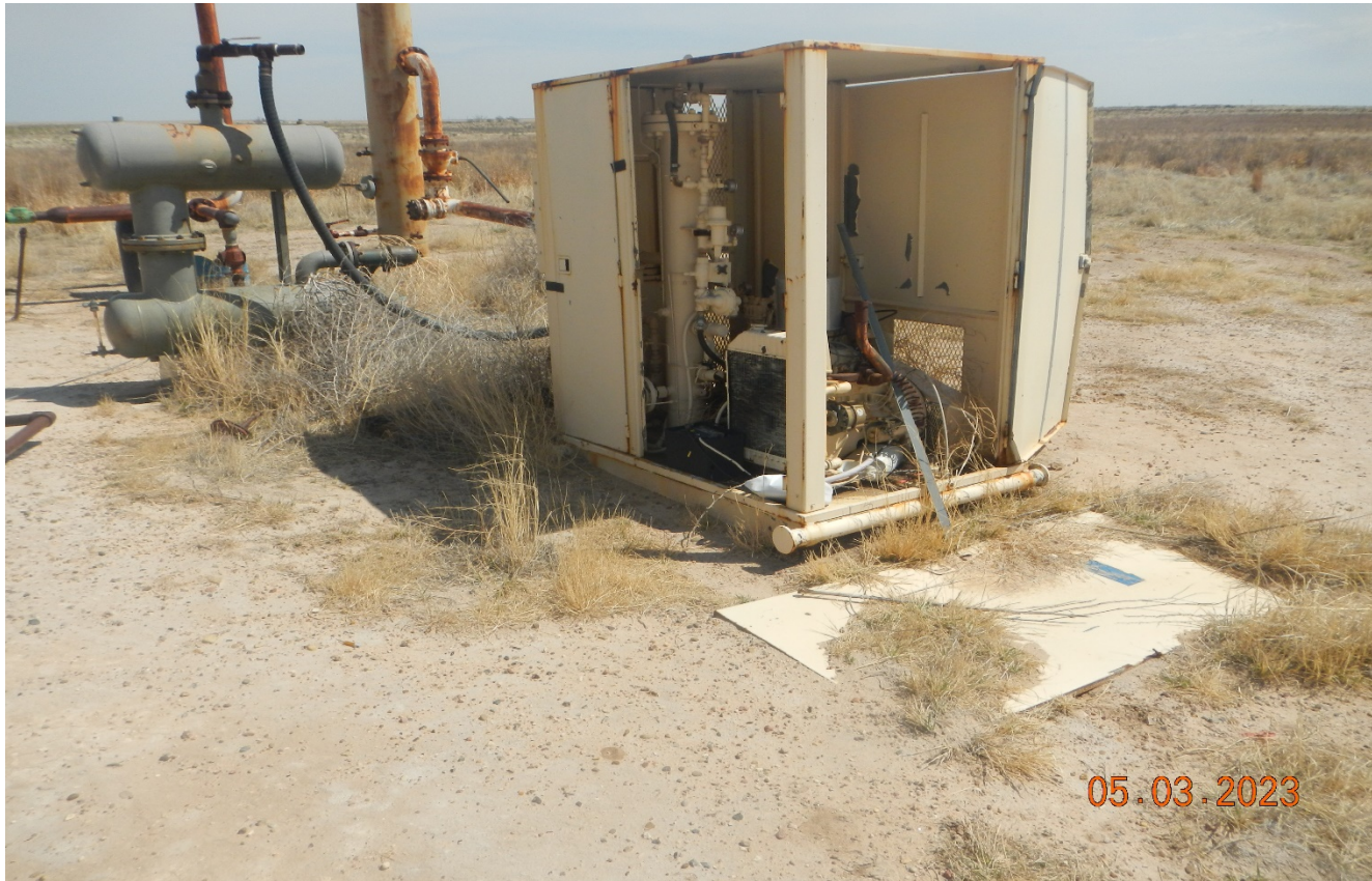
Photo 7. There is equipment not maintained on location. Door has fallen off this shed. Previous corrective action is not completed.