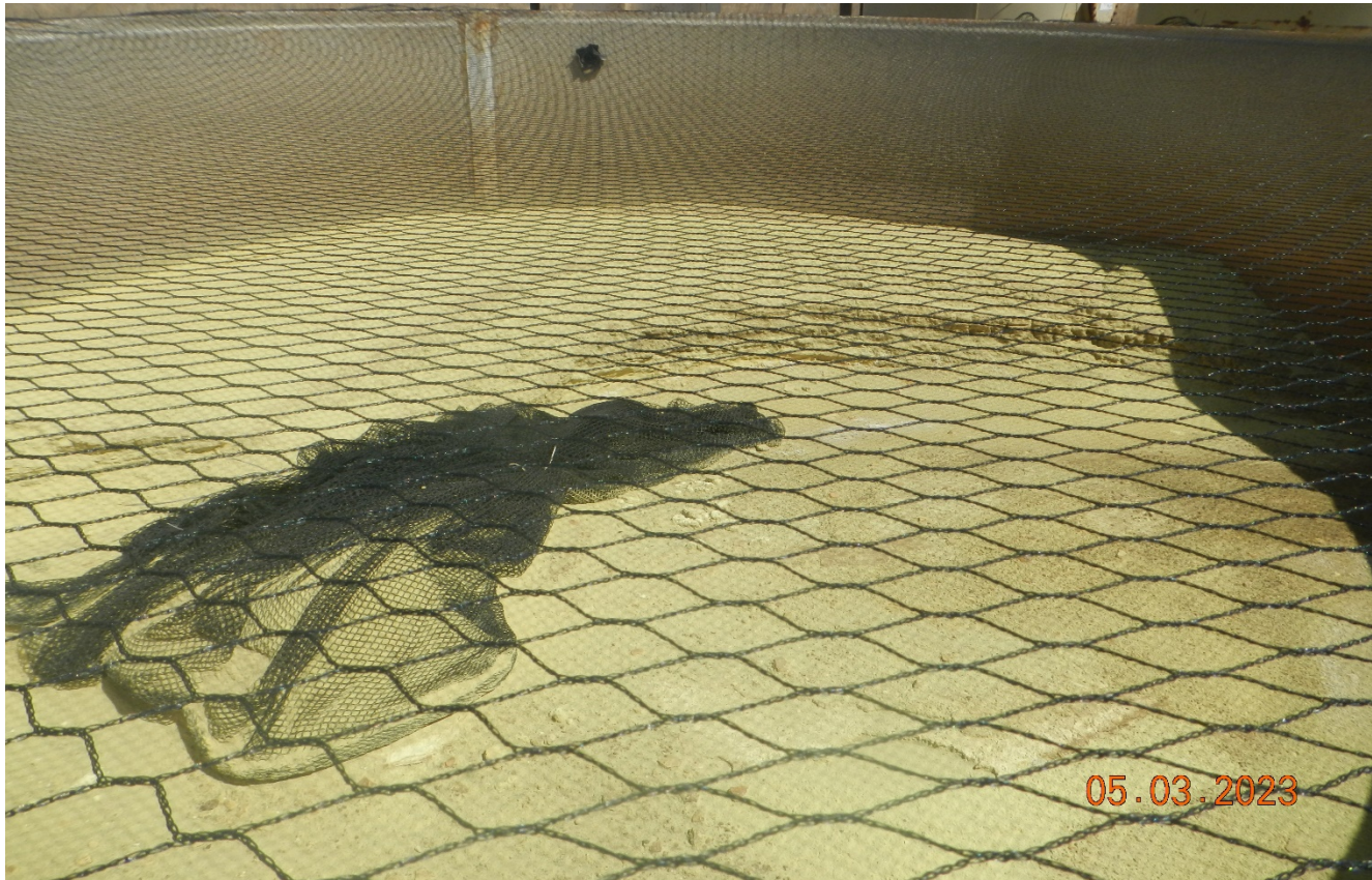
Photo 5. The netting over the tank has been reinstalled.