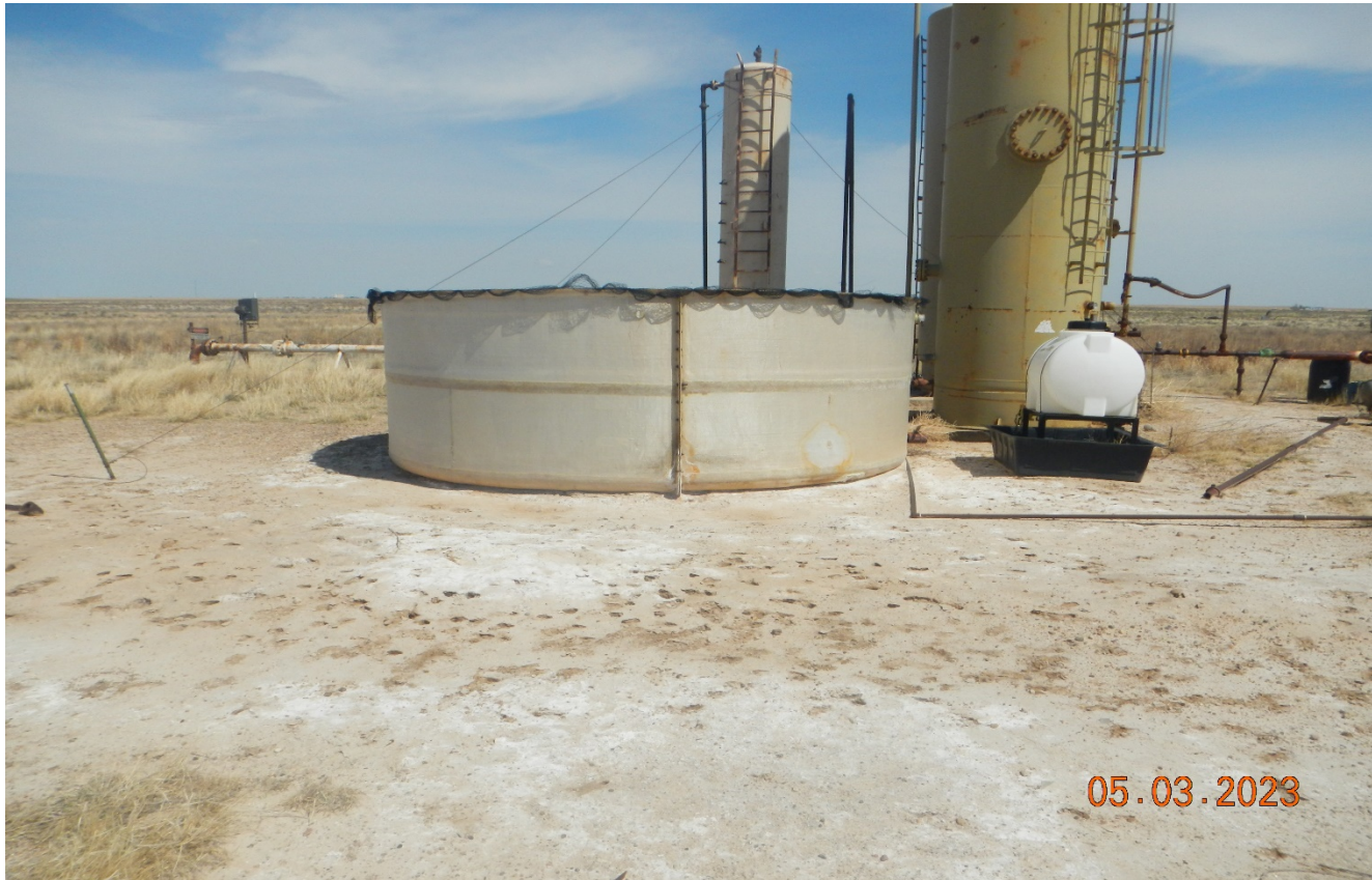
Photo 4. Facing toward the open top tank. It appears the tank has previously leaked due to white stained soil. There is no secondary containment around the tank. There is no signage on the tank. Previous corrective action is not completed.