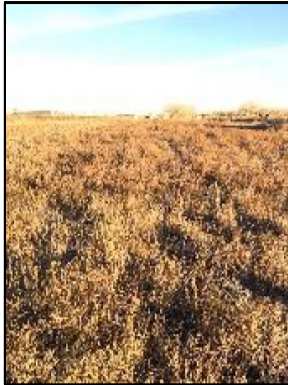
Photo 1. Photo point for the former Anderson 1,2 & Battery production facility before work was completed on March 30, 2023.