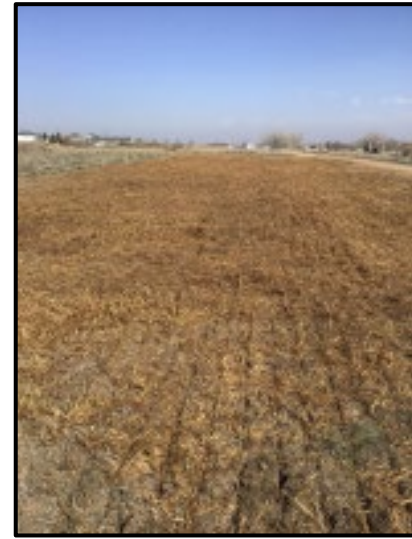
Photo 2. Photo point for the former Anderson 1,2 & Battery production facility after work was completed on March 30, 2023.