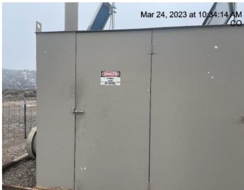
Photo # 3124 From Inspection 708900164 conducted on 03/24/2023 Meter calibration info not conspicuously posted