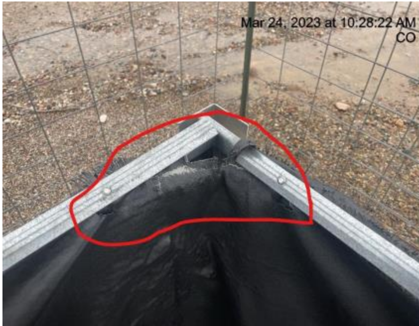
Photo # 3119 From Inspection 708900164 conducted on 03/24/2023 Containment needs maintenance