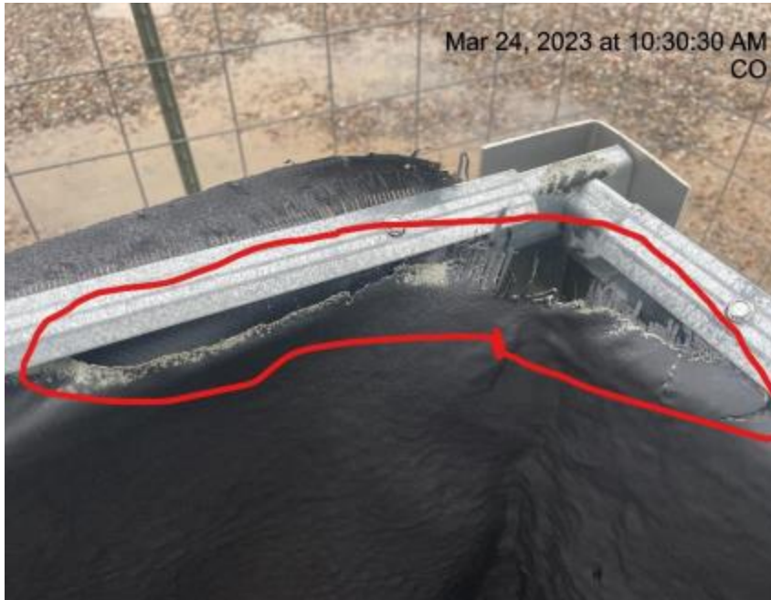
Photo # 3120 From Inspection 708900164 conducted on 03/24/2023 Containment needs maintenance