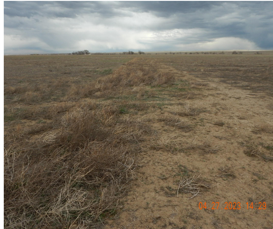
Photo 3. Photo taken along a portion of the well location access road, facing East. Photo illustrates the access road is mostly bare ground and weedy, annual vegetation.