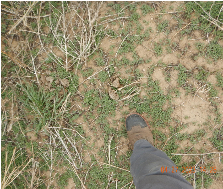
Photo 4. Close up photo illustrates Kochia establishment and little to no germination of desirable plant species.