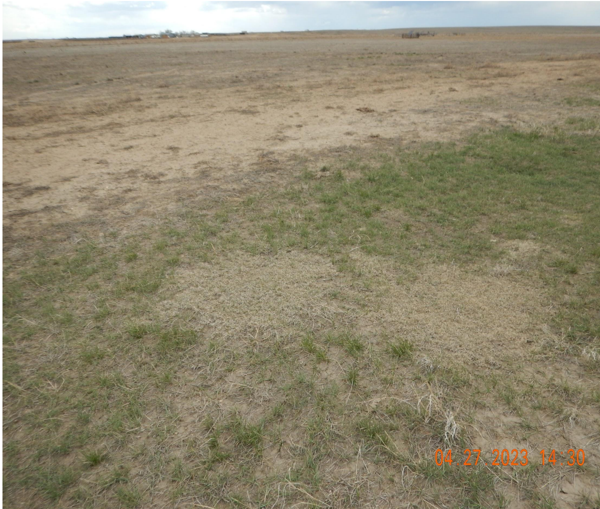
Photo 8. Reference photo taken along a portion of the well location access road, facing East. Photo illustrates the reference vegetation in the foreground with a portion of the well location access road in the background.