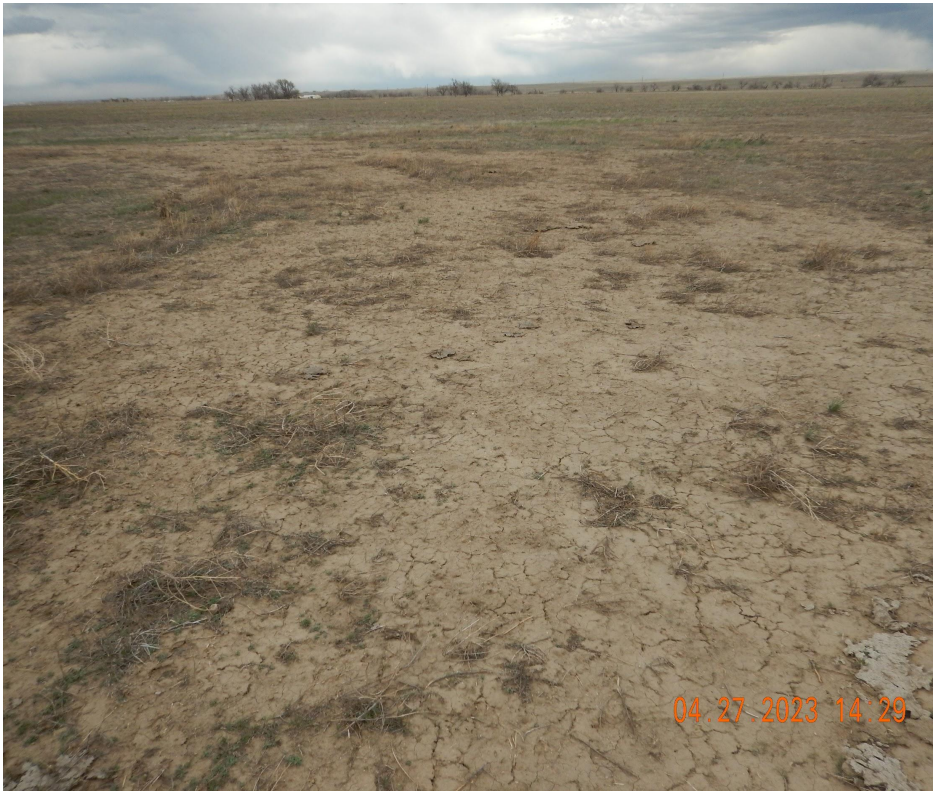
Photo 6. Photo taken from the well location, facing East. See comments under Photo 3.