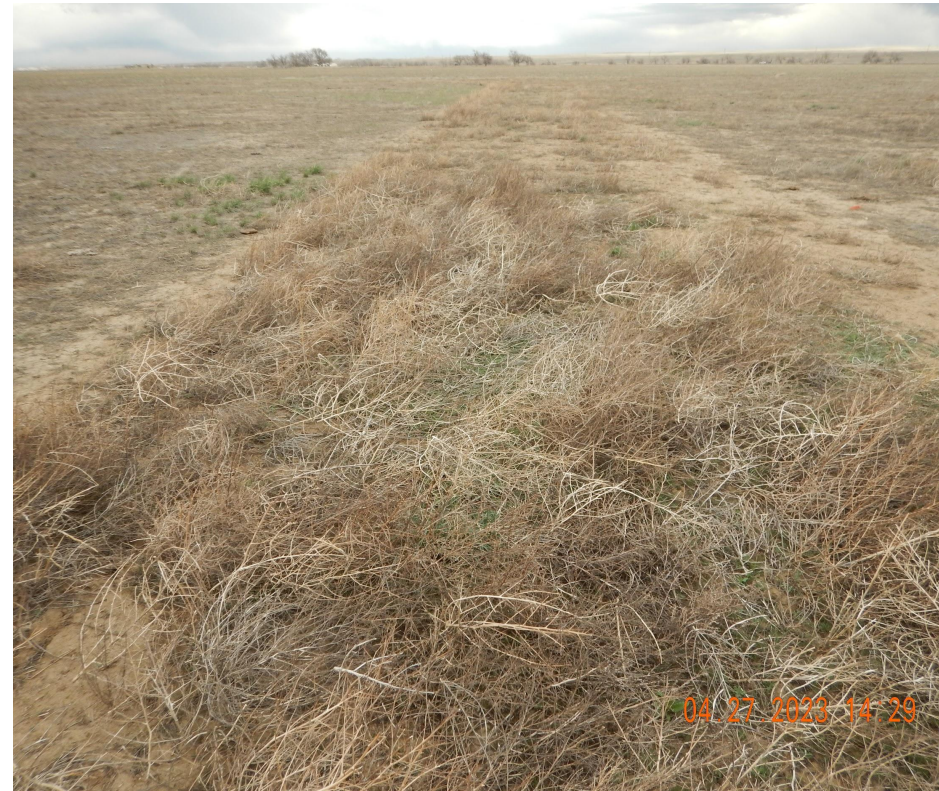
Photo 5. Photo taken along a portion of the well location access road, facing East. See comments under Photo 3.