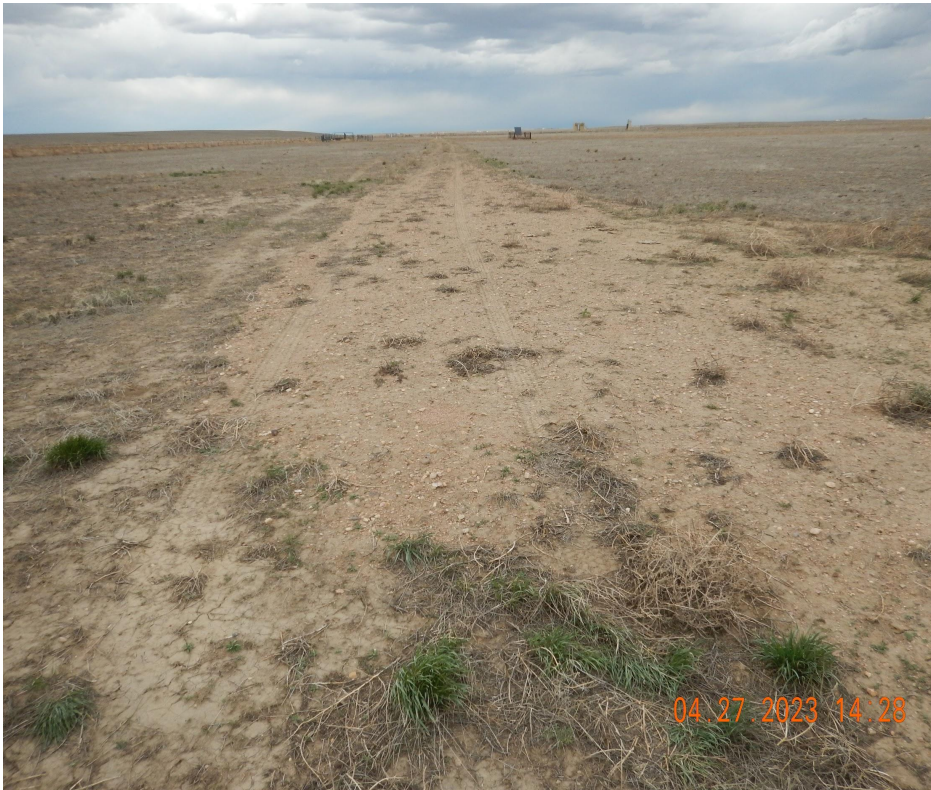
Photo 2. Photo taken from the southern well location access road, facing North. Photo illustrates gravel has not been removed as illustrated in the previous photo.