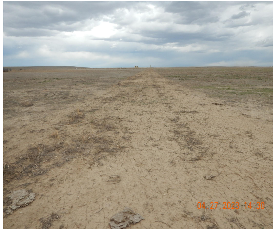
Photo 7. Photo taken along a portion of the well location access road, facing North. See comments under Photo 3.