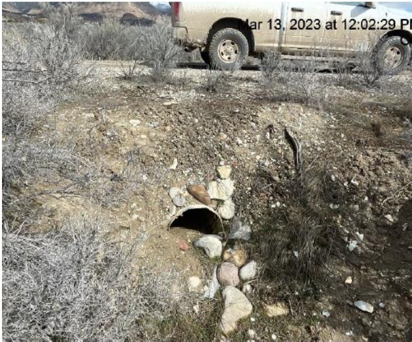
Photo # 2223 From Inspection 708900108 conducted on 03/13/2023 Culvert needs maintenance