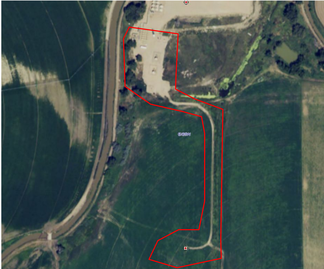
Photo 1. COGCC GISOnline aerial imagery from 2015 illustrates active operation, illustrating the tank battery, access road, and well location.