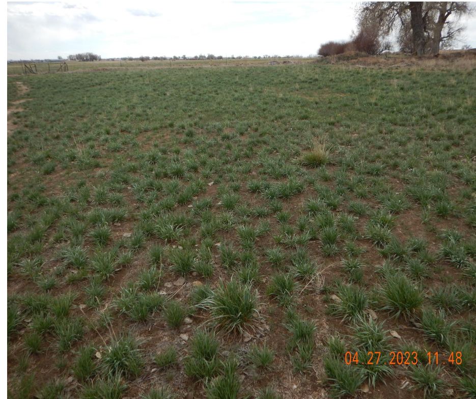
Photo 6. Photo taken from the associated offsite tank battery, facing South. See comments under Photo 3.

Note- surface owner appears to be using portions of the well location access road for agricultural purposes.