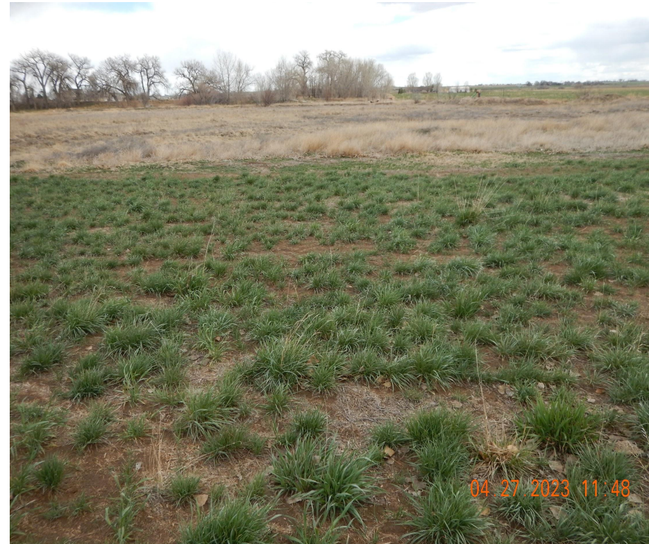
Photo 4. Photo taken from the associated offsite tank battery, facing East. See comments under Photo 3.