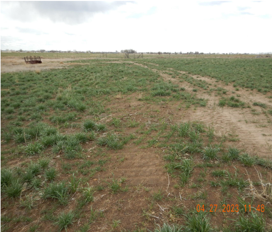
Photo 5. Photo taken from the associated offsite tank battery, facing Southeast. See comments under Photo 3.