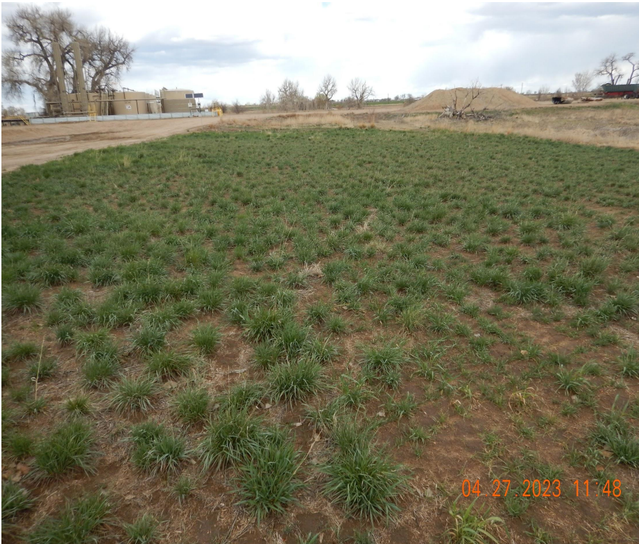
Photo 3. Photo taken from the associated offsite tank battery, facing North. Photo illustrates the Operator has performed final reclamation at the tank battery and has met Rule 1004 standards.