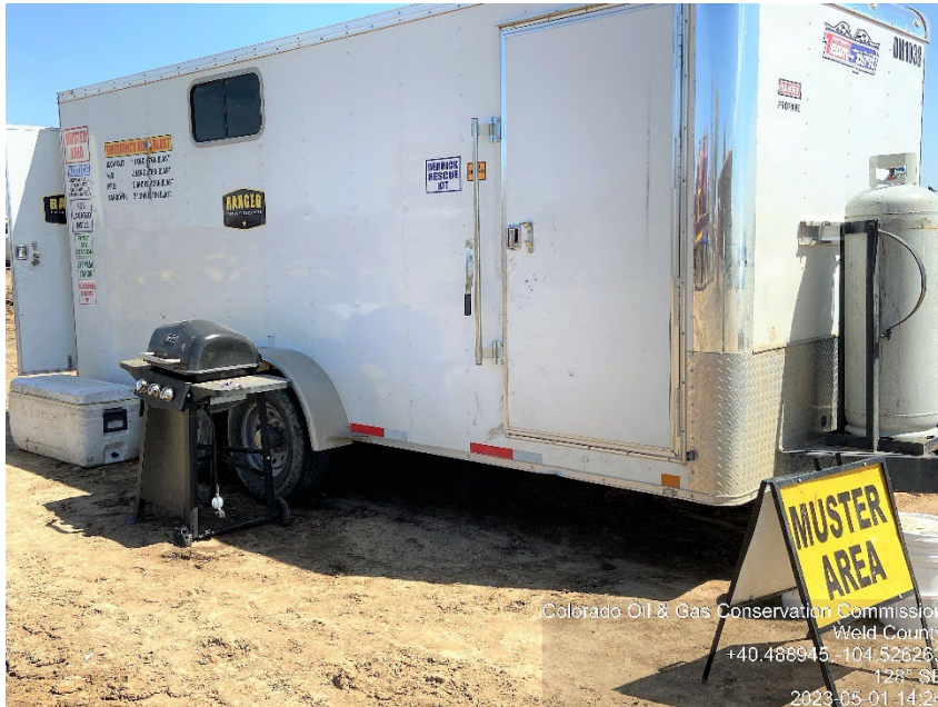
Photo #3 Rayglo A15-68-1HN Wellsite Plugged & Abandoned | PA Plugging Ops: Cementing: Final plugs / cement to surface Jobsite safety signage