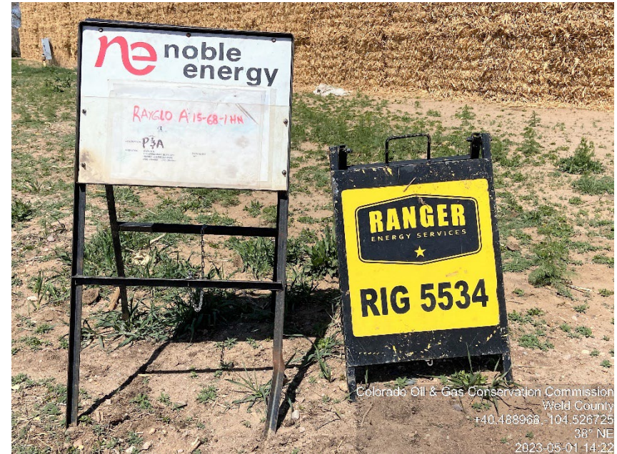
Photo #4 Rayglo A15-68-1HN Wellsite Plugged & Abandoned | PA Plugging Ops: Cementing: Final plugs / cement to surface Wellsite entrance