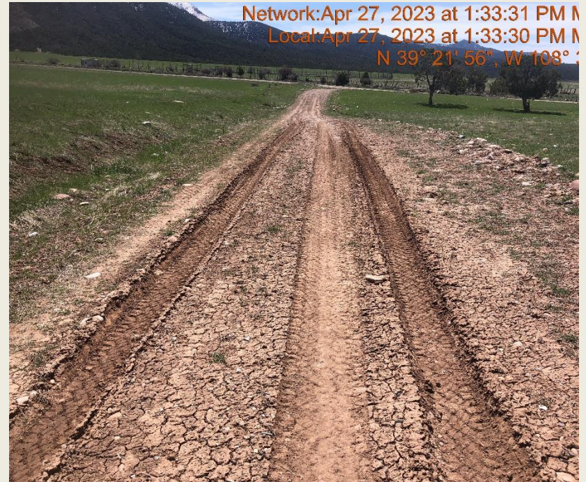
Photo #9789 Insufficient tracking BMP at entrance to access roads.