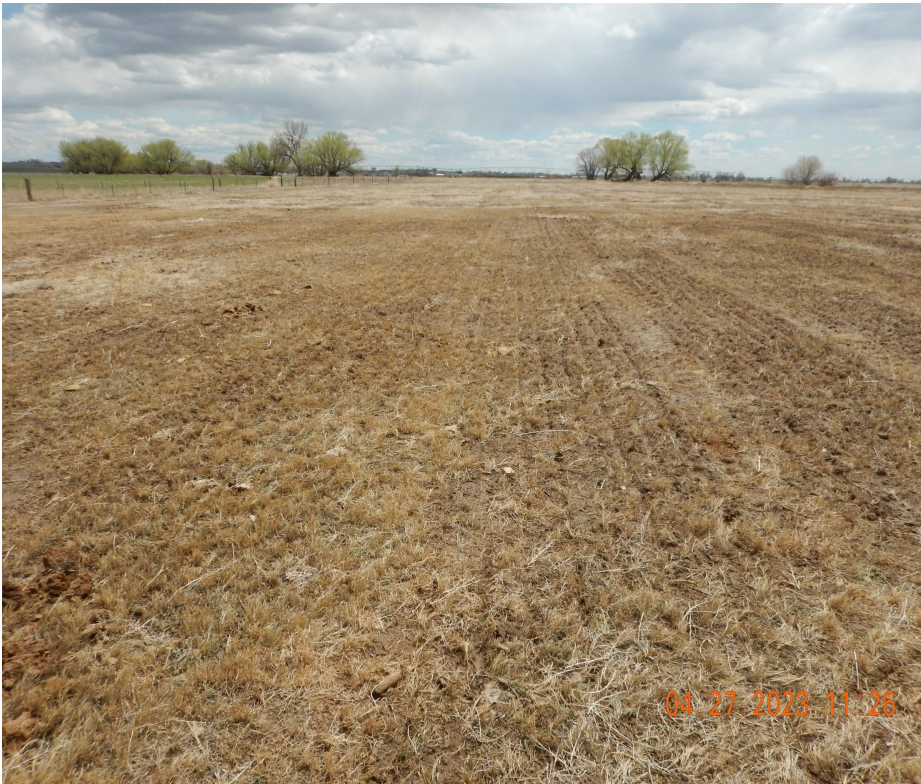
Photo 5. Reference photo taken from the well location, facing West. See comments under Photo 1.