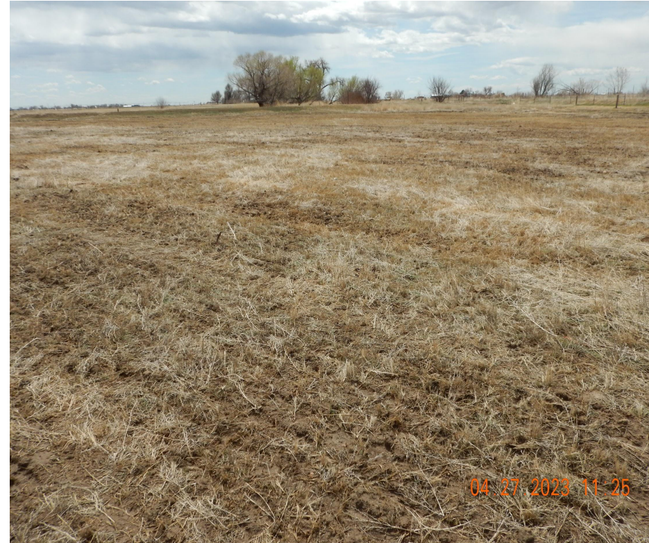
Photo 2. Photo taken from the well location, facing South. See comments under Photo 1.