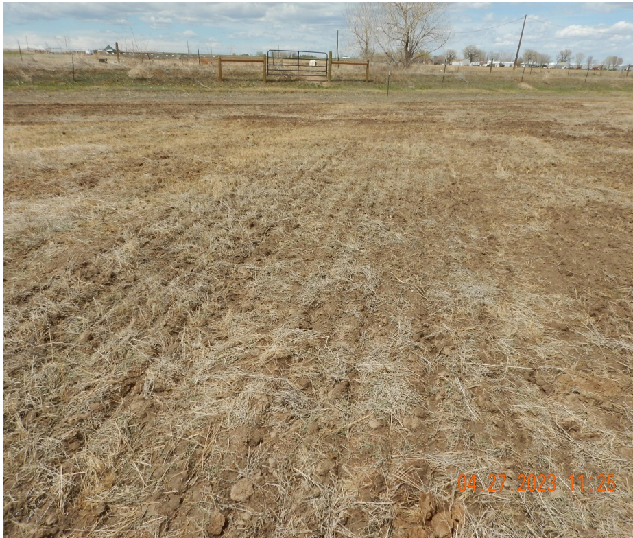
Photo 3. Photo taken from the well location, facing West. See comments under Photo 1.