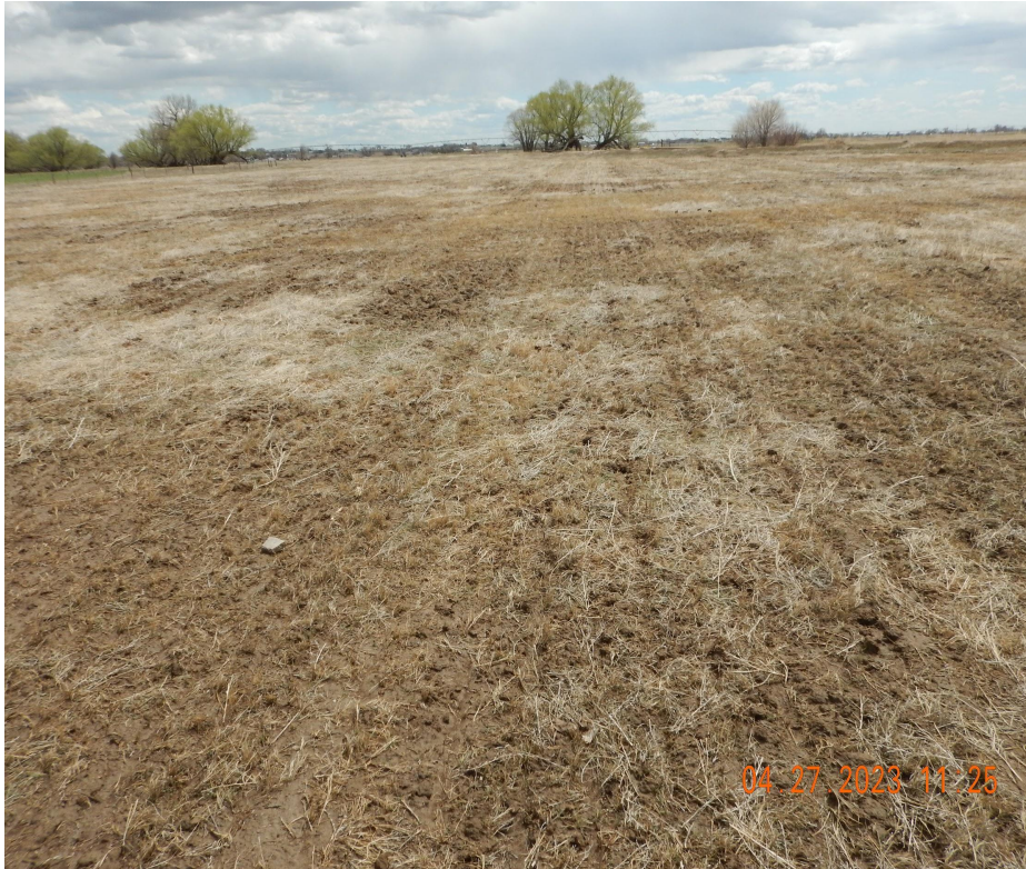
Photo 1. Photo taken from the well location, facing East. Photo illustrates the surface owner has reseeded the entire corner portion.