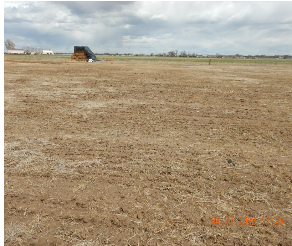
Photo 4. Photo taken from the well location, facing North. See comments under Photo 1.