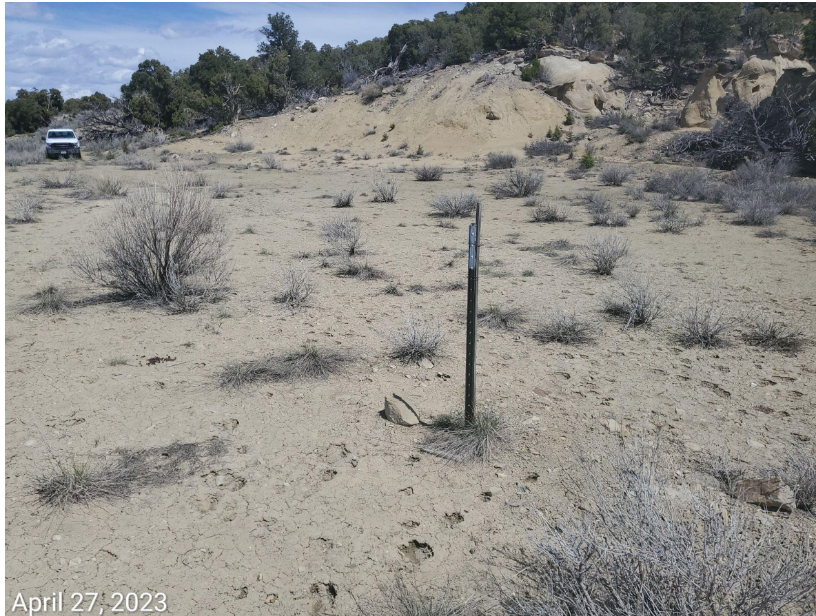
Photo 4: Photo shows well marker. Well has not been drilled. All Form 2 and Federal permits to drill have expired.