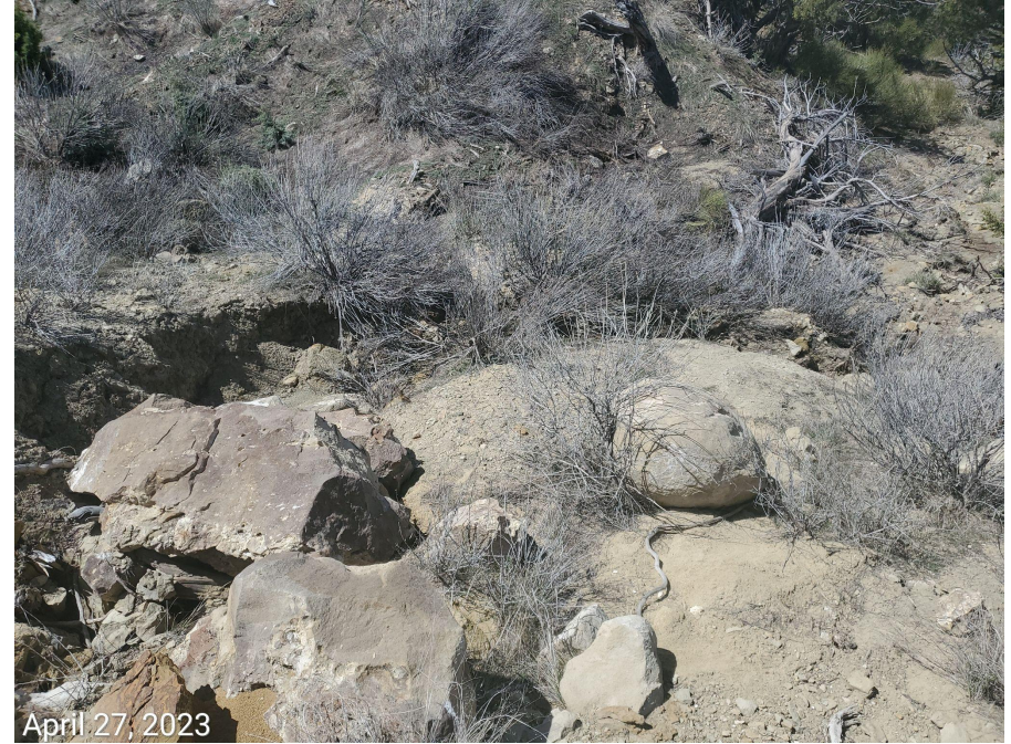
Photo 5: Photos taken from the north end of the Location. Photo shows stormwater runoff from the location has resulted in gully erosion at the slopes of the Location; BMPs to allow for proper stormwater discharge in such a manner as to minimize erosion, degradation and off-site sediment transport inadequate.