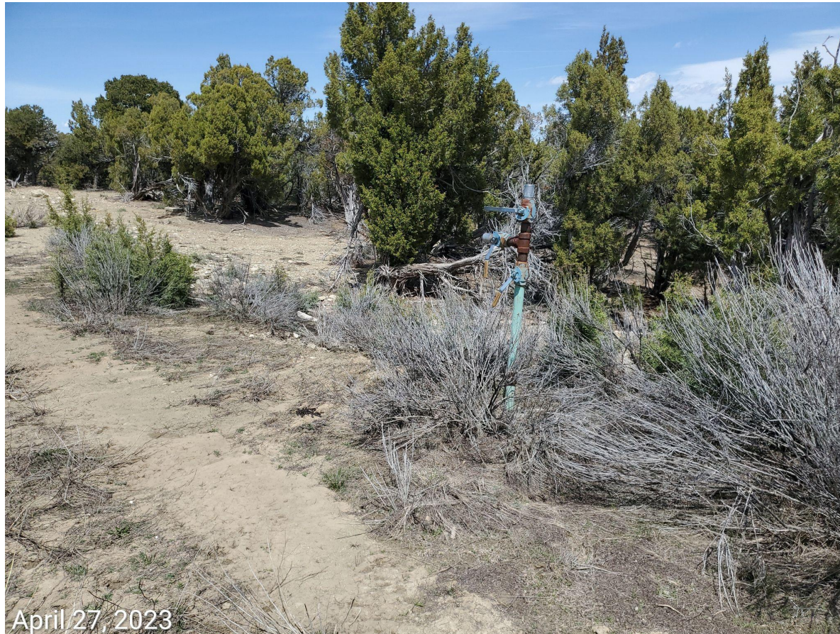
Photo 9: Example of surface equipment remaining along access road.