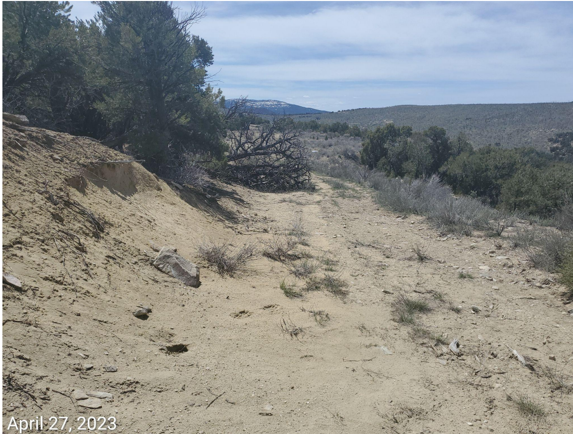
Photo 8: Photo taken from the access road. Fallen tree partially blocking access road. Photo also example showing cut slopes of the access road lack stabilization, resulting in erosion degradation and sediment deposition onto the road.