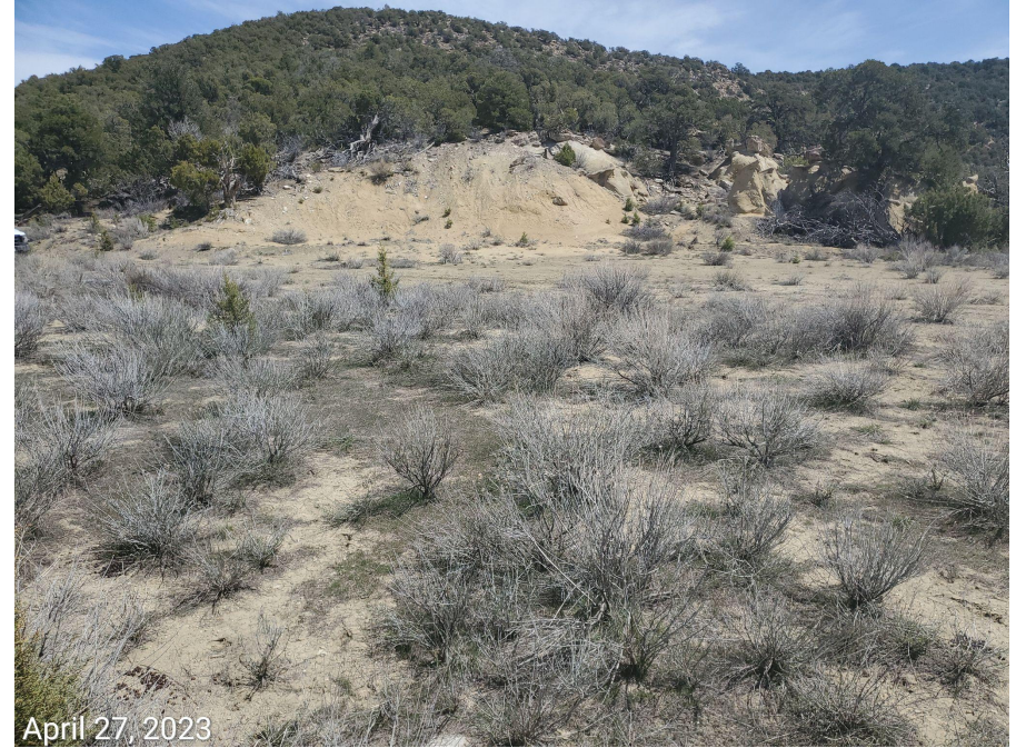
Photo 1: Photos 1-2 taken from the northwest end of the Location. Photos provide an overview of the Location from northeast, southeast, south to southwest. Photos show final reclamation including, but not limited to, compaction alleviation, recontouring/regrading and reclaiming has not been conducted on the Location.