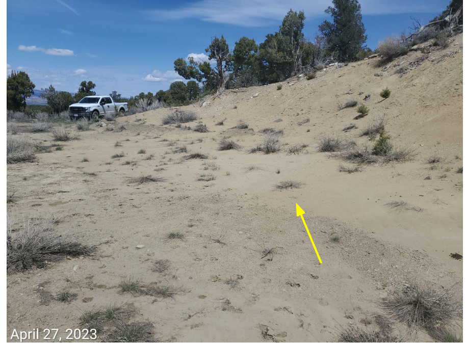
Photo 7: Photos taken from the cut slopes on the northeast end on the Location. Photos examples showing cut slopes lack stabilization. BMPs to minimize erosion, degradation and sediment transport missing or insufficient. Lighter soils observed at base of slopes is sediment deposition due to unstabilized cut slopes.