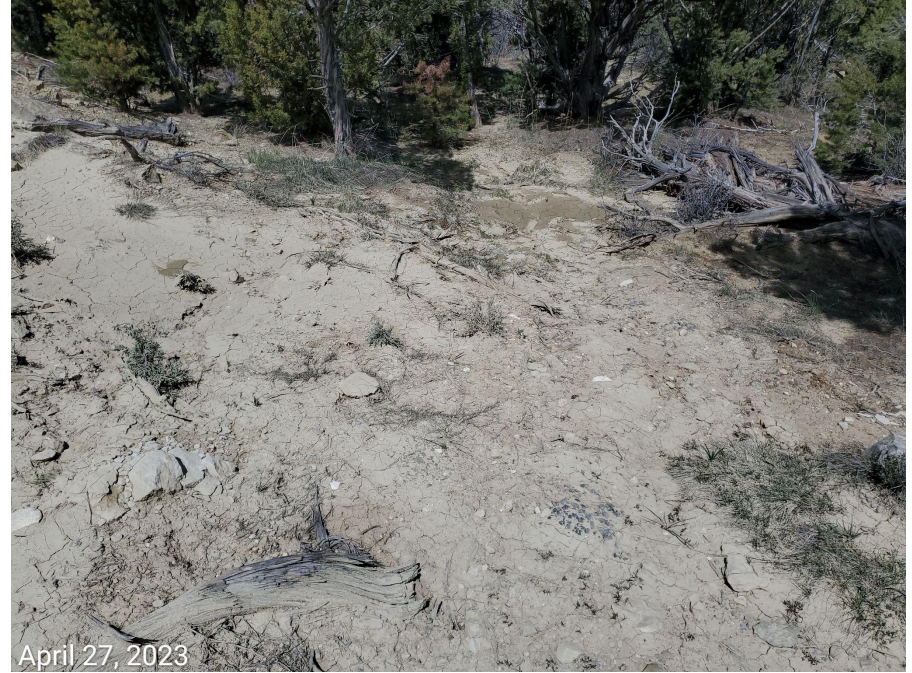
Photo 13: See comments under photo 11. Photo right shows sediment discharge/deposition from the access road.