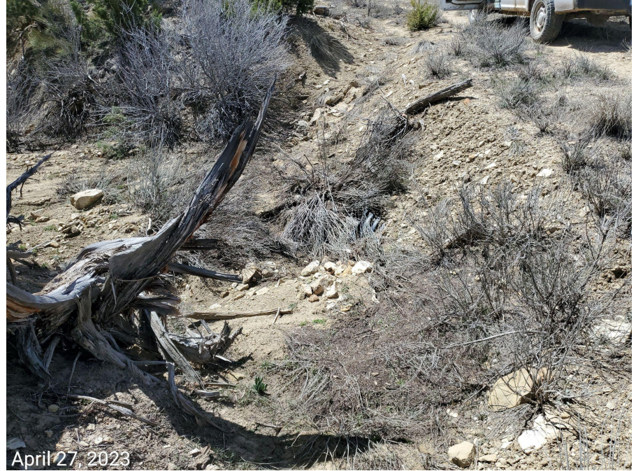
Photo 10: Photos taken from the access road. Photos examples showing final reclamation including, but not limited to, compaction alleviation, recontouring/regrading and reclaiming has not been conducted on the access road. Photos also examples of culverts observed remaining along the access road.