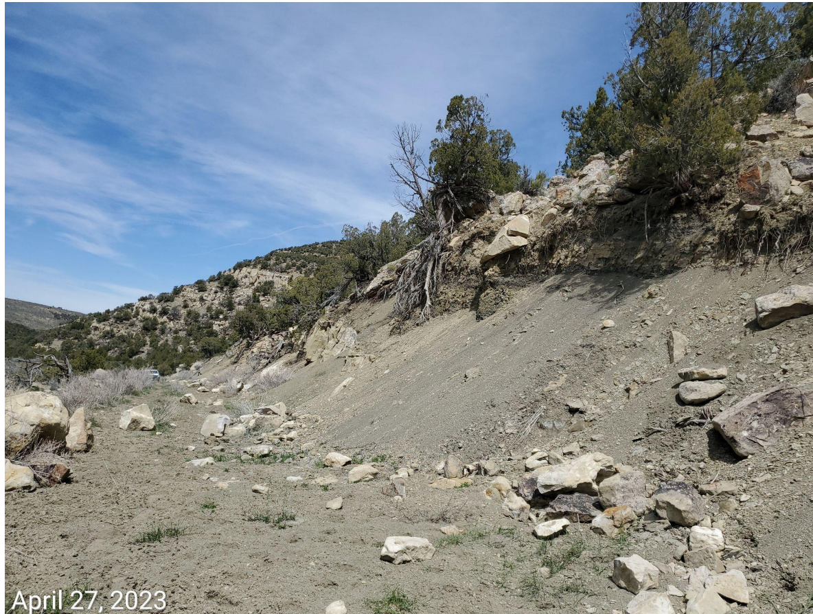
Photo 15: See comments under photo 9. Photo shows rock-falls from the unstabilized slopes has rendered the Location inaccessible by vehicle.