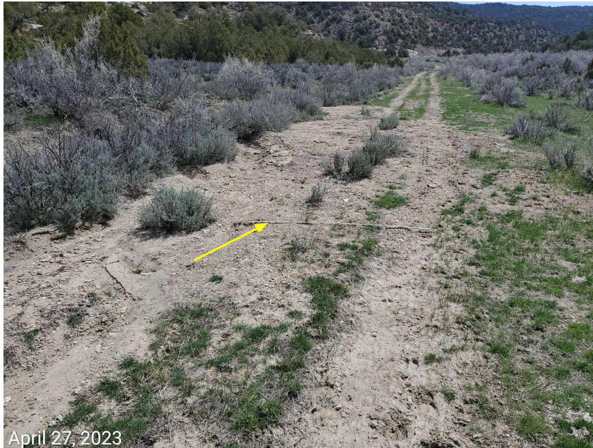
Photo 13: See comments under photo 9. Photo shows sediment deposition onto the access road due to inadequate stormwater run-on BMPs. 6 foot measuring stick for reference.