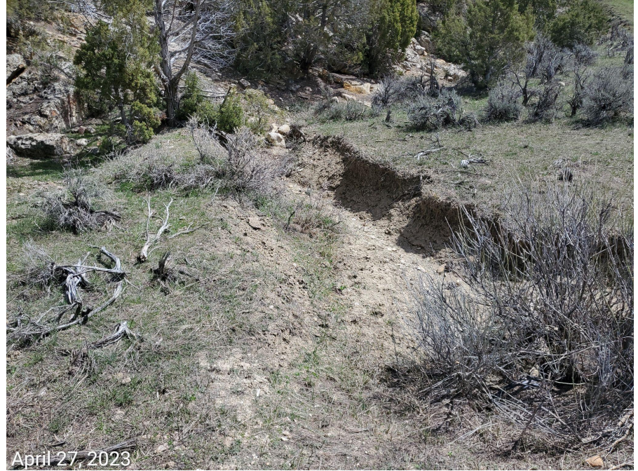
Photo 7: Photo taken from the north end of the Location. Photo shows what appears to be the stormwater run-on ditch along the northern perimeter of the Location. BMP has not been installed per good engineering practices, or maintained in proper functioning condition, and has facilitated gully erosion on the Location. Culvert within ditch appears to have filled with sediment; unable to find outlet.