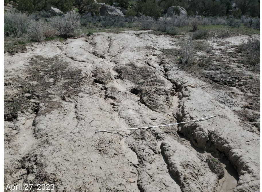
Photo 11: See comments under photo 9. 6 foot measuring stick for reference.