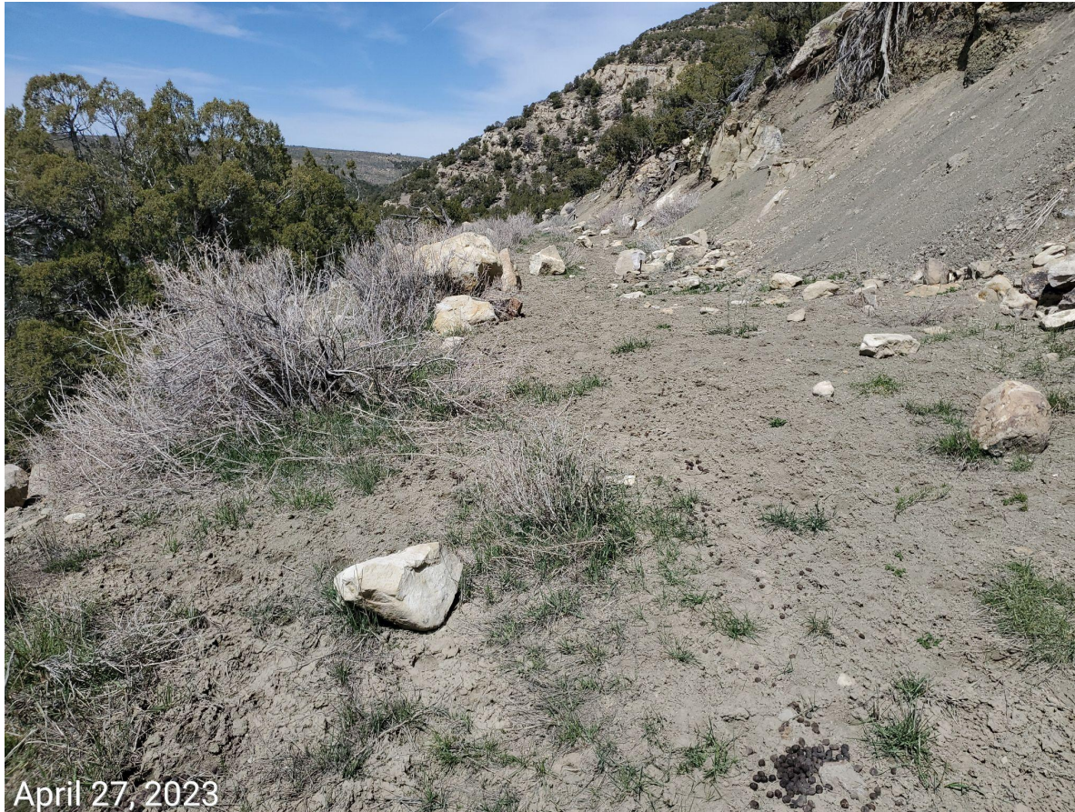
Photo 14: See comments under photo 9. Photo shows rock-falls from the unstabilized slopes has rendered the Location inaccessible by vehicle.