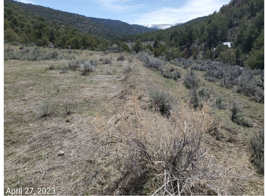
Photo 3: Photos taken from the southwest end of the Location. Photos show fill slopes remaining. Reclamation including, but not limited to, compaction alleviation, recontouring/regrading and reclaiming has not been conducted on the Location.