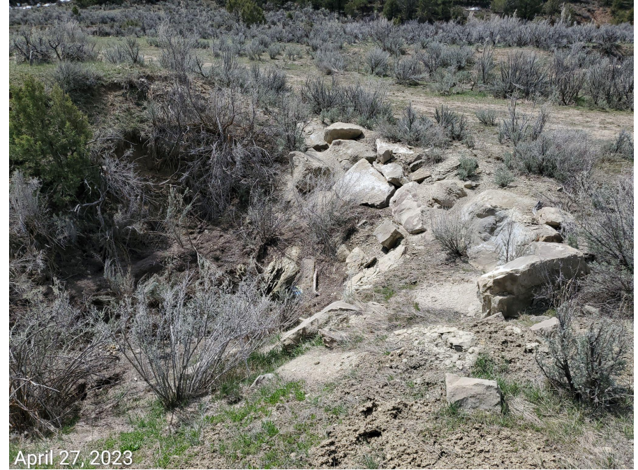
Photo 8: Photos taken from the access road. Photos examples showing final reclamation including, but not limited to, compaction alleviation, recontouring/regrading and reclaiming has not been conducted on the access road. Photos also examples of culverts observed remaining along the access road.