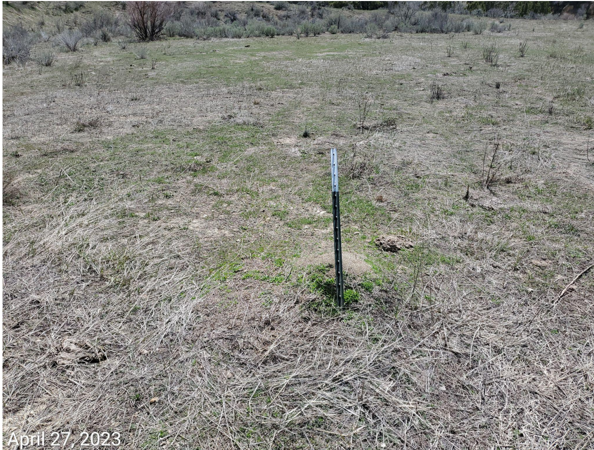
Photo 6: Well marker. Well has not been drilled. All Form 2 and Federal “permits to drill” on file for the Location have expired.