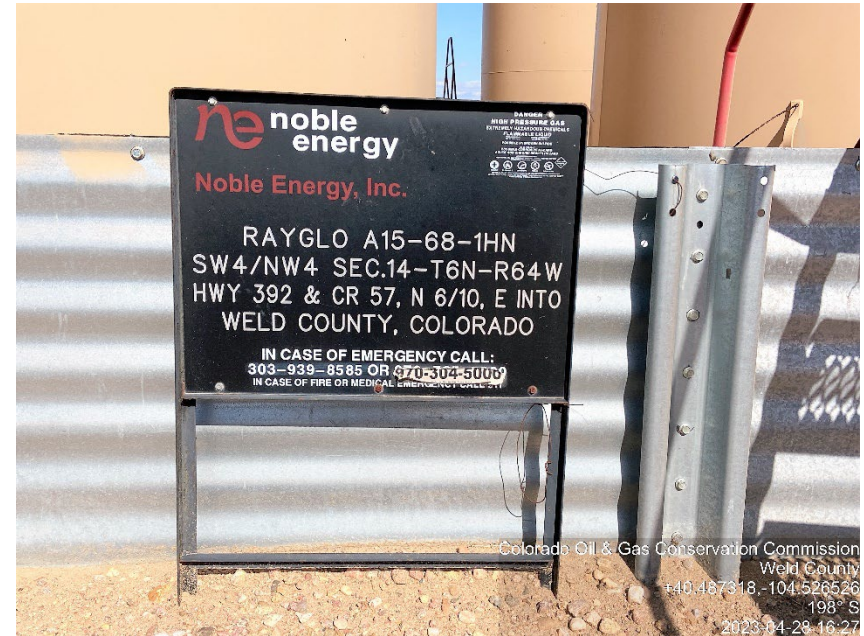
Photo #6 Rayglo A15-68-1HN Battery site Plugged & Abandoned | PA Plugging Ops: Cementing: Initial plugs Battery sign