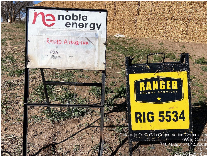
Photo #5 Rayglo A15-68-1HN Wellsite Plugged & Abandoned | PA Plugging Ops: Cementing: Initial plugs Wellsite entrance