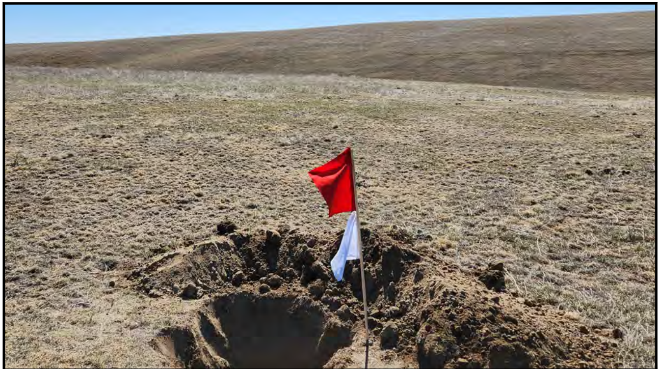
PHOTO: VIEW OF AS-DRILLED LOCATION