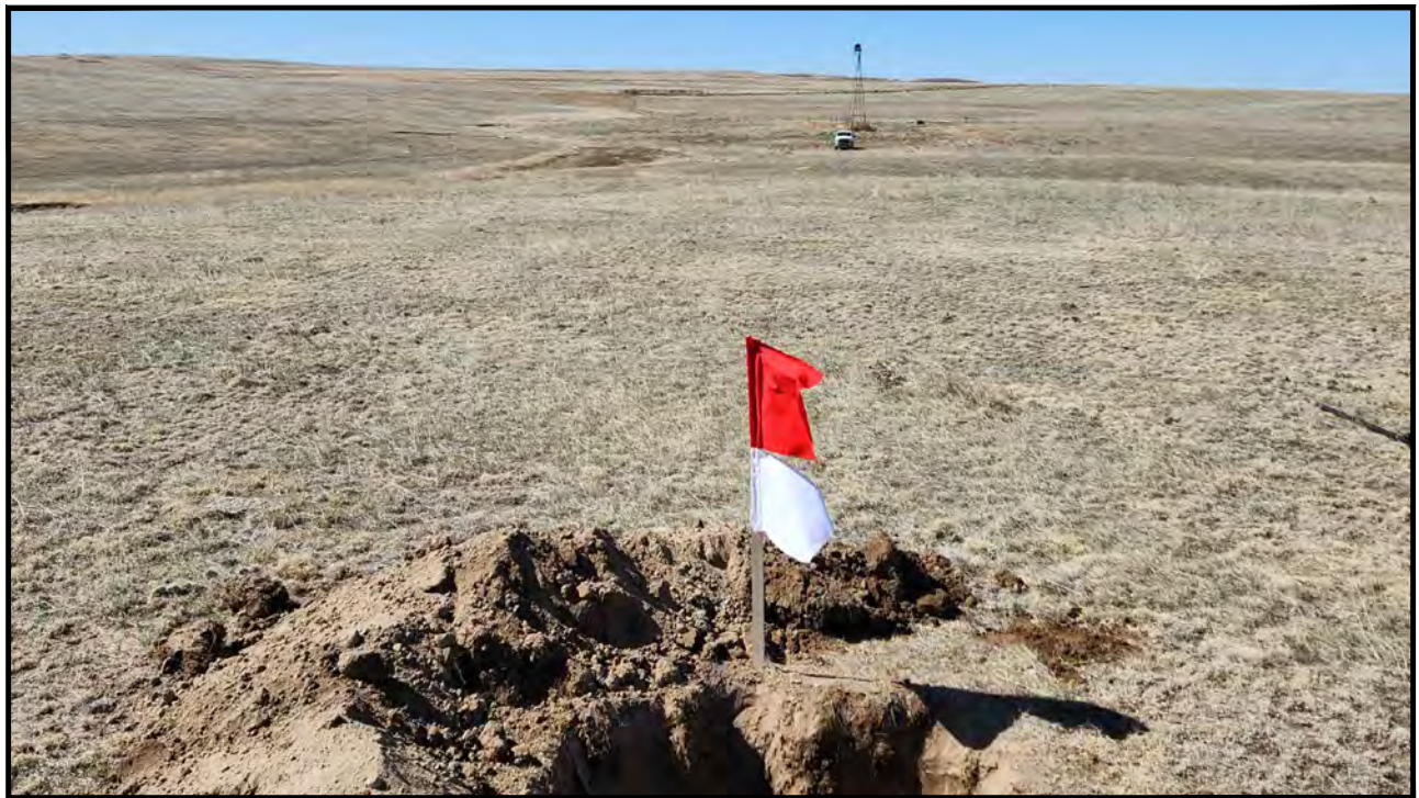
PHOTO: VIEW OF AS-DRILLED LOCATION