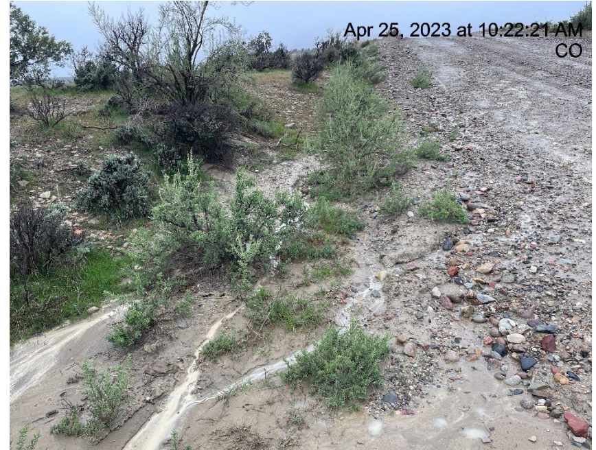
Photo # 6294 Erosion & transport of sediment off spur road into vegetation/insufficient BMP's