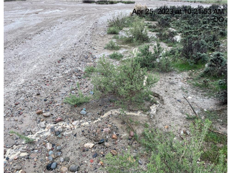
Photo # 6292 Erosion & transport of sediment off spur road into vegetation