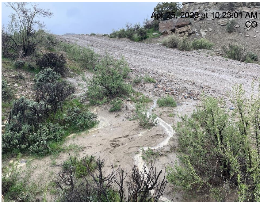
Photo # 6298 Erosion & transport of sediment off spur road into vegetation/insufficient BMP's