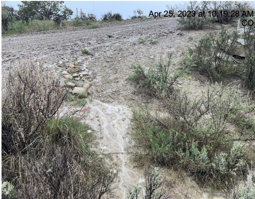
Photo # 6285 Erosion & transport of sediment off spur road into vegetation/insufficient BMP's