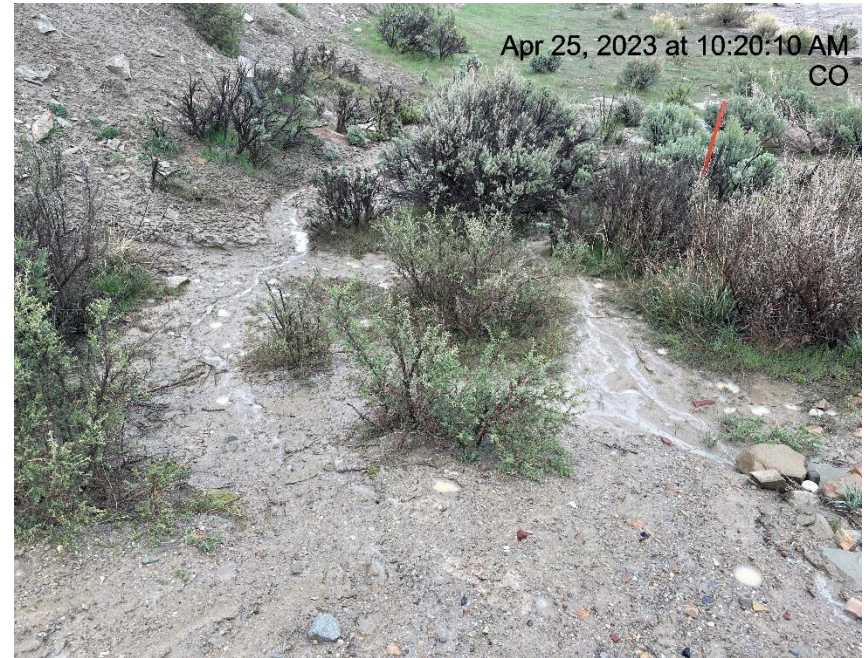
Photo # 6286 Erosion & transport of sediment off spur road into vegetation/insufficient BMP's