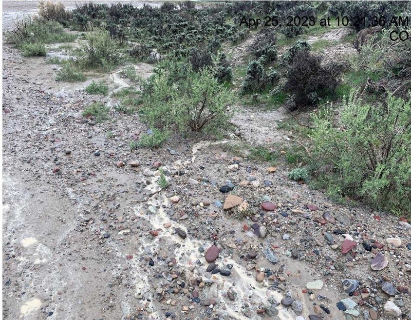
Photo # 6297 Erosion & transport of sediment off spur road into vegetation