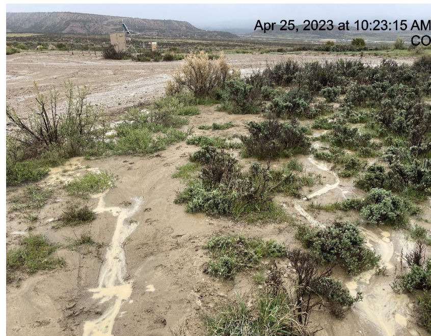
Photo # 6299 Erosion & transport of sediment off spur road into vegetation/insufficient BMP's