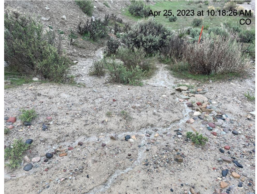
Photo # 6282 Erosion & transport of sediment off spur road & into vegetation