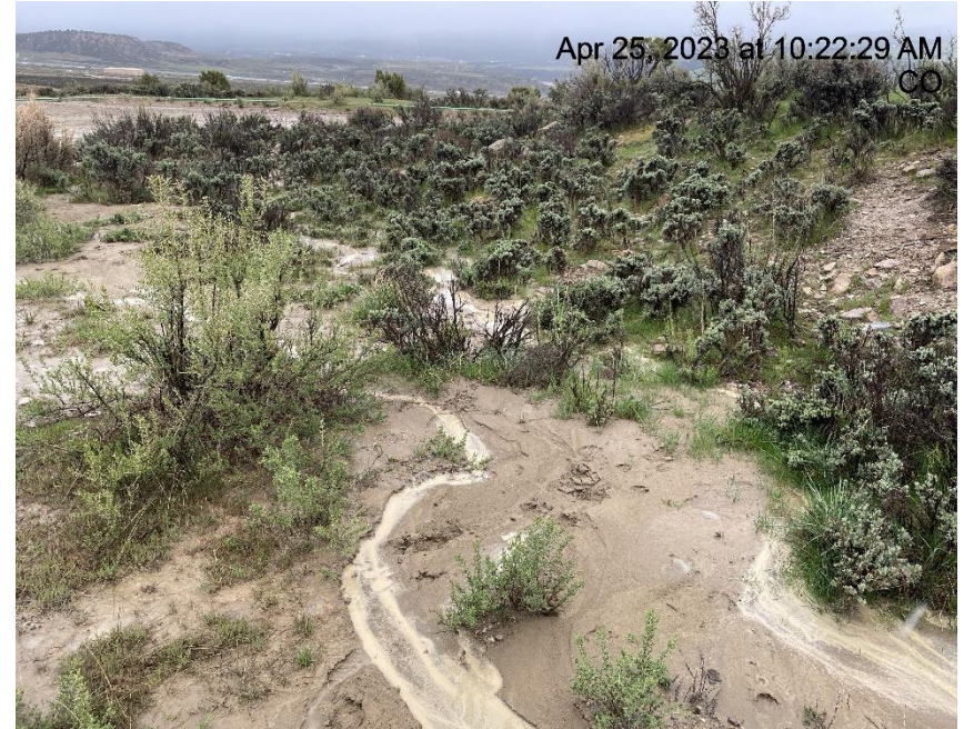
Photo # 6296 Erosion & transport of sediment off spur road into vegetation/insufficient BMP's