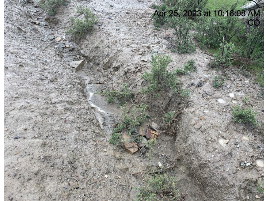
Photo # 6277 Check dam needs maintenance (in ditch along spur road)