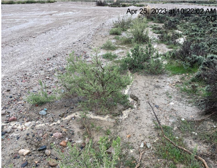
Photo # 6293 Erosion & transport of sediment off spur road into vegetation