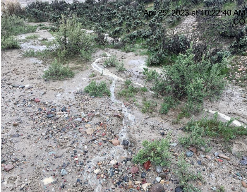
Photo # 6295 Erosion & transport of sediment off spur road into vegetation