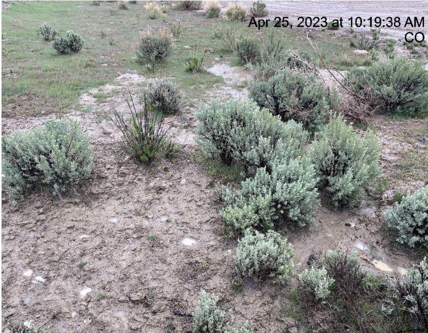
Photo # 6287 Transport of sediment off spur road into vegetation/insufficient BMP's