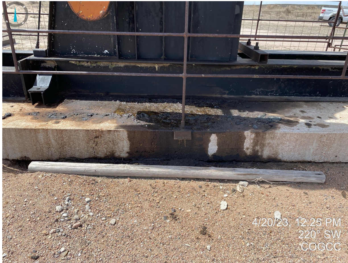
Photo 2. Stained soil observed on and next to pumpjack foundation will require proper cleanup Per Rule 905.e.