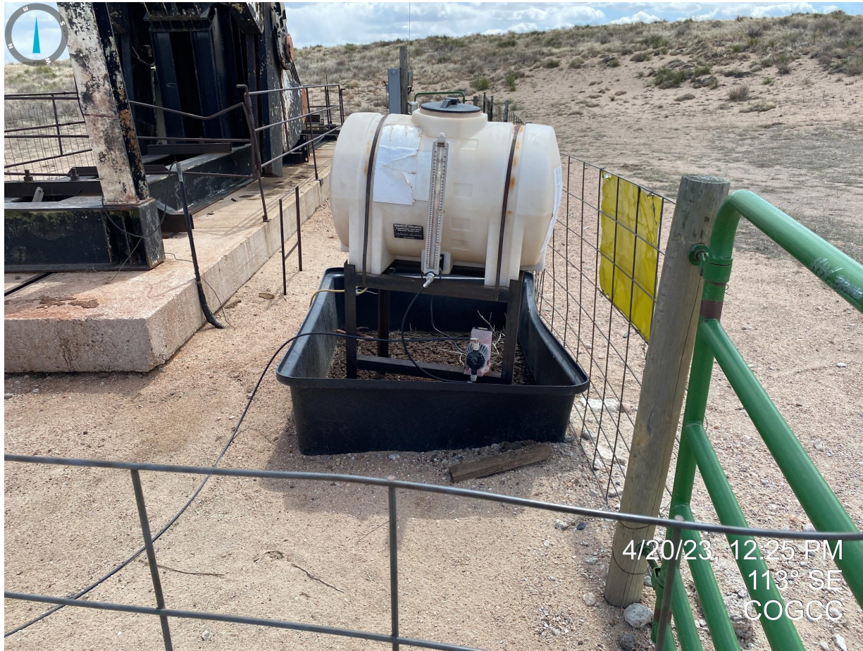
Photo 4. No wildlife netting installed on secondary containment.