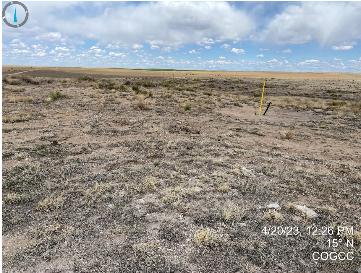
Photo 5. Interim areas are not progressing towards reclamation standards with large areas of bare soil observed around the location. Additional reclamation activities will need to be performed in order to meet Rule 1003 standards.