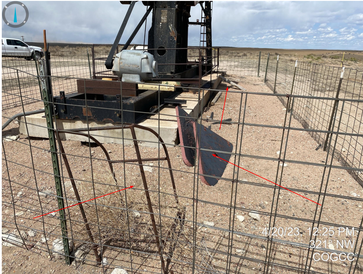
Photo 1. Unused equipment on location.