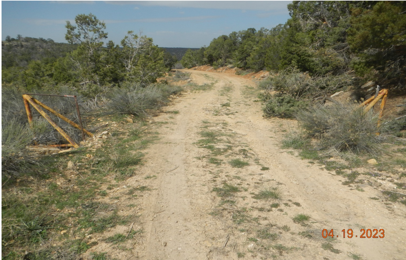
Photo 1. Facing west along the access road. There is a cattleguard that is filled in with sediment and has not been removed. There is also another cattleguard further down the road that remains.