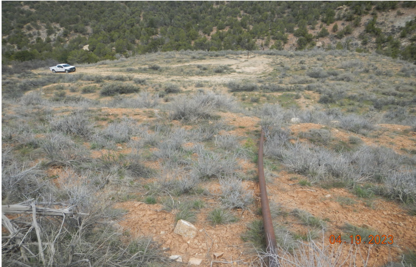
Photo 16. Standing at the top of the cut slope facing northwest.