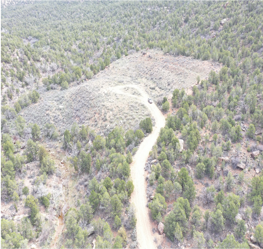
Photo 8. Drone aerial photo facing northeast toward the wellsite location.