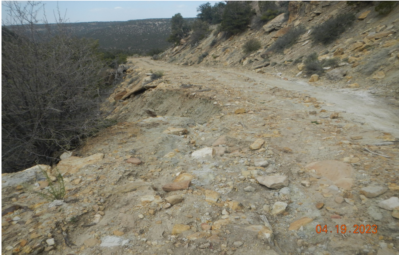
Photo 5. Facing west along the road. The road side is being washed out in this area.