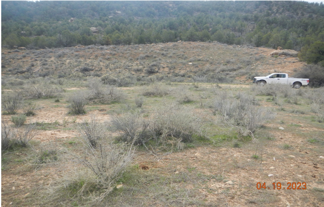
Photo 10. West side of the location facing southeast.