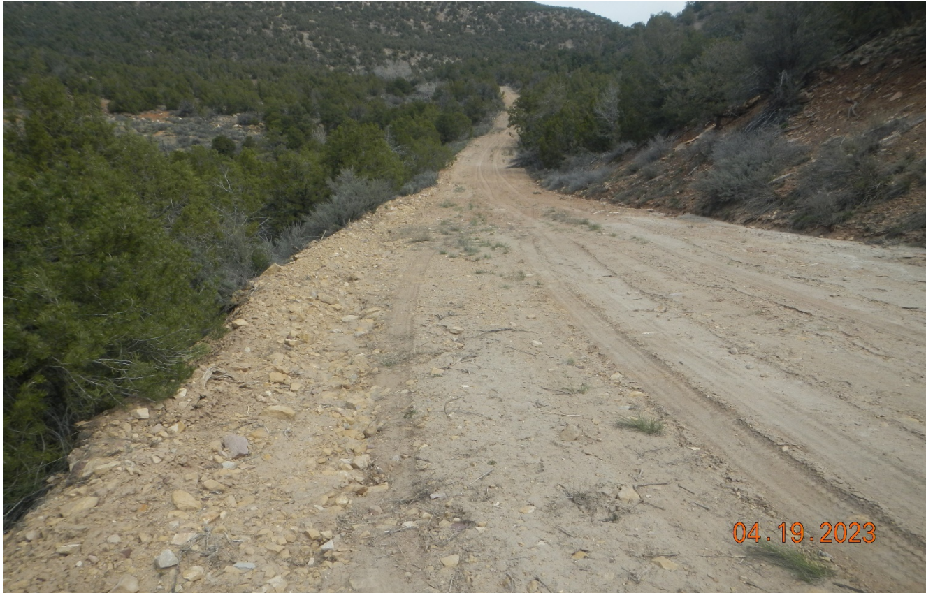
Photo 6. Facing northeast along the access road which goes into the canyon towards the wellsite location.