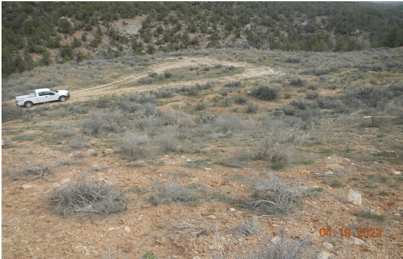
Photo 17. South side of the cut slope facing north.