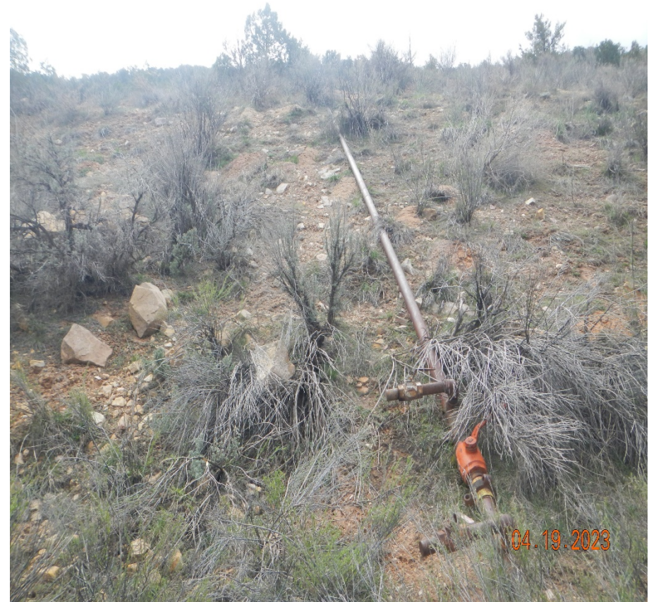
Photo 15. View of above ground flow line which goes up the hill towards the Federal 2-19 wellsite.