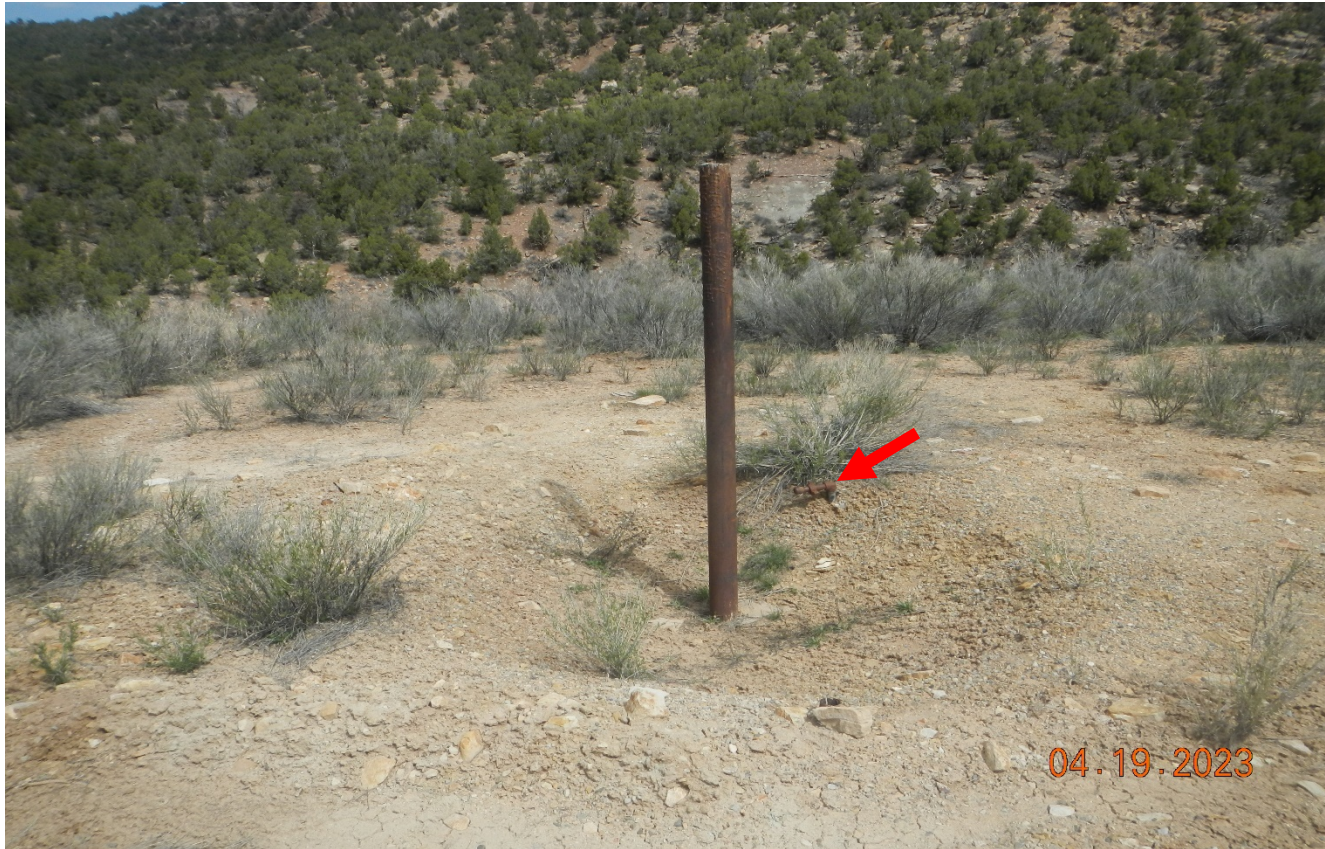
Photo 12. There is an above ground PA marker at the location. There is a small 2" pipe shown at red arrow.