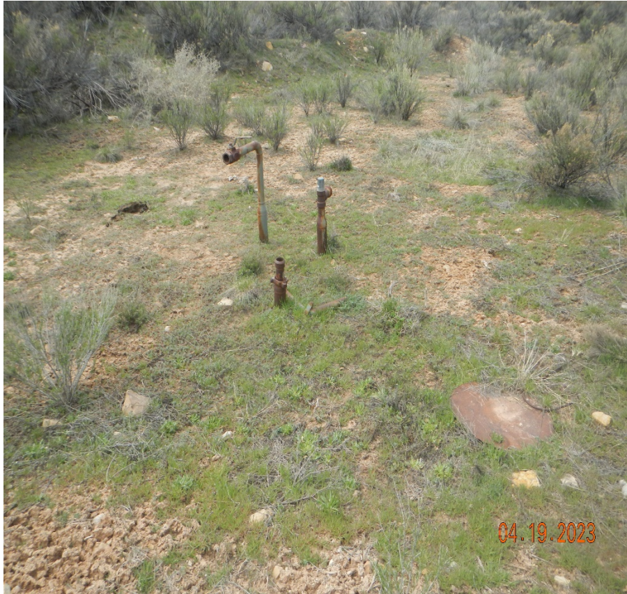
Photo 14. View of 3 pipe risers and 12' plate.