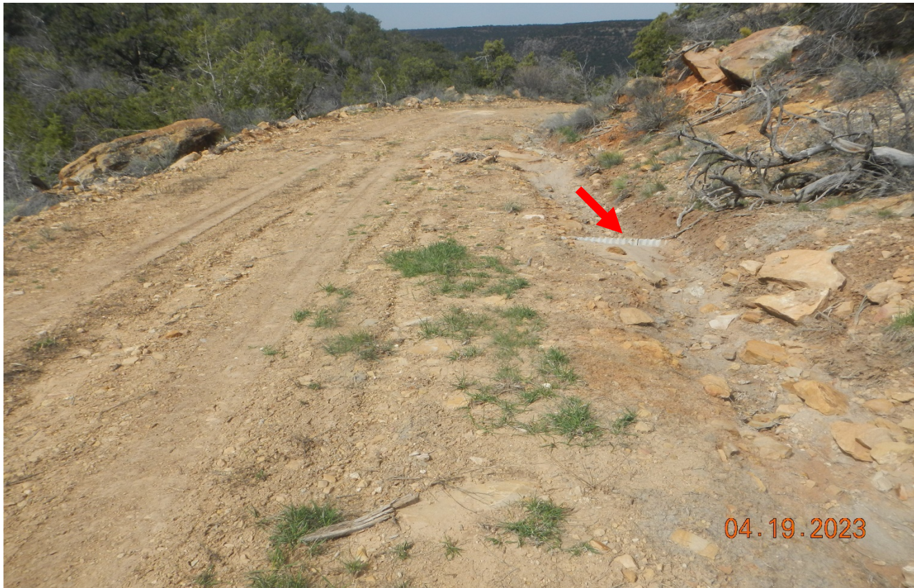
Photo 2. Facing west along the access road. There are culverts along the road that are filled in with sediment. Red arrow shows culvert filled in with sediment.