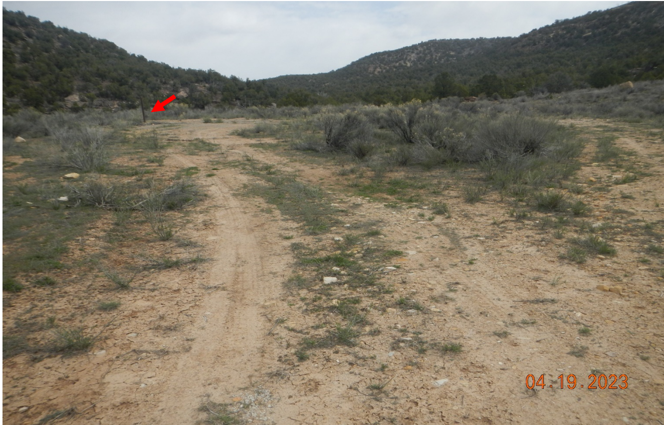
Photo 7. Facing northeast toward the wellsite. PA marker is shown at red arrow. The location has not been recontoured and reclaimed.