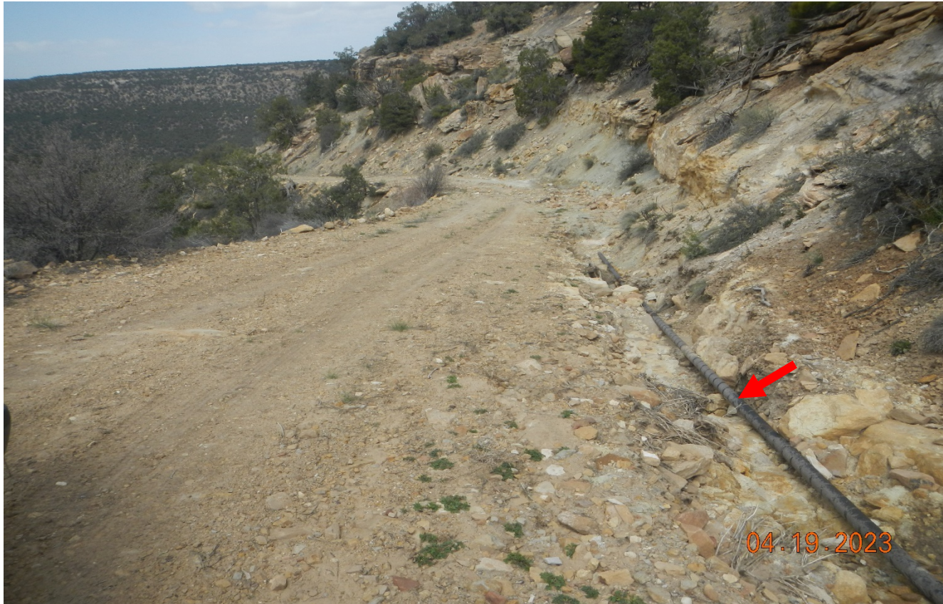
Photo 4. Further west down the road there is exposed flowline shown at red arrow from erosion cutting a deep channel into the road side.