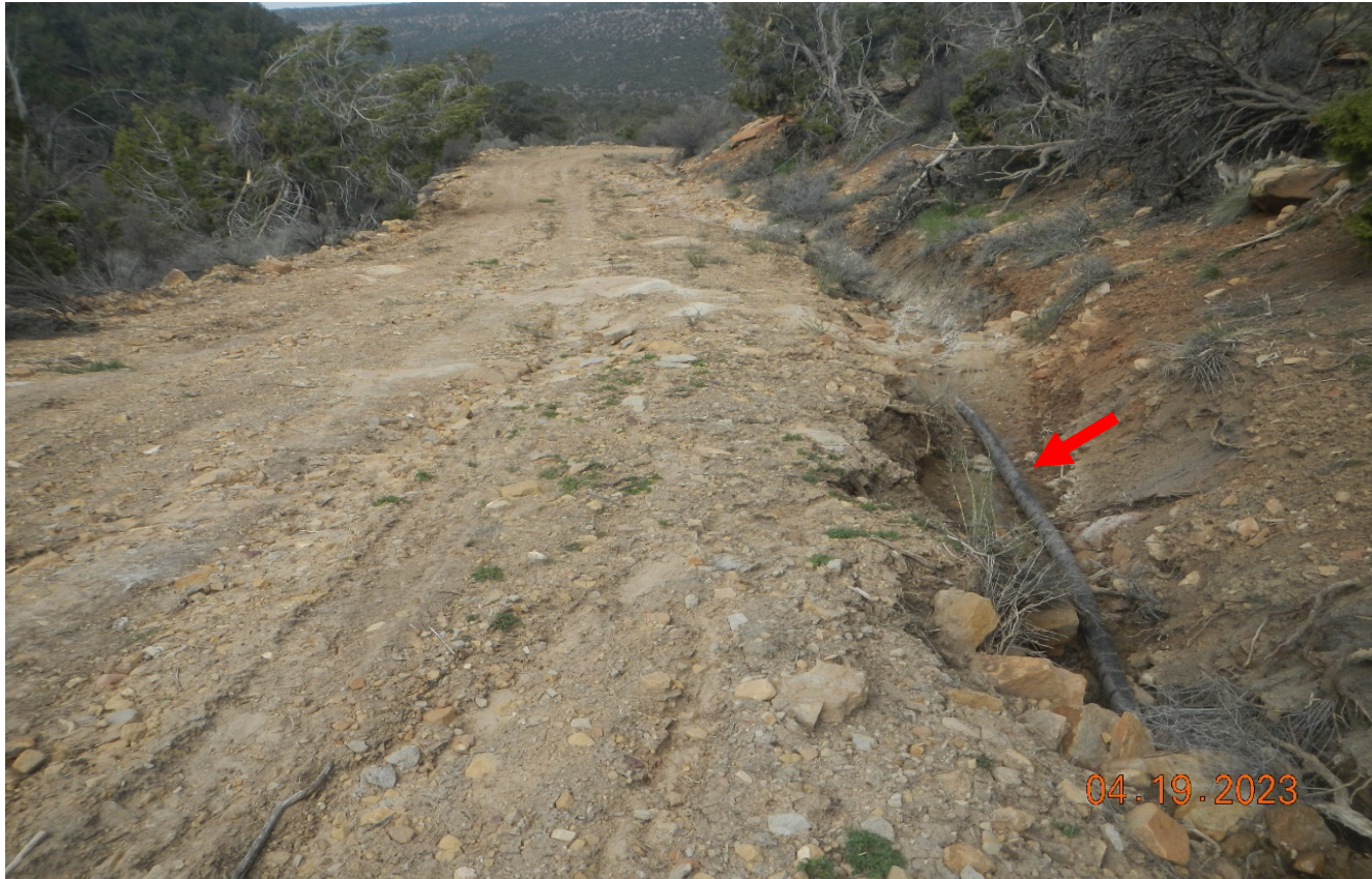
Photo 3. Further west down the road there is exposed flowline shown at red arrow from erosion cutting a deep channel into the road side.