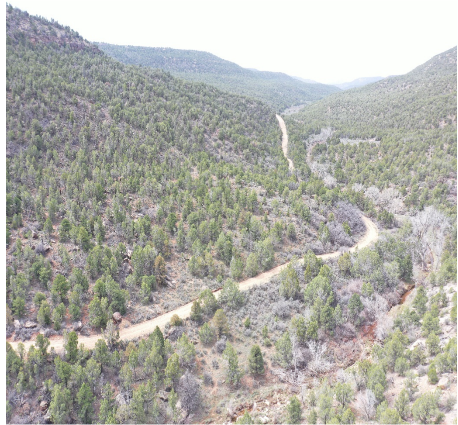
Photo 9. Drone aerial photo facing southwest showing the access road which leads and ends at the wellsite.