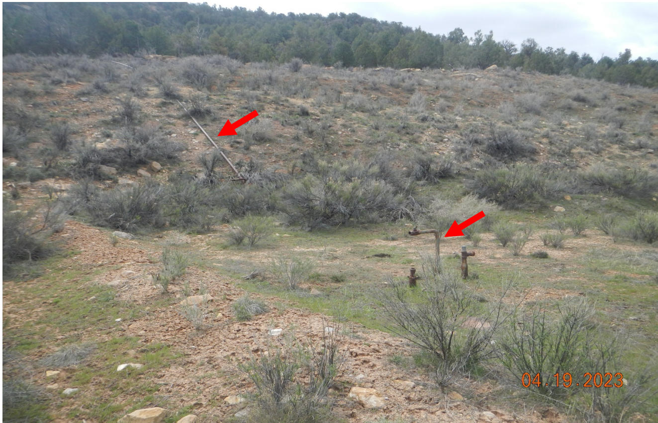
Photo 13. Facing toward the southeast cut slope. There is a bermed area where tanks were location and pipe risers flowline still remain.