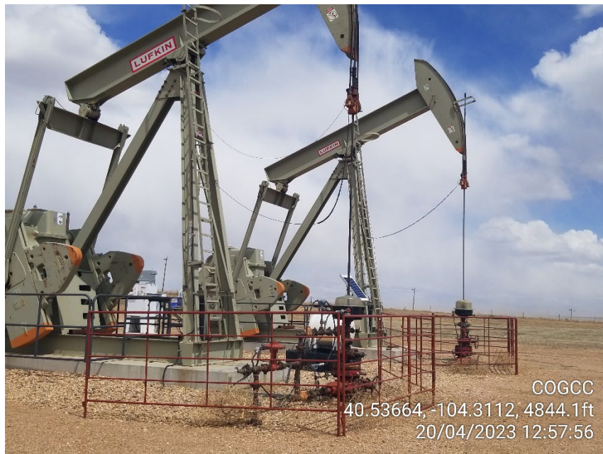
Photo 7 – Pumping Unit