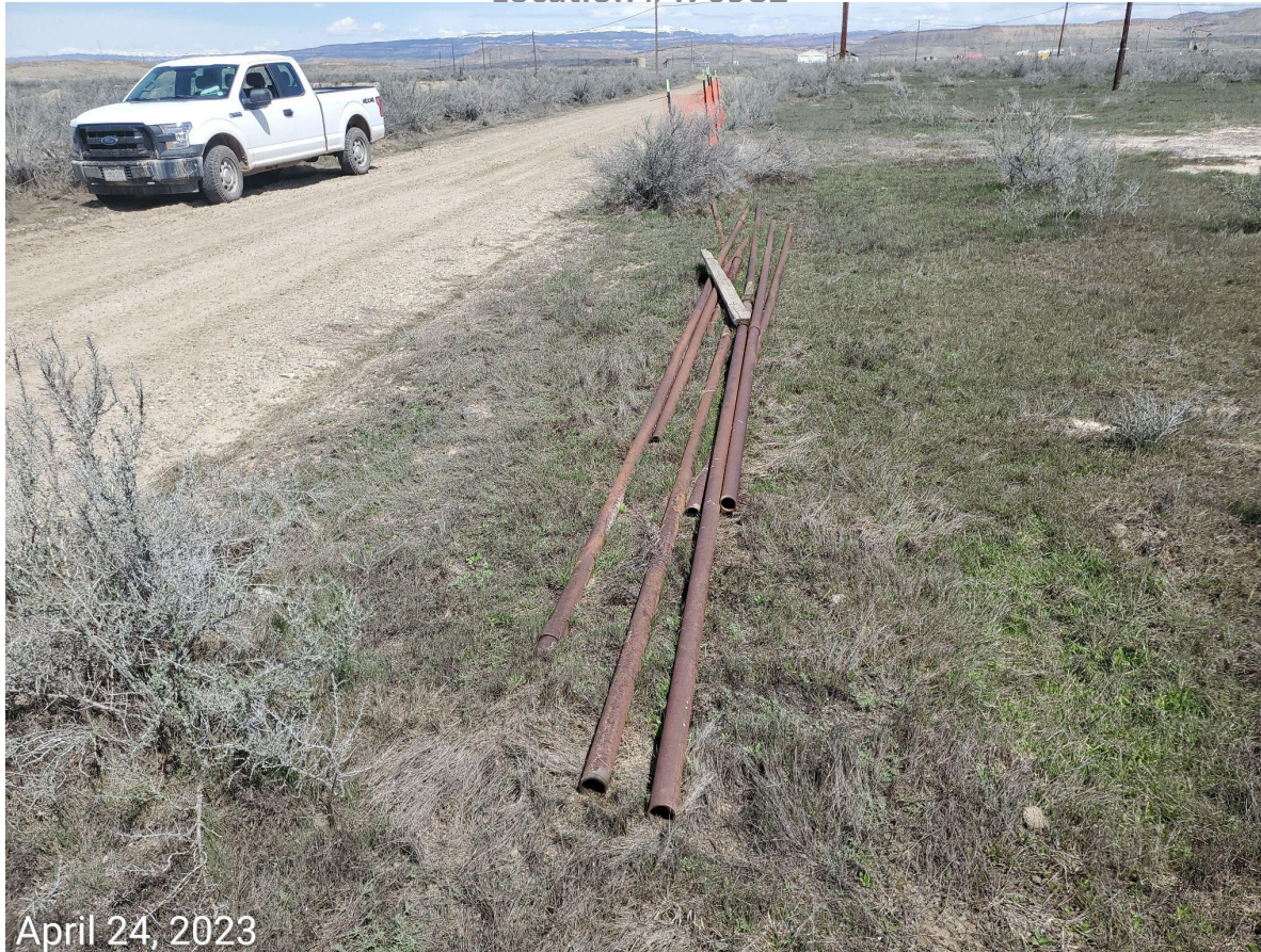
Photo 5: Photo shows unused pipe equipment stored next to Location entrance.