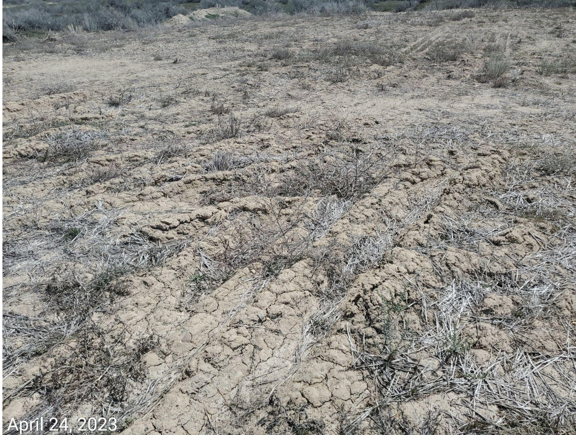
Photo 3: Photo shows areas where desirable plant germination does not appear to be occurring.