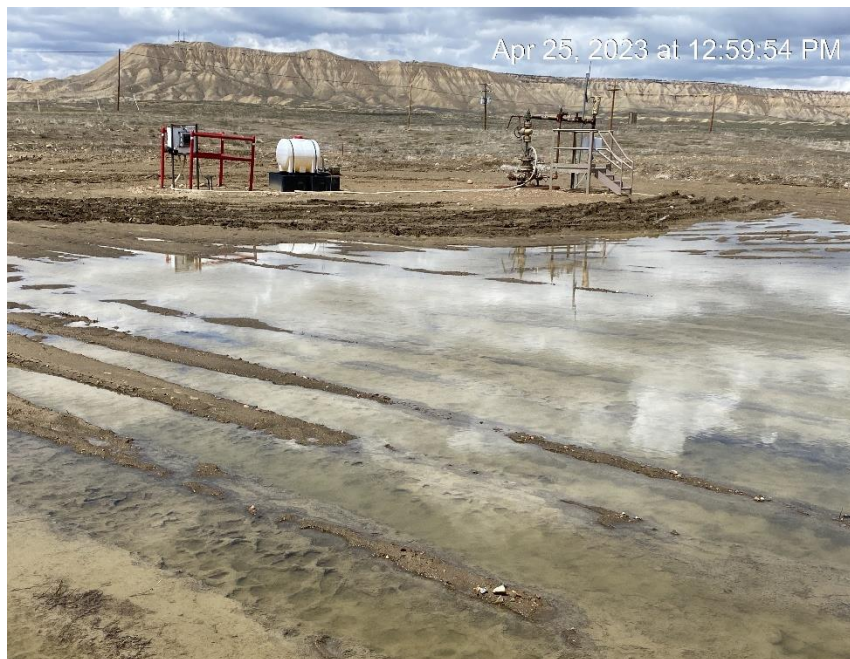
Southeast corner of location