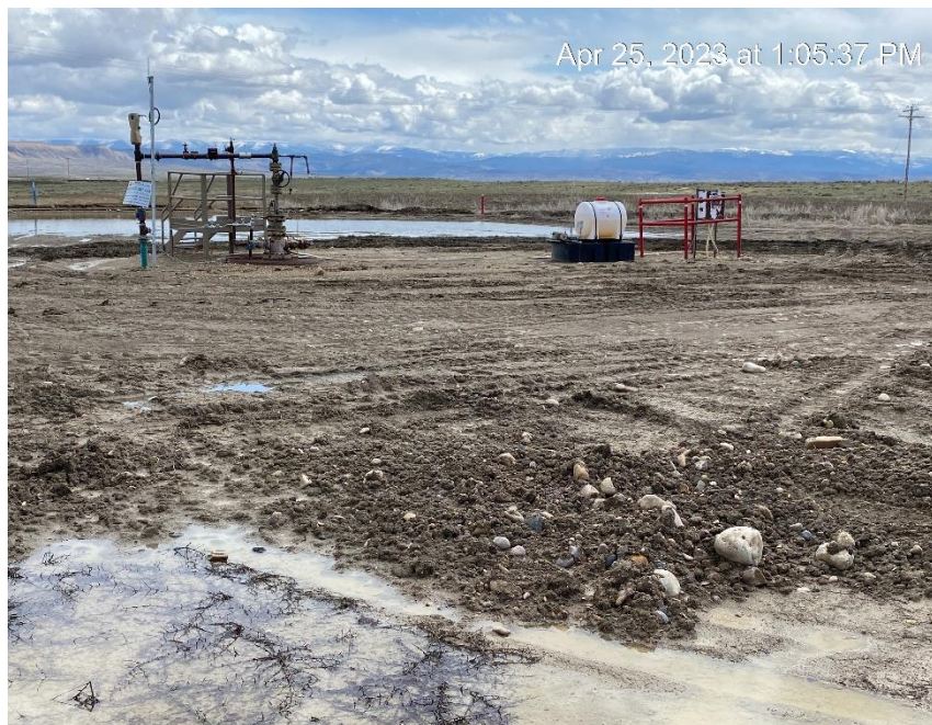
Northwest corner of location