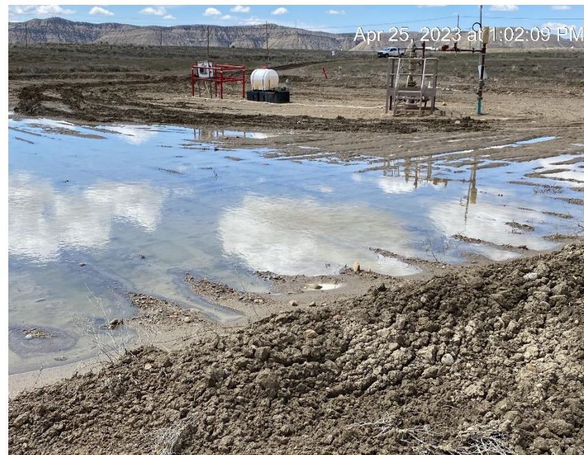
Northeast corner of location