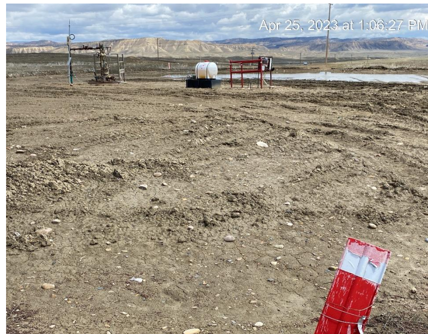
Southwest corner of location