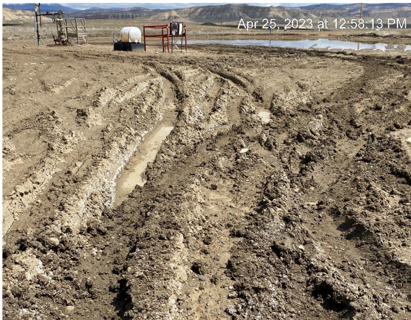
Entrance to location