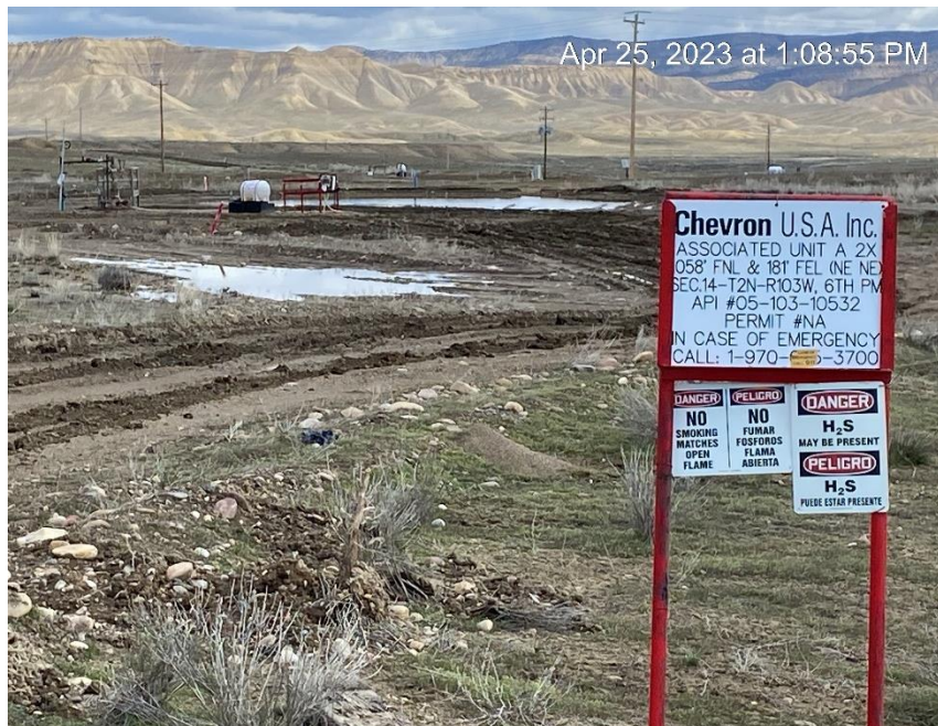
Access and location from lease road