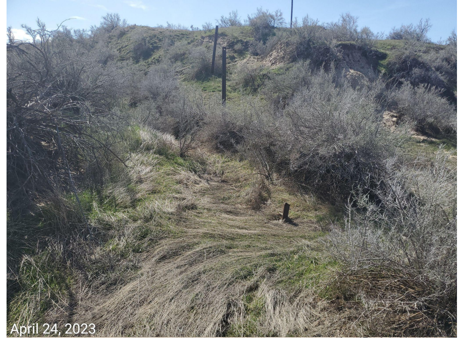
Photo 4: Photos examples showing various trash debris and pipe equipment observed along access road, and Location.