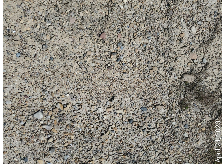
Photo 1: Photos taken from the northern access road. Photo shows Final Reclamation activities, including but not limited to, removal of road base/gravel, compaction alleviation, recontouring/regrading and reclamation has not been completed.