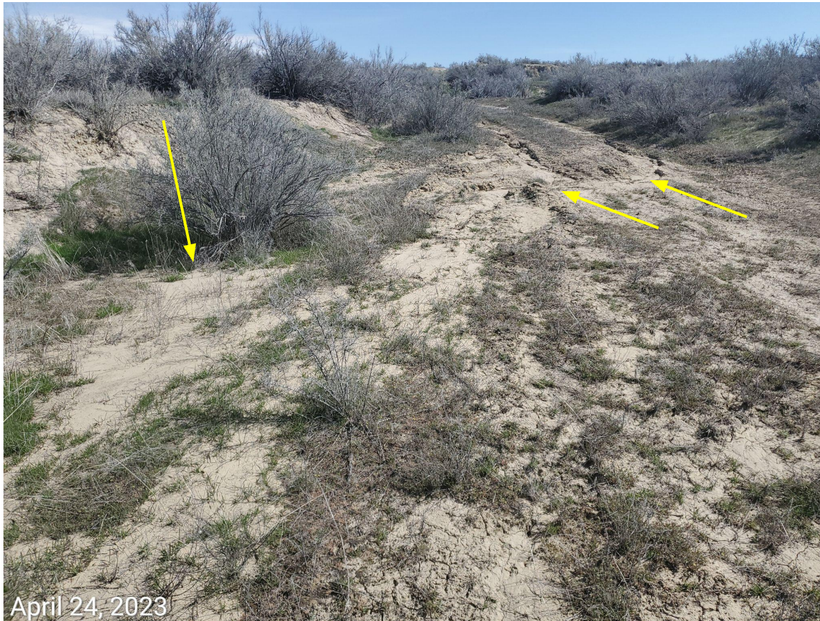
Photo 7: Photo shows area where the northern access road meets the Location. Photo shows sediment deposition due to erosion degradation and runoff from the access road.