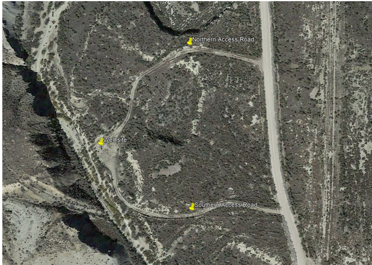
Photo 11: Google earth aerial imagery and overview of the Location and access road(s).