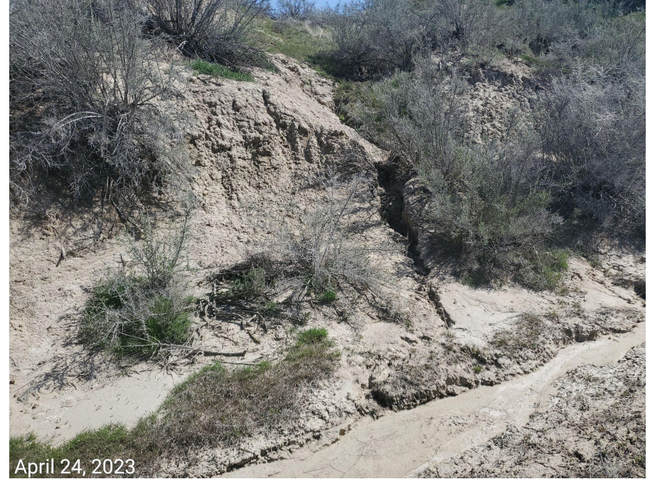
Photo 8: Photos taken from the southern access road. Photo shows stormwater and erosion control BMPs remain missing or insufficient on the Location and access road. Erosion degradation has persisted. Photos also show Final Reclamation activities, including but not limited to, removal of road base/gravel, compaction alleviation, recontouring/regrading and reclamation has not been completed.