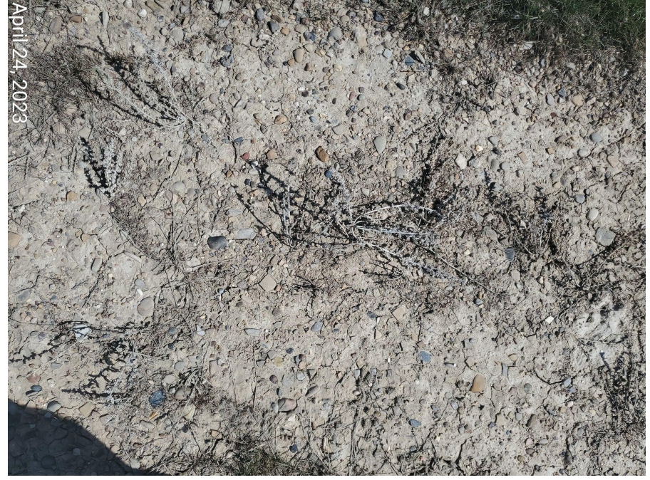
Photo 2: Undesirable Plant Species (Halogeton) from the previous growing season observed on Location. Weed management is not occurring; weed germination observed.