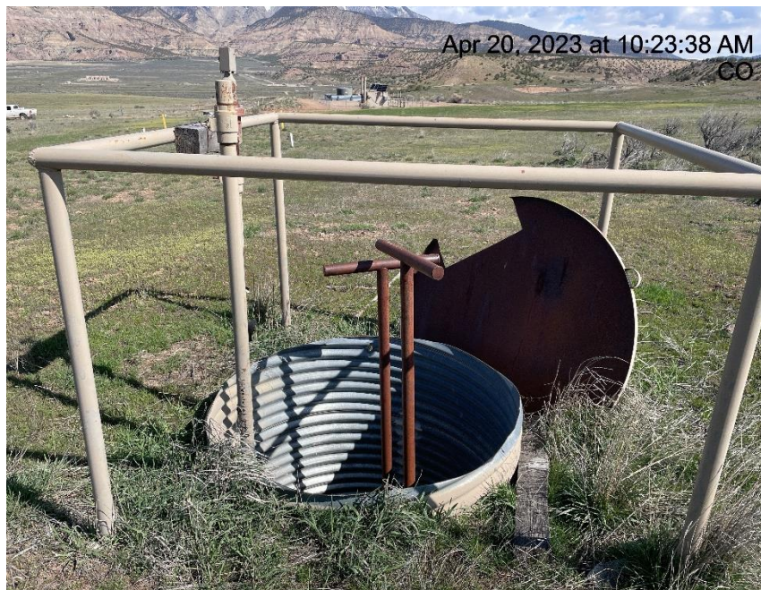
Photo # 5889 Open cellar – Wildlife Hazard (Approximately 50 yards south of location)