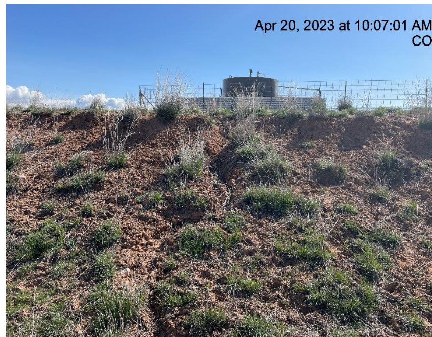
Photo # 5862 Erosion & transport of sediment off location (West side of pad on slope near production tank)