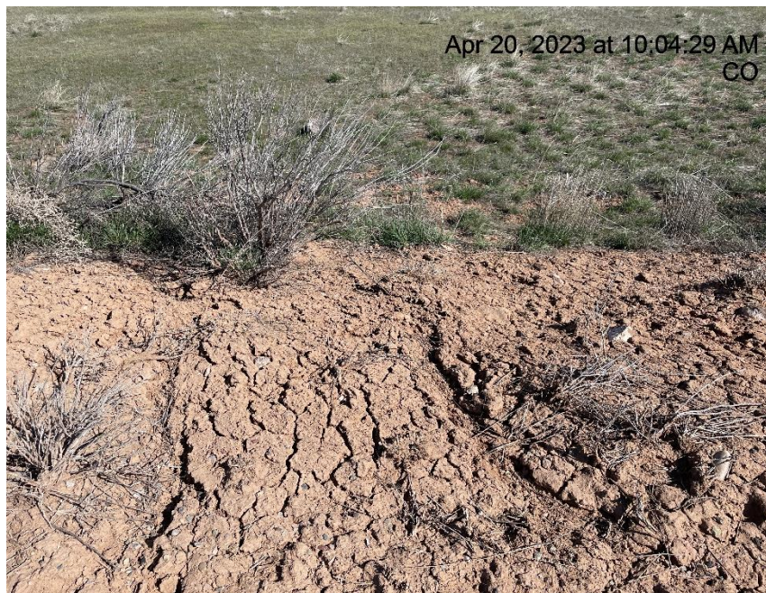
Photo # 5854 Erosion & transport of sediment off location (North side of pad on slope near production tank)