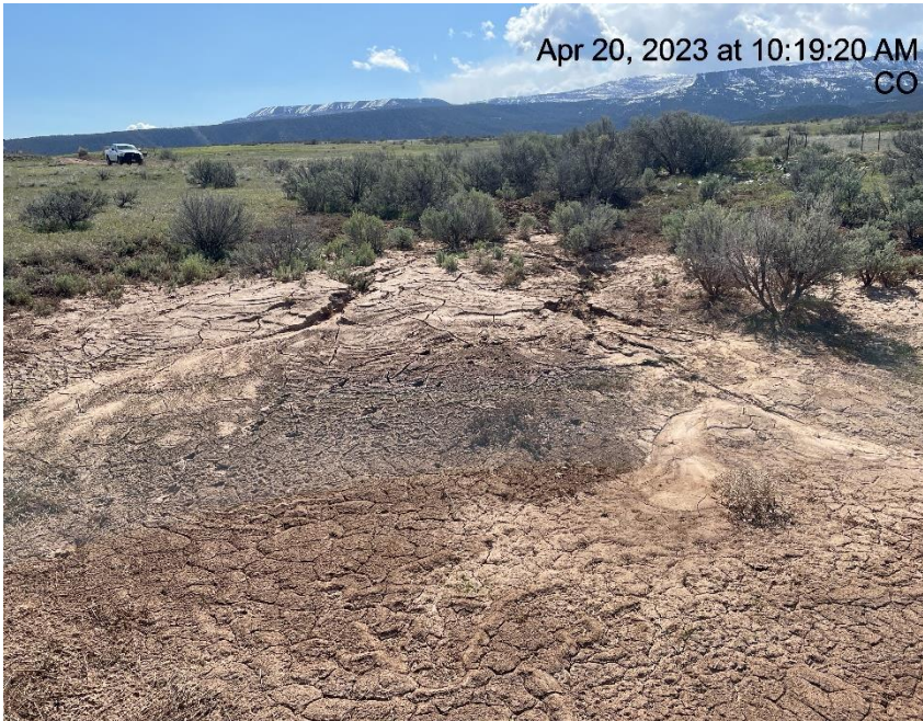
Photo # 5884 BMP's need maintenance (North side of spur road near culvert & rip rap run approximately 10-20 yards down spur road)