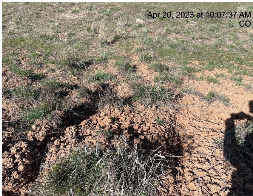
Photo # 5864 Erosion & transport of sediment off location (West side of pad on slope near production tank)