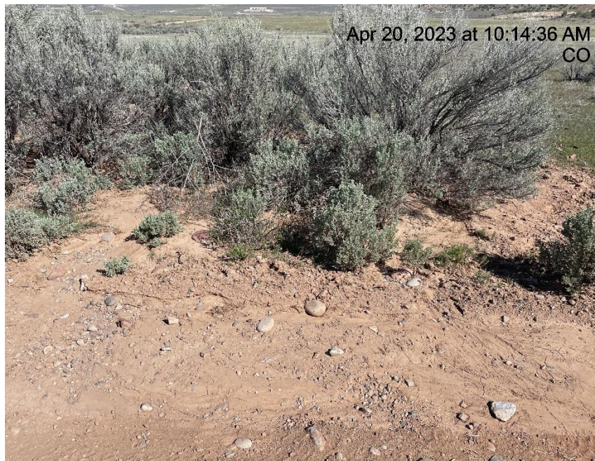
Photo # 5878 Erosion/transport of sediment down spur road & transport of sediment off of spur road into a vegetated area/insufficient BMP's