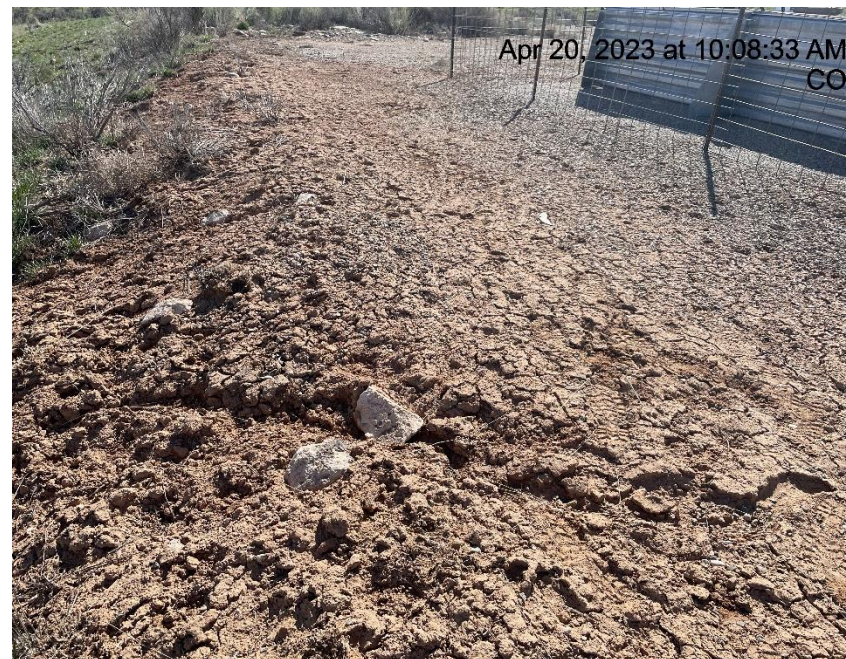
Photo # 5865 Erosion & transport of sediment (North side of pad on slope near production tank)