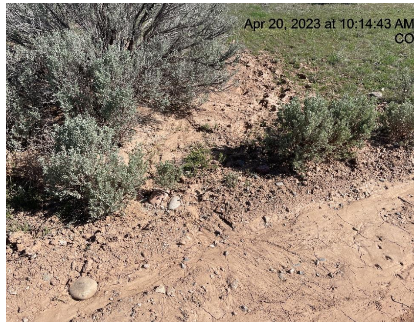
Photo # 5879 Erosion/transport of sediment down spur road & transport of sediment off of spur road into a vegetated area/insufficient BMP's