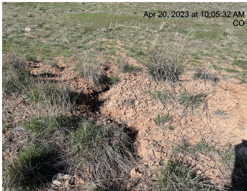
Photo # 5857 Erosion & transport of sediment off location (West side of pad on slope near production tank)