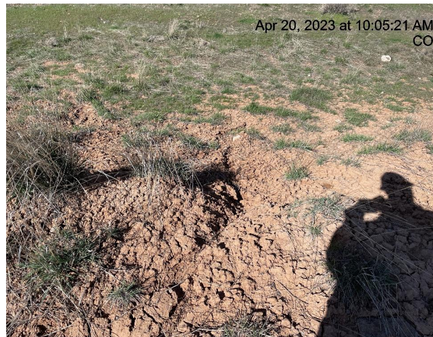
Photo # 5856 Erosion & transport of sediment off location (West side of pad on slope near production tank)