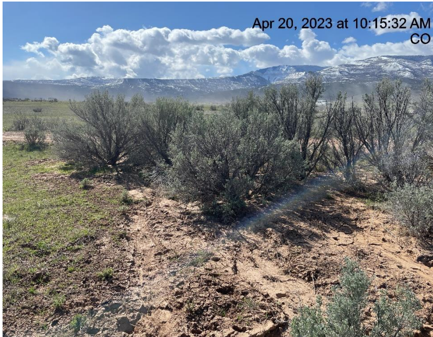
Photo # 5882 Erosion/Transport of sediment off of spur road into a vegetated area/insufficient BMP's