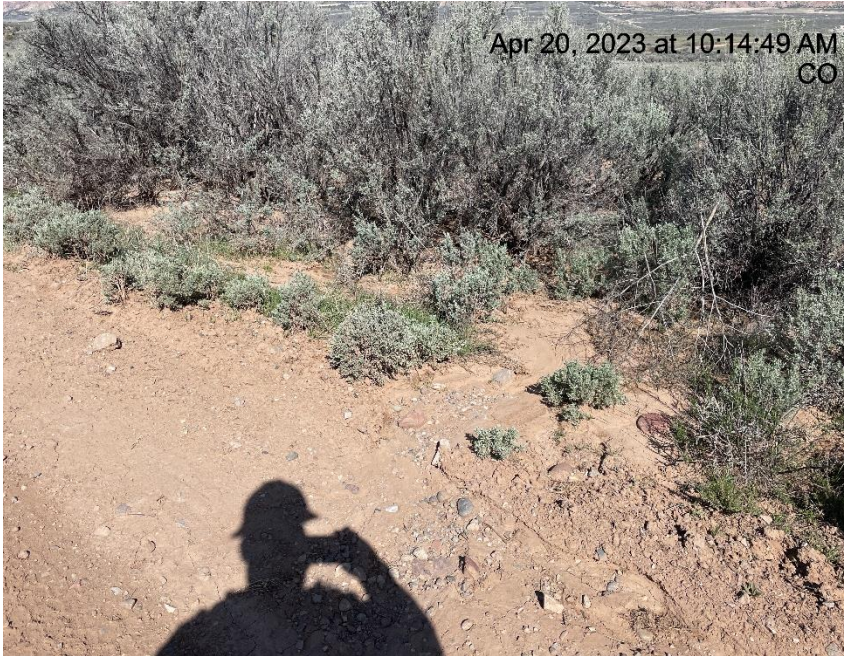
Photo # 5880 Erosion/transport of sediment down spur road & transport of sediment off of spur road into a vegetated area/insufficient BMP's