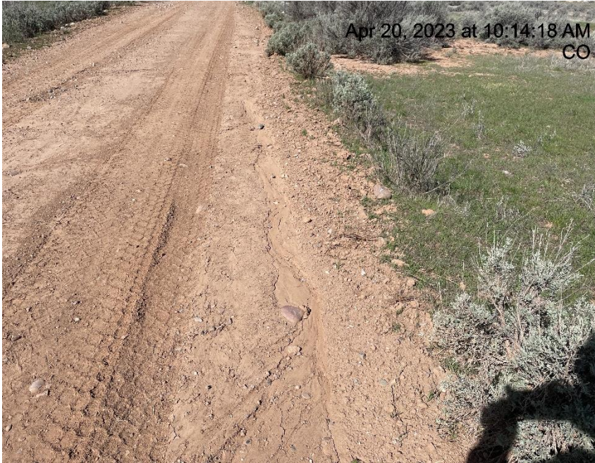
Photo # 5877 Erosion/transport of sediment down spur road & transport of sediment off of spur road into a vegetated area/insufficient BMP's