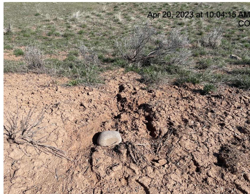
Photo # 5853 Erosion & transport of sediment off location (North side of pad on slope near production tank)