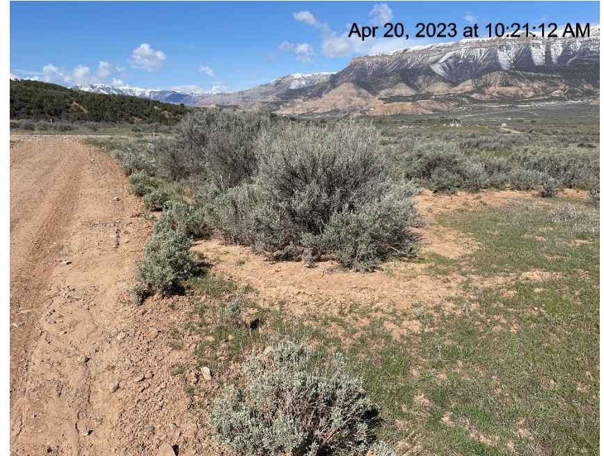
Photo # 5887 Erosion/transport of sediment down spur road & transport of sediment off of spur road & into a vegetated area/insufficient BMP's