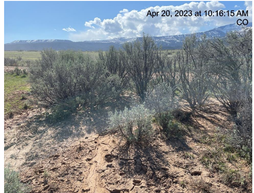
Photo # 5883 Erosion/Transport of sediment off of spur road into a vegetated area/insufficient BMP's