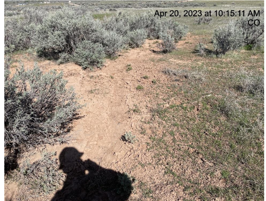
Photo # 5881 Erosion/transport of sediment down spur road & transport of sediment off of spur road into a vegetated area/insufficient BMP's