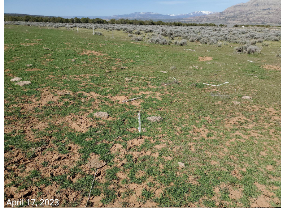
Photo 3: Photos 3-4 example that the perimeter fence has not been maintained in proper functioning condition; debris remains scattered throughout the interim and working pad areas.