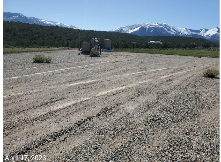
Photo 1: Photo 1-2 taken from the north end of the Location. Photos provide an overview of the Location from east, southeast, southwest to west.