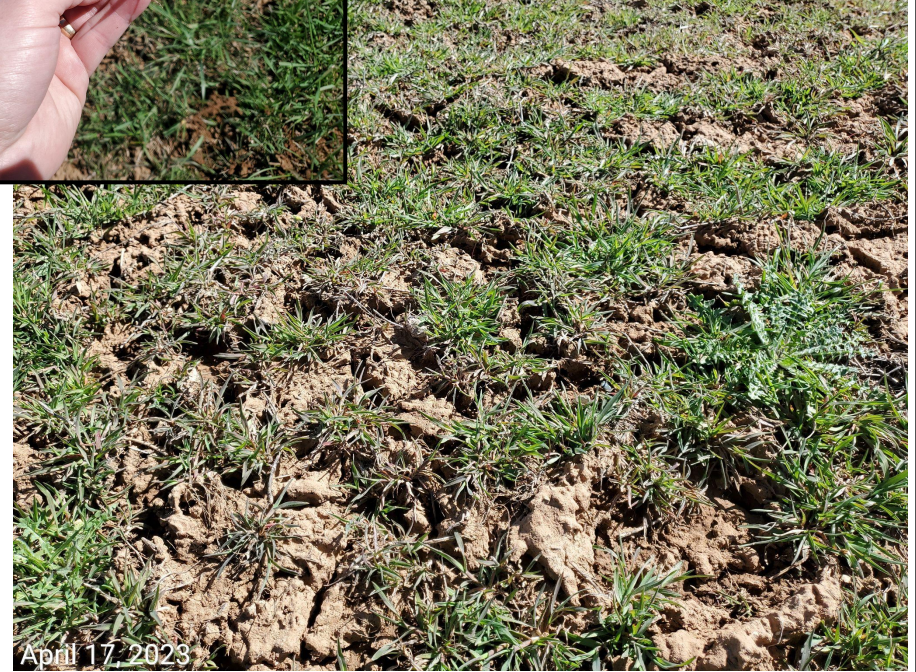
Photo 6: Photo taken from the interim areas of the Location. Reclamation Specialist was unable to observe evidence that additional reclamation work has been performed. Vegetation observed is predominantly an annual grass monoculture.