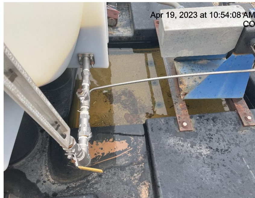
Photo # 5729 Chemical containment full/Failure to maintain chemical BMP