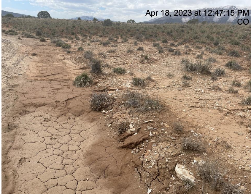
Photo # 5630 Rill erosion & transport of sediment onto location (north side of pad)