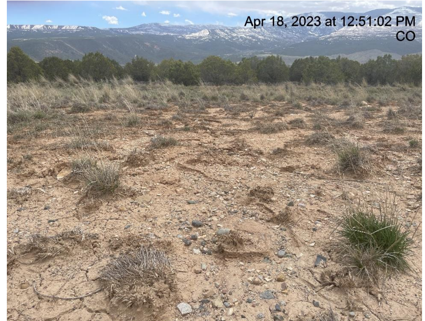
Photo # 5635 Rill erosion on the edge of the pad going into the interim area (south side of pad)