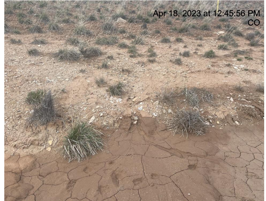
Photo # 5623 Rill erosion & transport of sediment onto location (north side of pad)