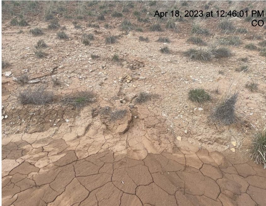
Photo # 5624 Rill erosion & transport of sediment onto location (north side of pad)