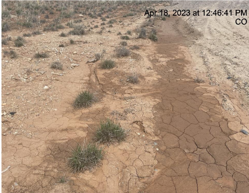
Photo # 5627 Rill erosion & transport of sediment onto location (north side of pad)