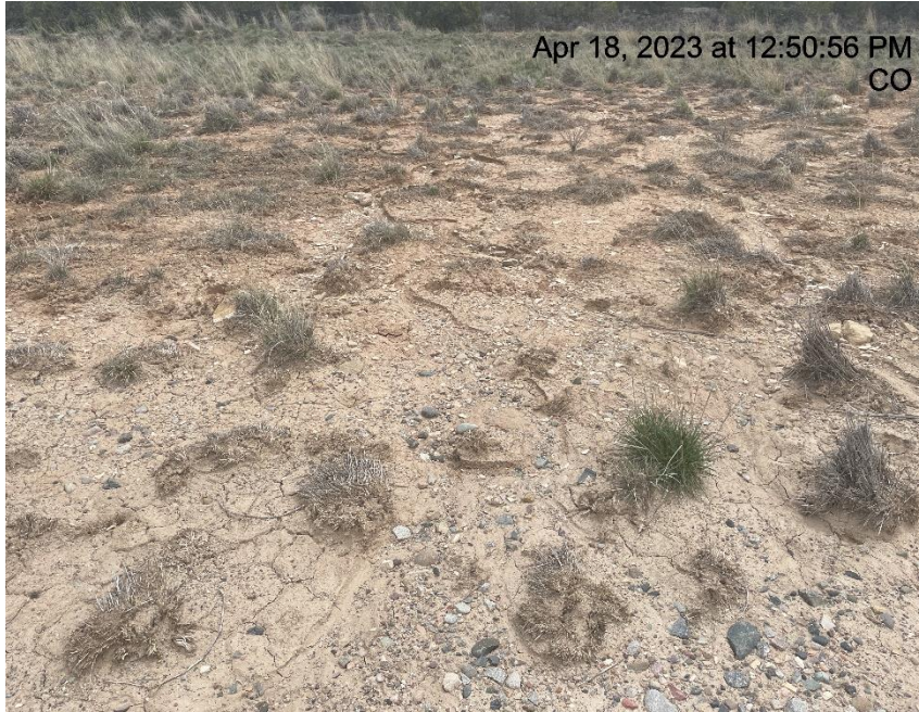
Photo # 5634 Rill erosion on the edge of the pad going into the interim area (south side of pad)