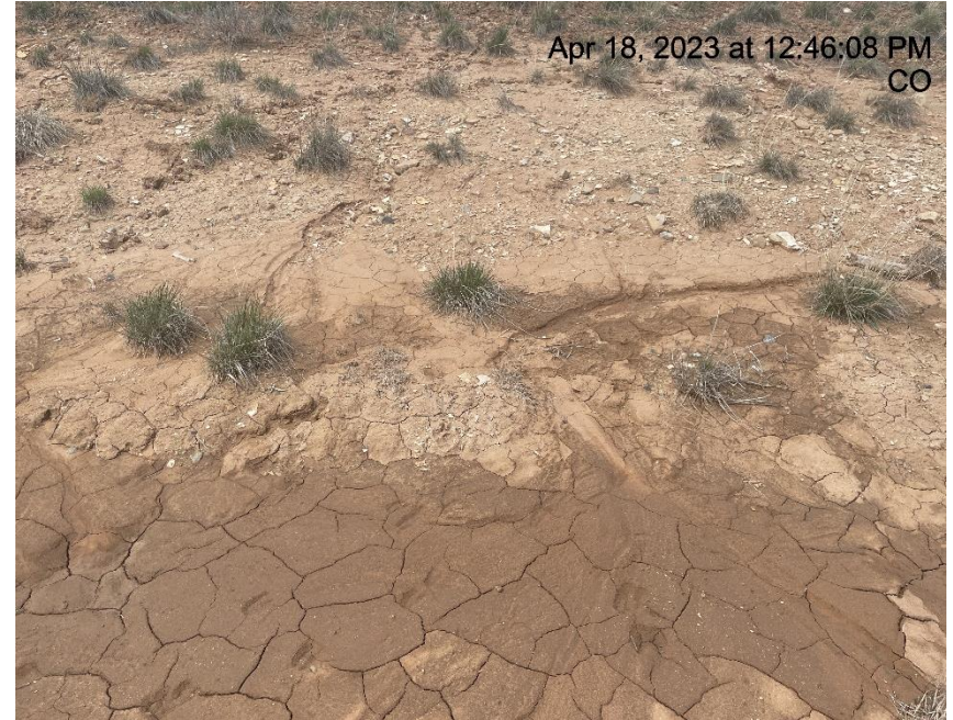
Photo # 5625 Rill erosion & transport of sediment onto location (north side of pad)