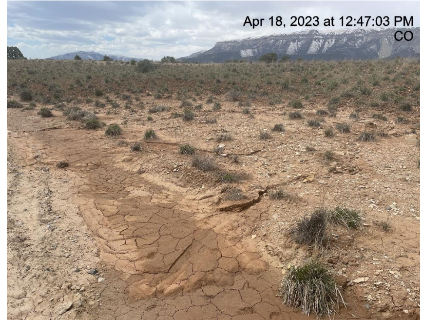
Photo # 5629 Rill erosion & transport of sediment onto location (north side of pad)