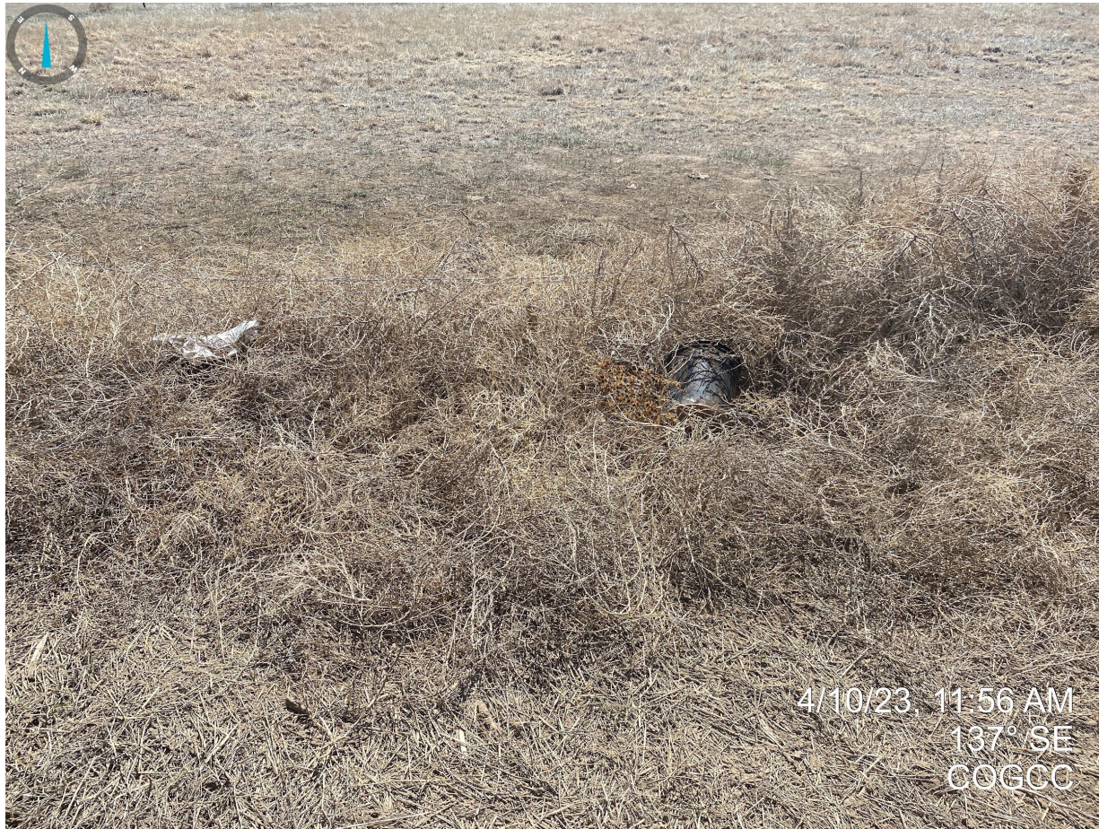
Photo 19. Trash and debris observed throughout the location. The operator shall self inspect the entire location to ensure it is kept free from all trash and debris, at all times.