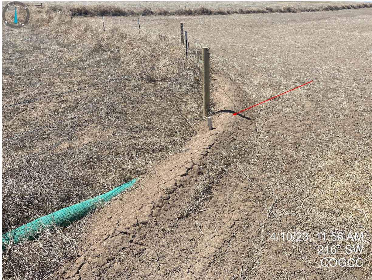
Photo 12. Taken from the southeastern corner of the location. See comments in Photo 9.