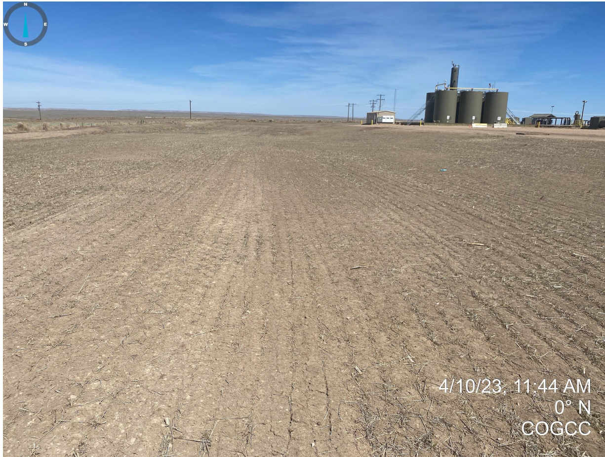
Photo 1. Facing north from the western portion of the location. It appears the operator has performed interim reclamation activities with the evidence of drill rows and mulch, and germination present at the time of this inspection. Staff will conduct a follow-up inspection at a future date to verify vegetation establishment in accordance with Rule 1003.