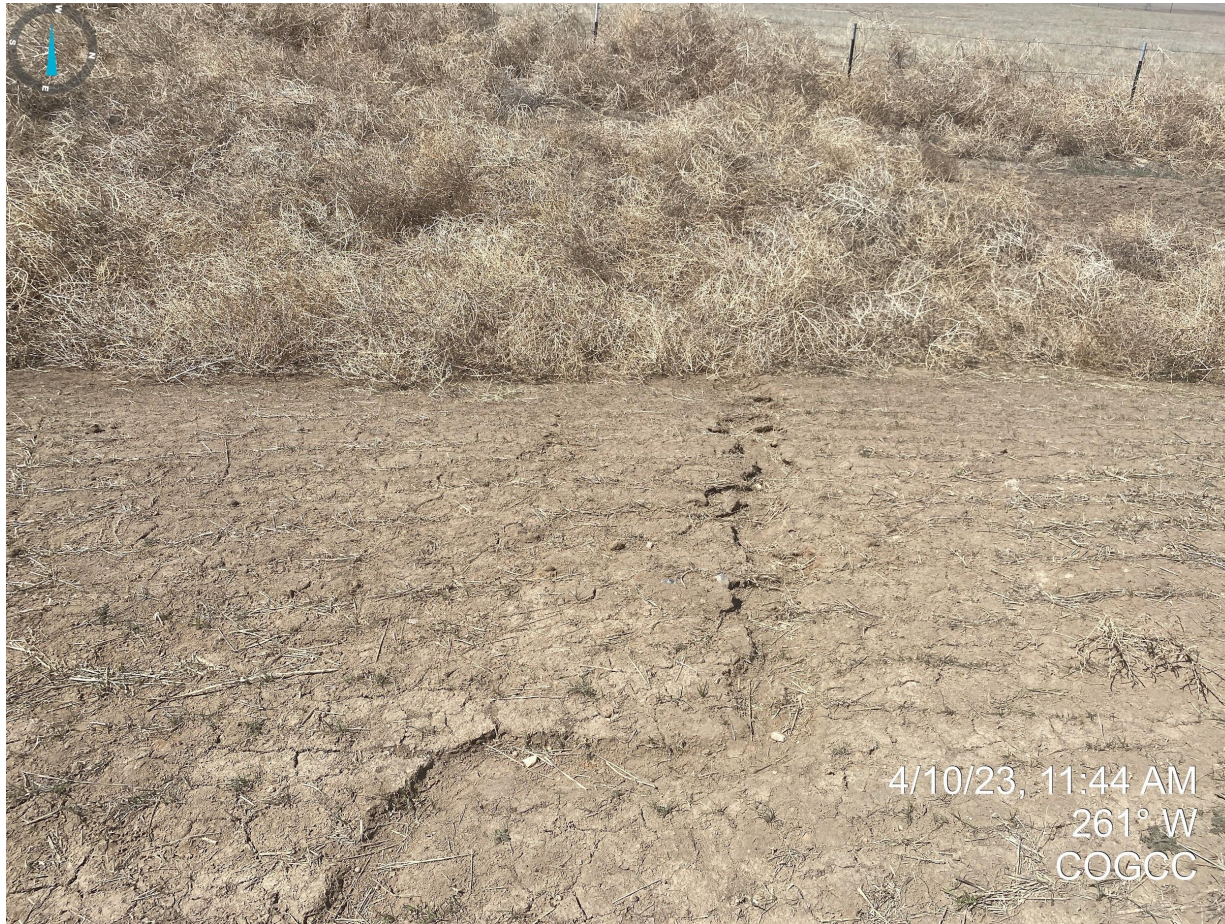
Photo 6. Close up photo taken near the location's entrance, illustrating evidence of rill erosion. While germination was detected in the interim areas, additional soil stabilization techniques will need to be implemented prevent further site degradation and erosion from occurring.