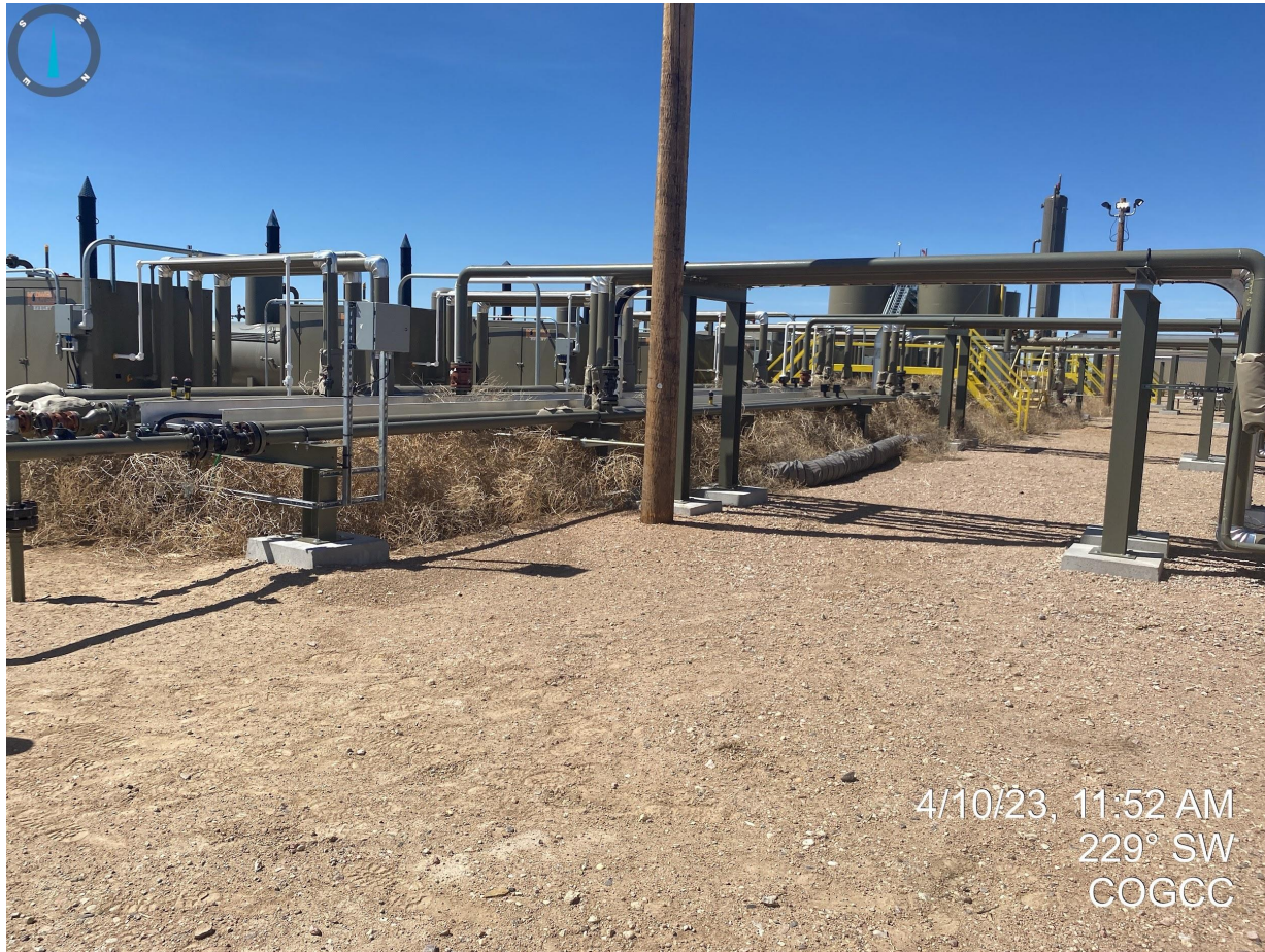
Photo 15. Tumbleweed accumulations observed in and around equipment will need to be removed as it presents a fire hazard.