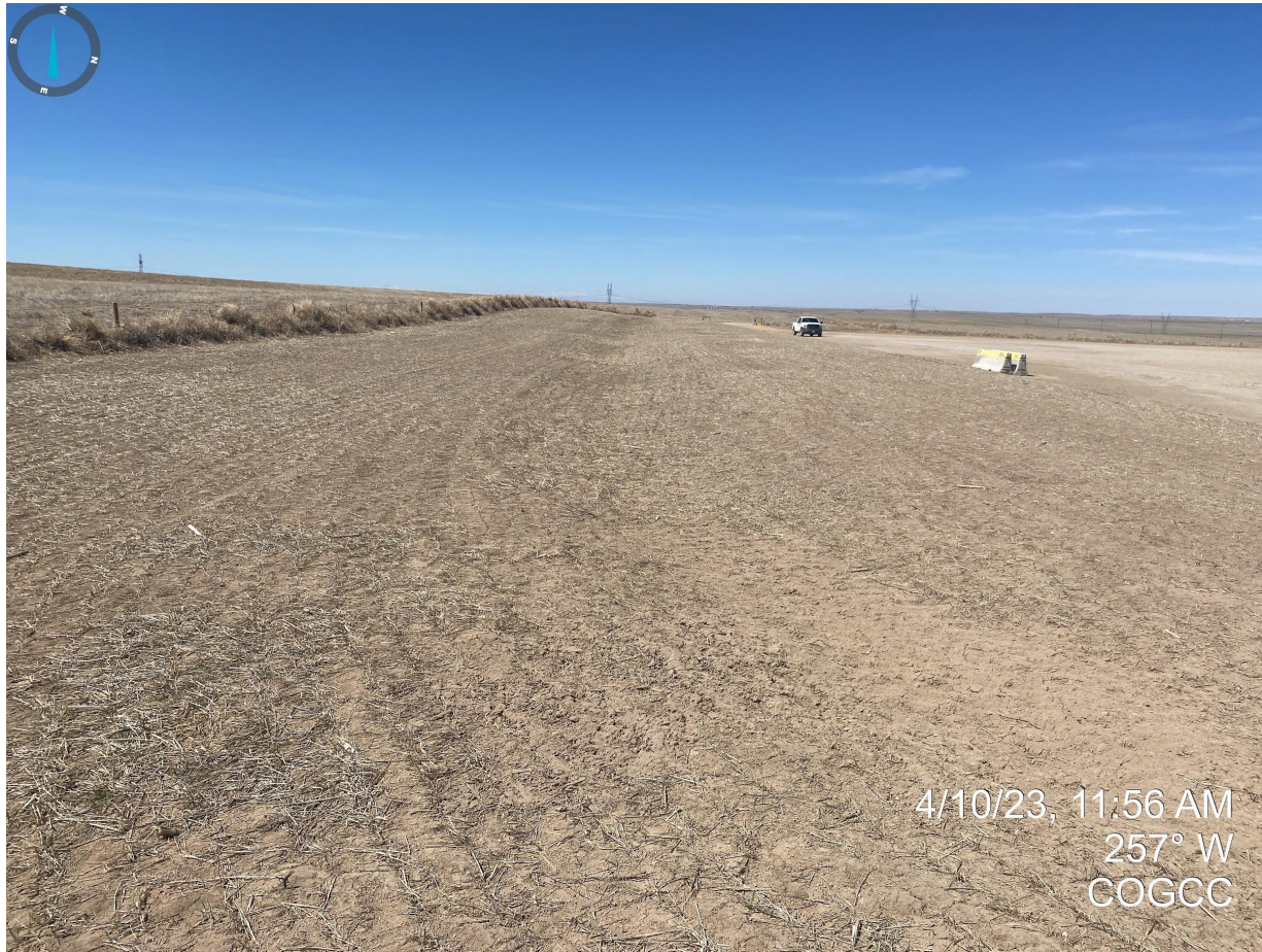
Photo 5. Facing west from the southern portion of the location. See comments in Photo 1.