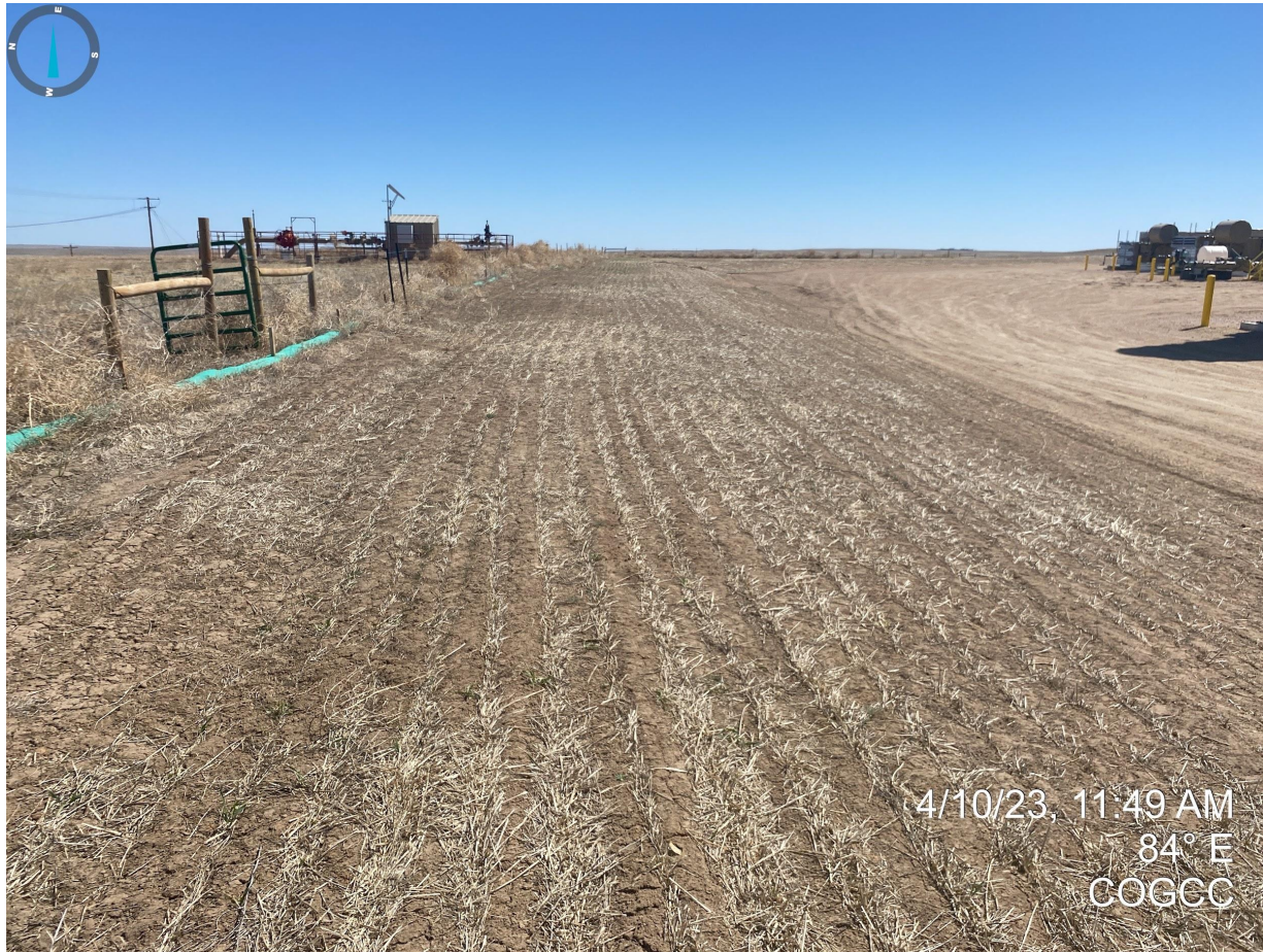
Photo 3. Facing east from the northern portion of the location; see comments in Photo 1.