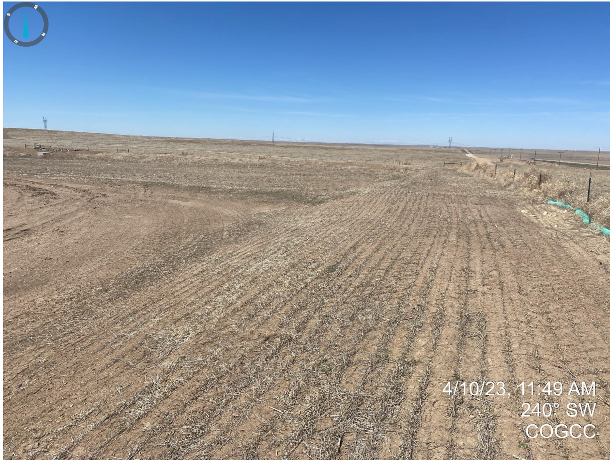
Photo 2. Facing southwest from the northern portion of the location. See comments in Photo 1.