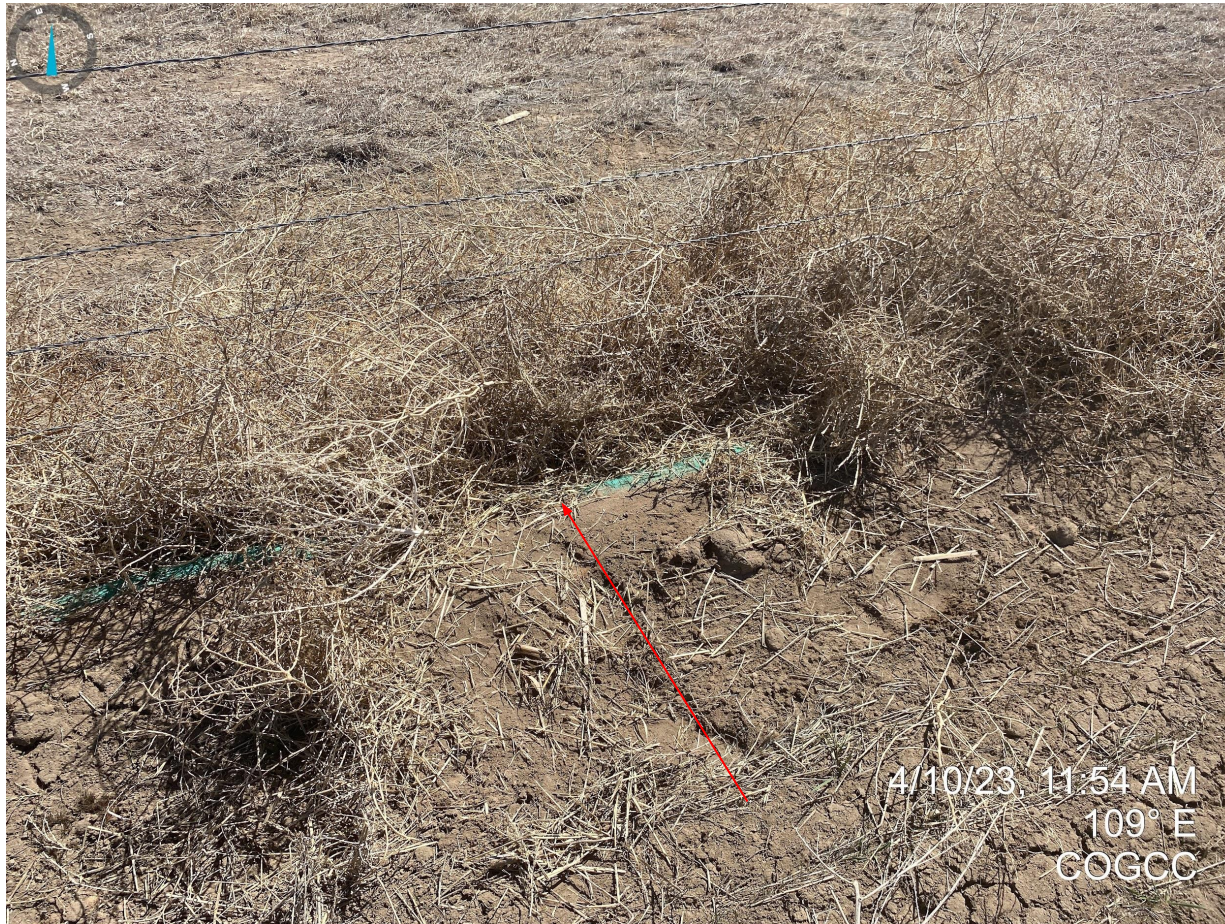
Photo 10. Taken from the eastern side of the location. See comments in Photo 9.