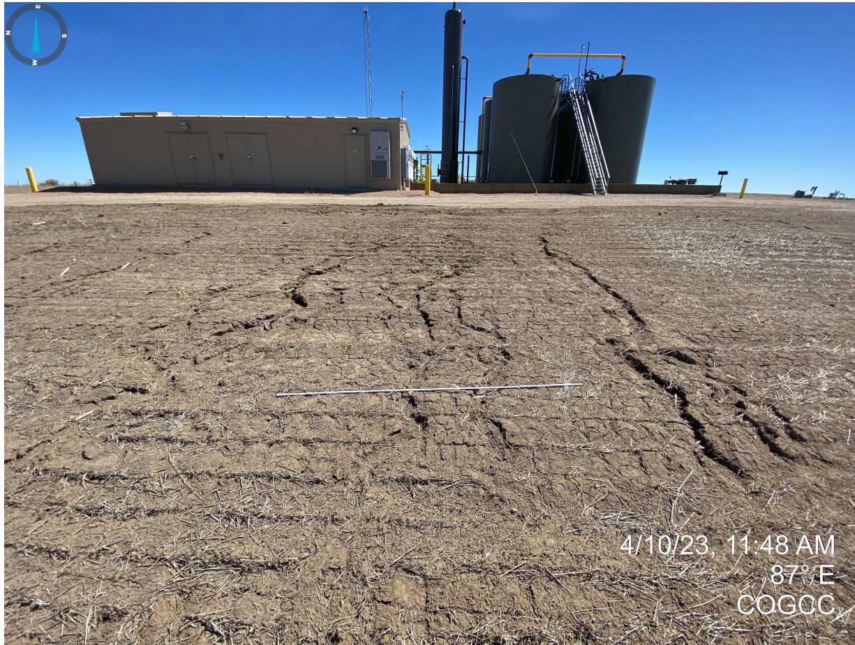
Photo 7. Facing east from the western portion of the location. See comments in Photo 6.