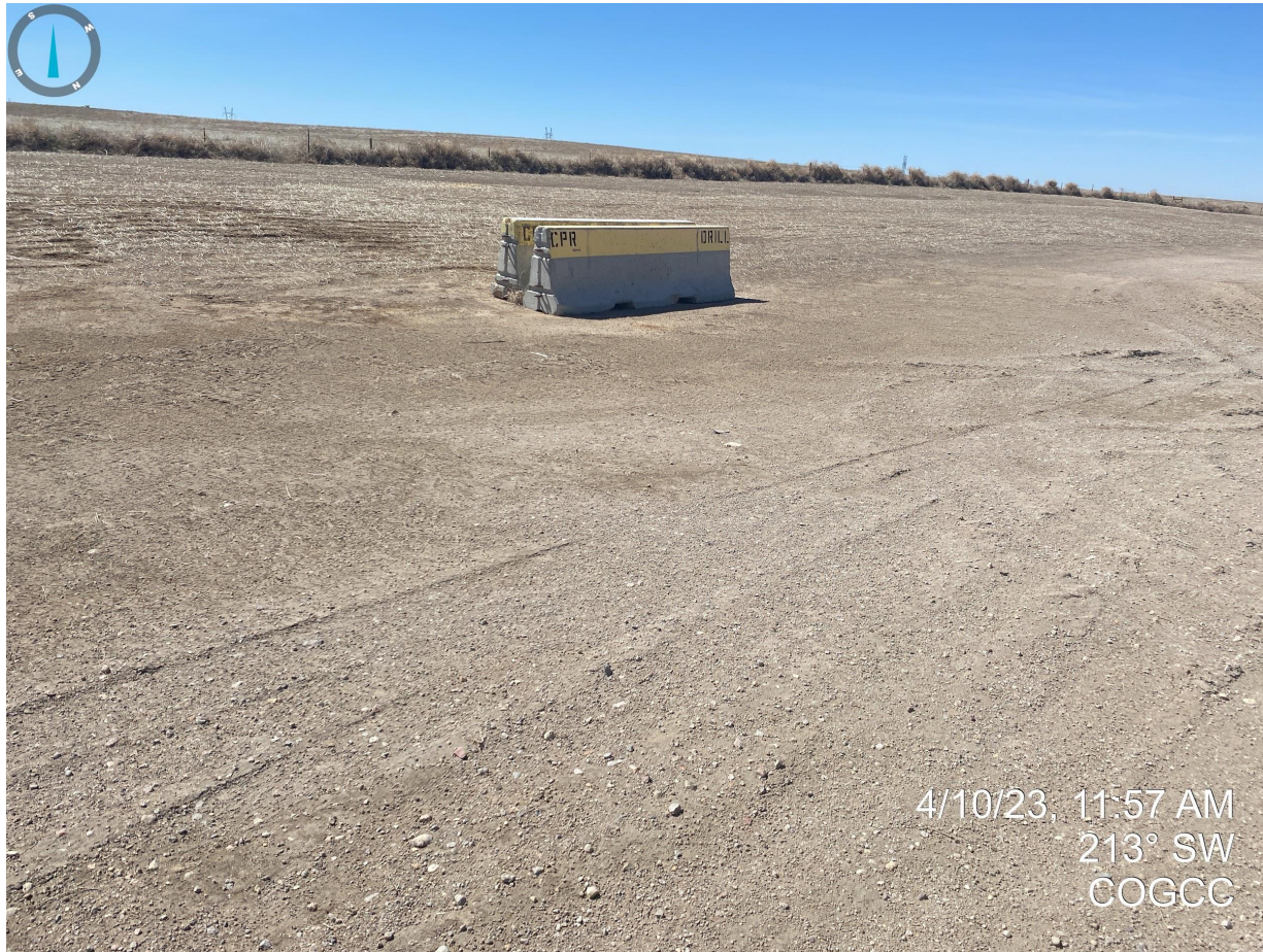
Photo 14. Jersey barriers observed on the southern edge of production area; see comments in Photo 13.