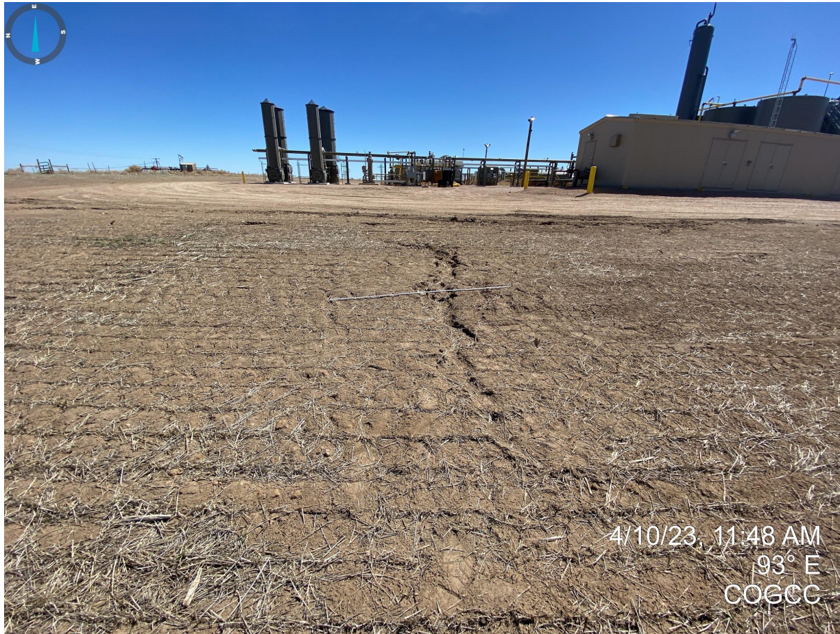
Photo 8. Facing east from the northwestern portion of the location. See comments in Photo 6.