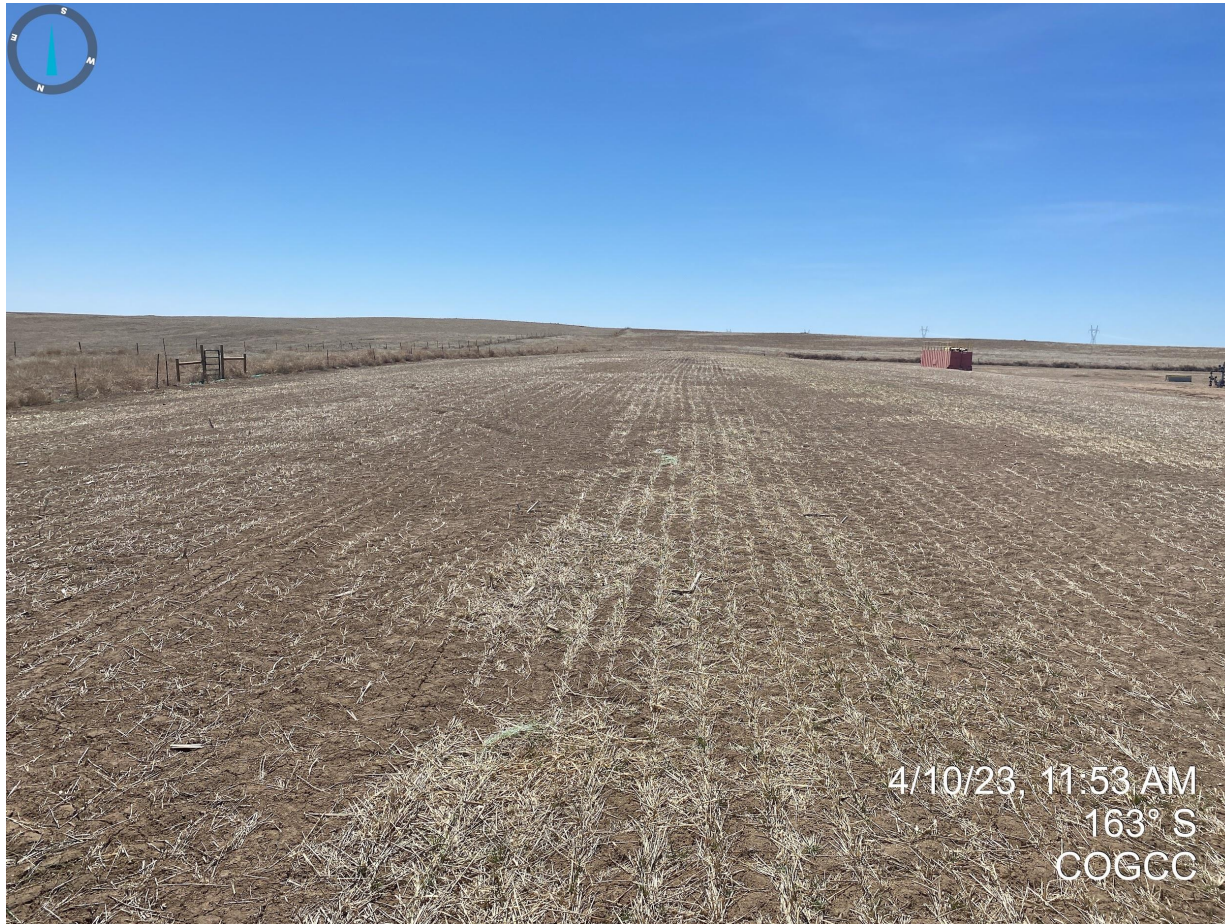
Photo 4. Facing south from the eastern portion of the location. See comments in Photo 1.