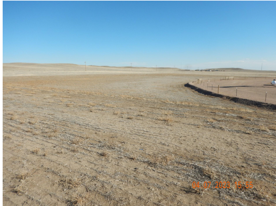
Photo 4. Photo taken from the northern interim reclamation area, facing Southeast. There did not appear to be any establishment of Cereal rye along the northern perimeter.