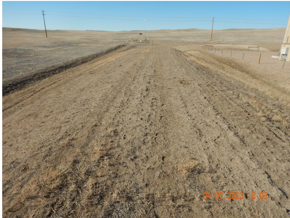
Photo 5. Photo taken from the western topsoil stockpile, facing North. Photo illustrates the lack of stabilization and prevention of weed establishment. See comments under Photo 1.