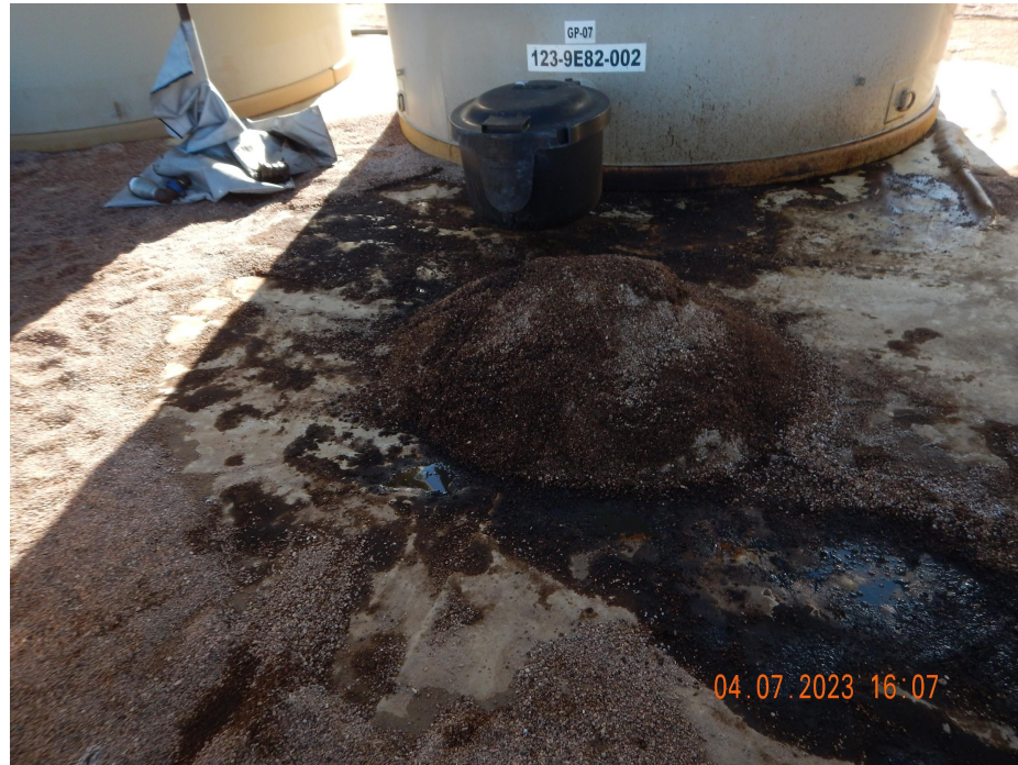
Photo 6. Photo taken from within the secondary containment of oily waste that needs to be removed and properly disposed of.