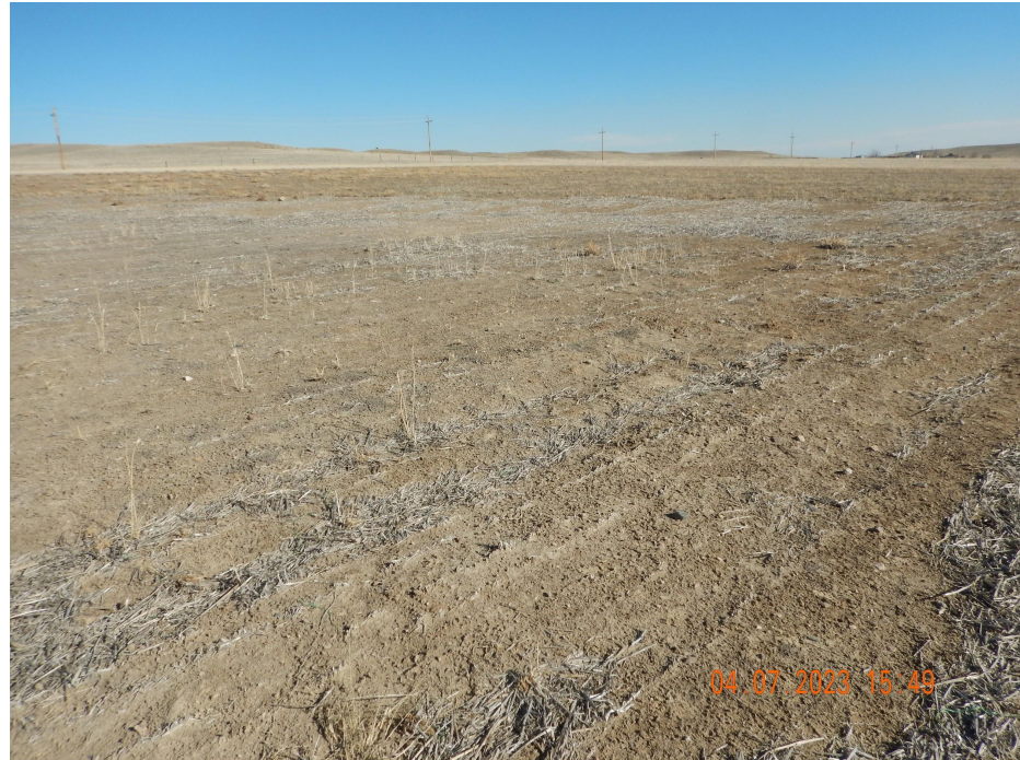
Photo 2. Photo taken from the central interim reclamation area, facing Southeast. See comments under Photo 1.