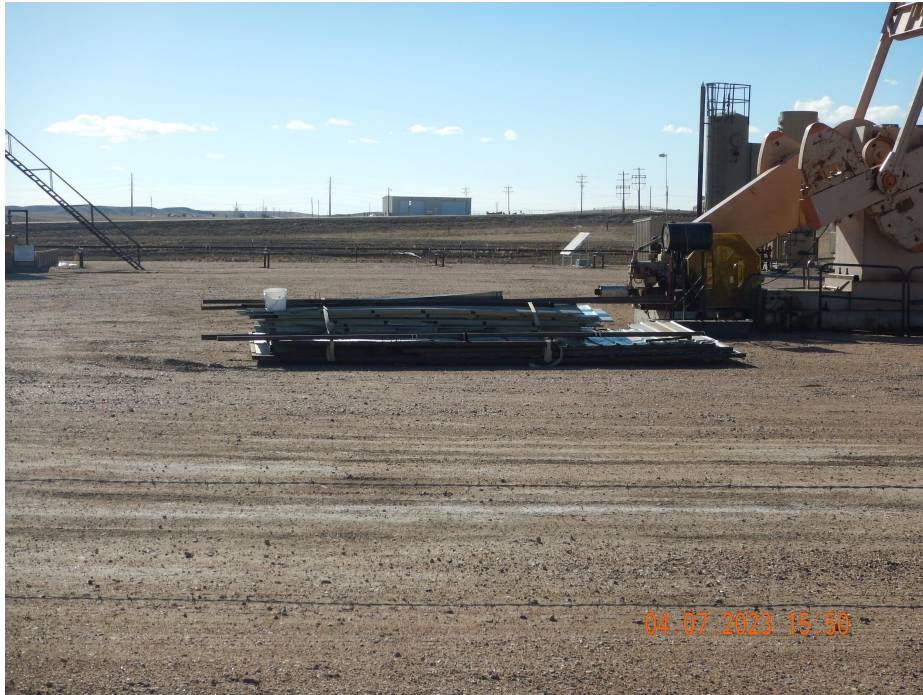
Photo 3. Photo taken from the well location, facing West. During an inspection with the Operator on 4/12/23, it was stated that this would be equipment used to build a shed.