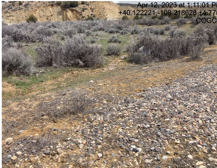
Sediment migration from location/lack of BMP's to prevent sediment migration from location