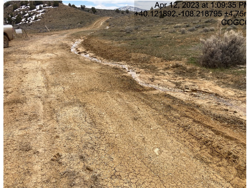
Ditch needs maintained