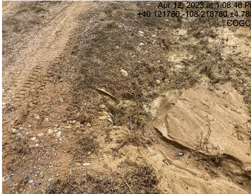
Failing culvert (inlet)