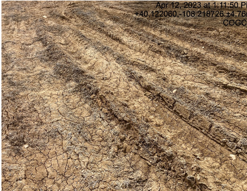
Lack of stabilization/compaction