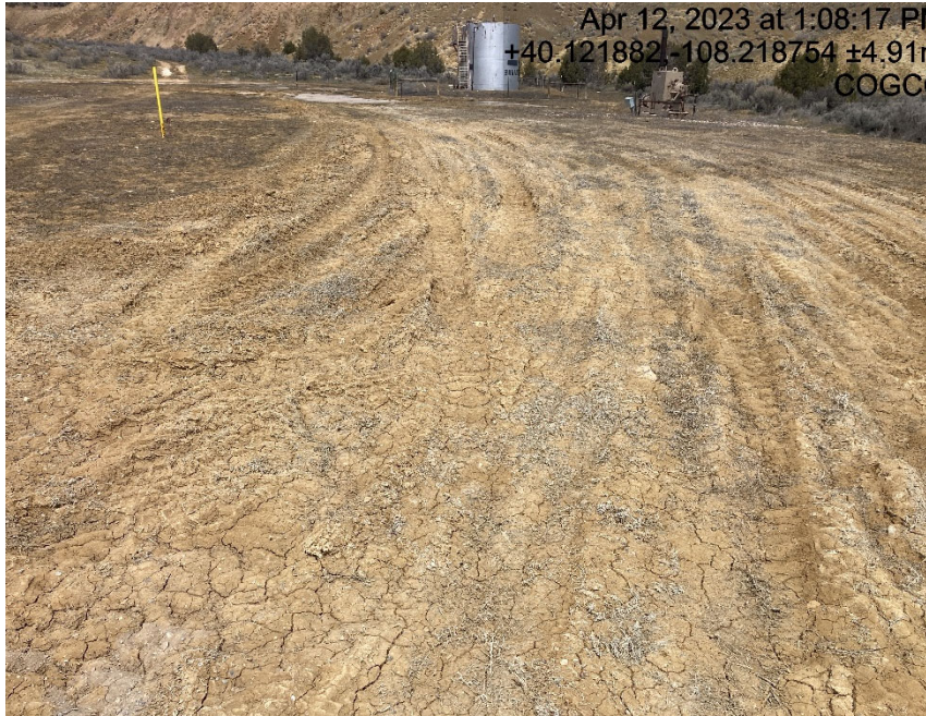
Lack of stabilization/compaction