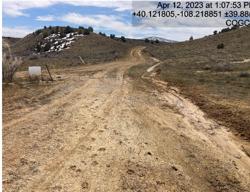
Access/entrance to location