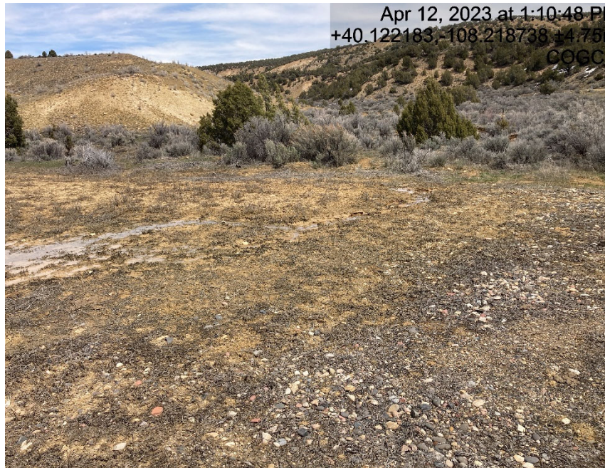
Sediment migration from location/lack of BMP's to prevent sediment migration from location