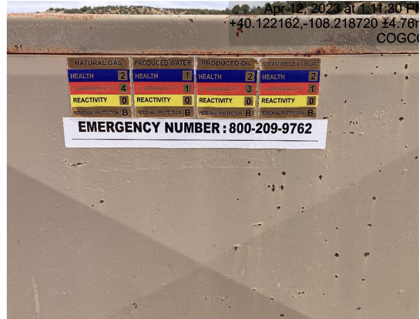
Different emergency number