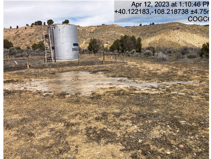
Sediment migration from location/lack of BMP's to prevent sediment migration from location