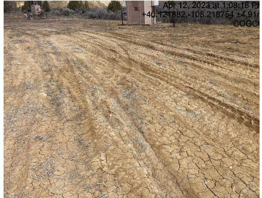
Lack of stabilization/compaction