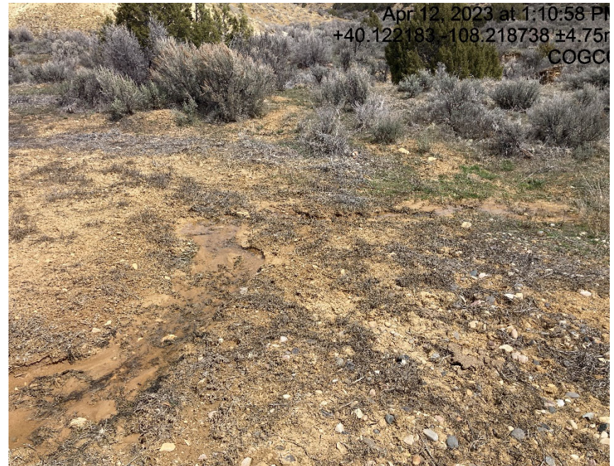
Sediment migration from location/lack of BMP's to prevent sediment migration from location