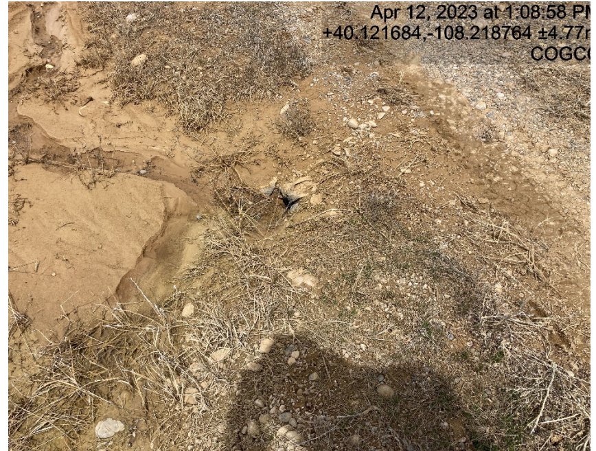
Failing culvert (inlet)