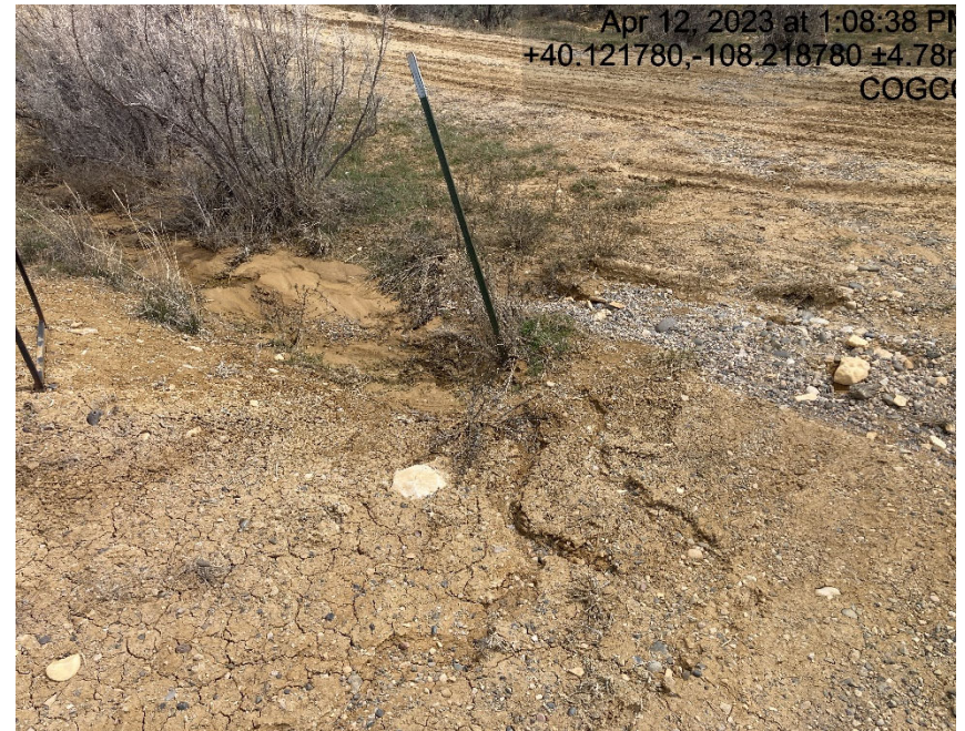
Failing culvert (outlet)