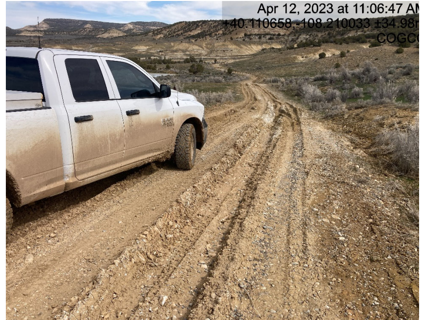
Access road lack of and/or insufficient BMP's, Lack of stabilization/compaction