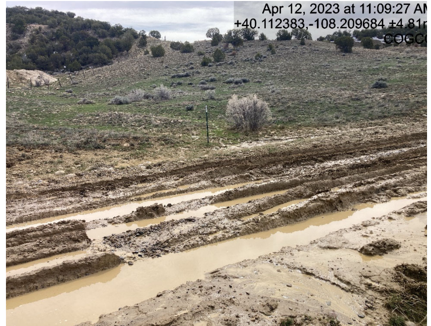
Access road lack of and/or insufficient BMP's