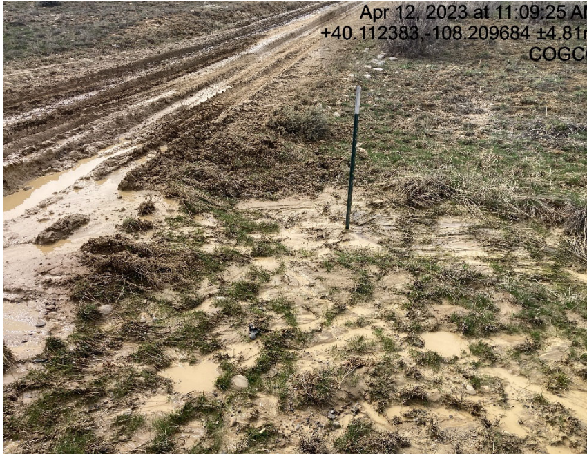
Outlet of culvert and sediment migration from access road