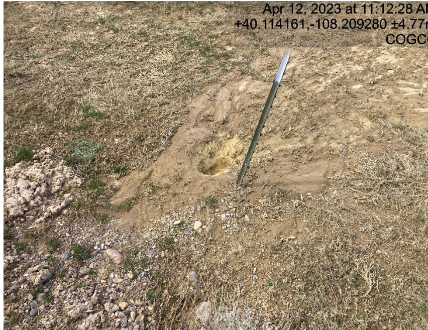
Outlet of culvert and sediment migration from access road