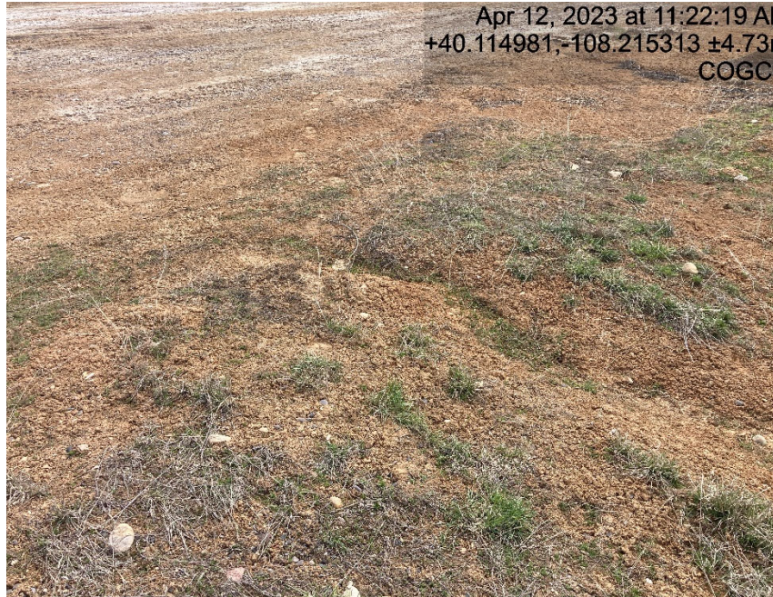
Erosion from location