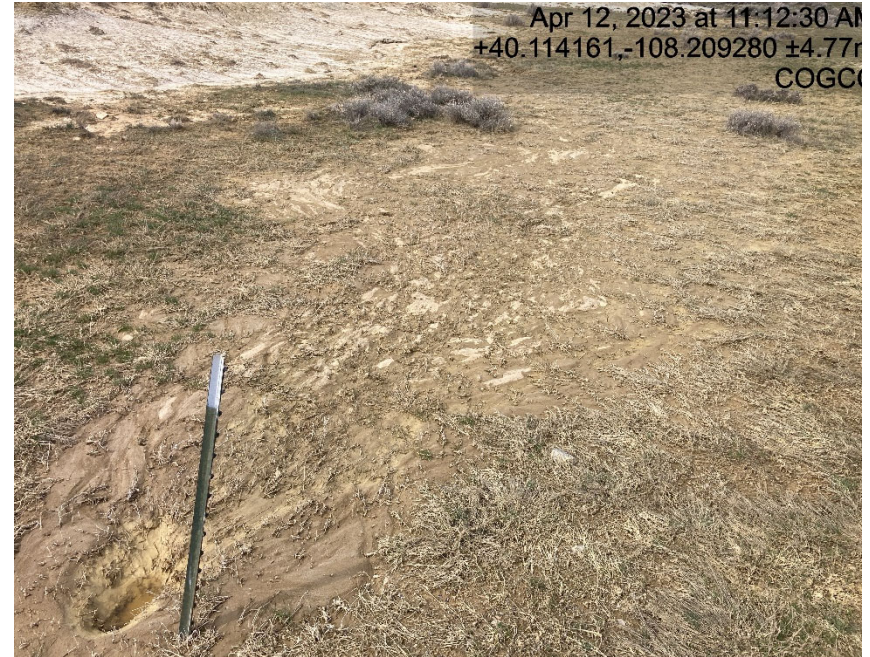
Outlet of culvert and sediment migration from access road