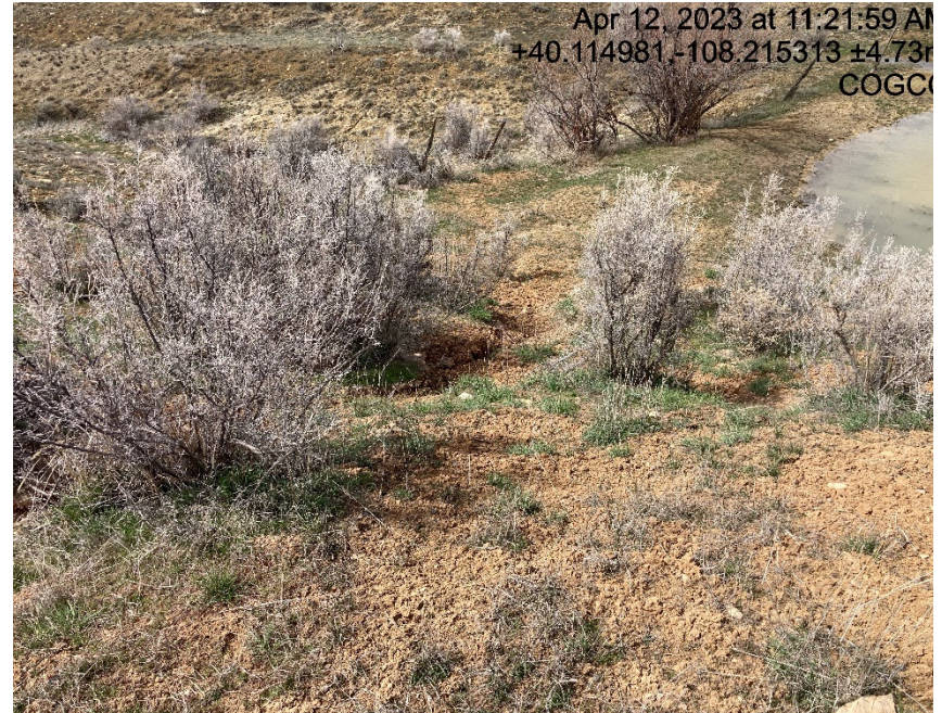
Erosion from location with sediment migration