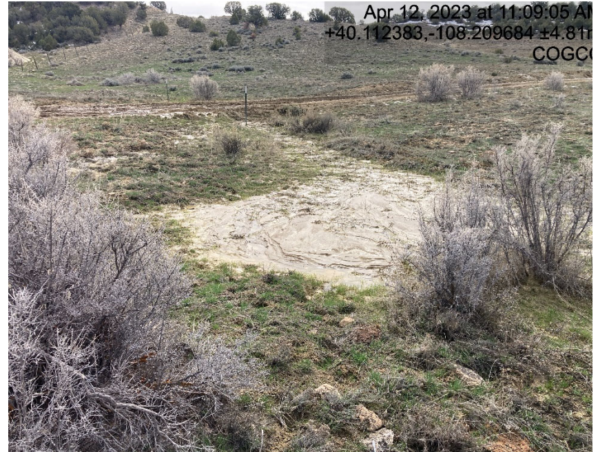
Sediment migration choking out vegetation