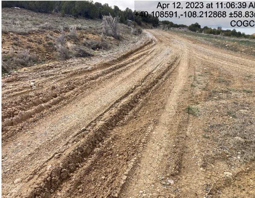
Access road lack of and/or insufficient BMP's, Lack of stabilization/compaction