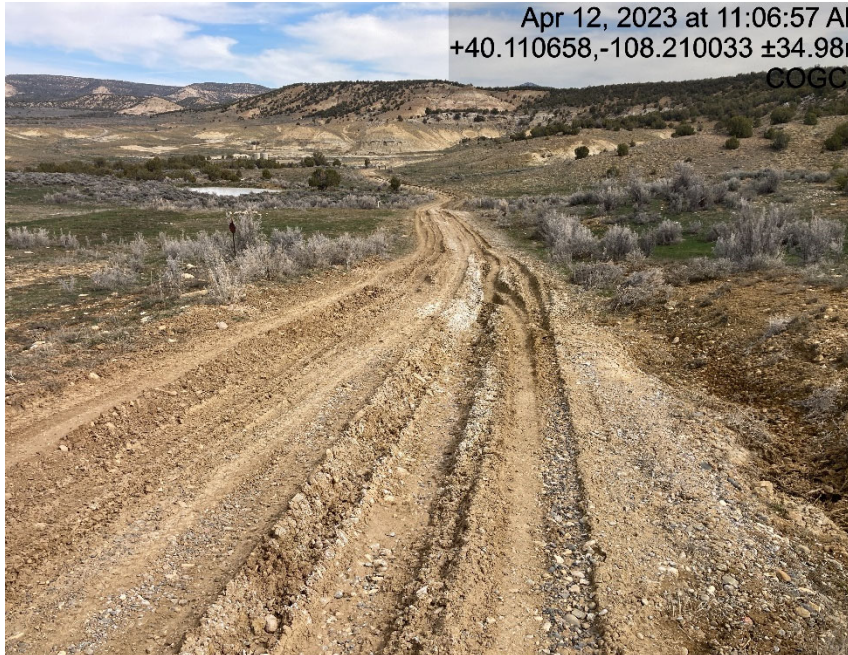
Access road lack of and/or insufficient BMP's, Lack of stabilization/compaction