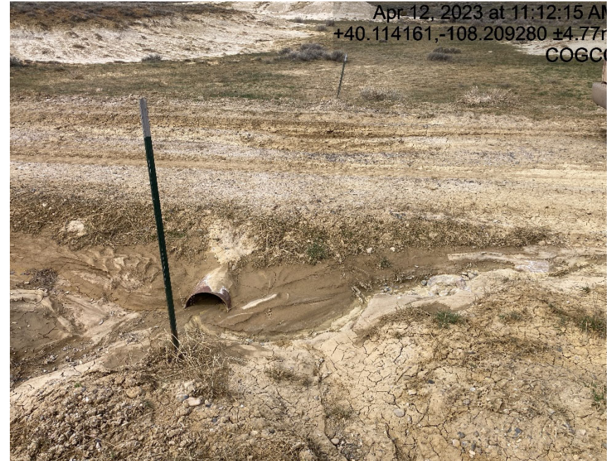
Inlet of culvert failing and sediment migration from access road