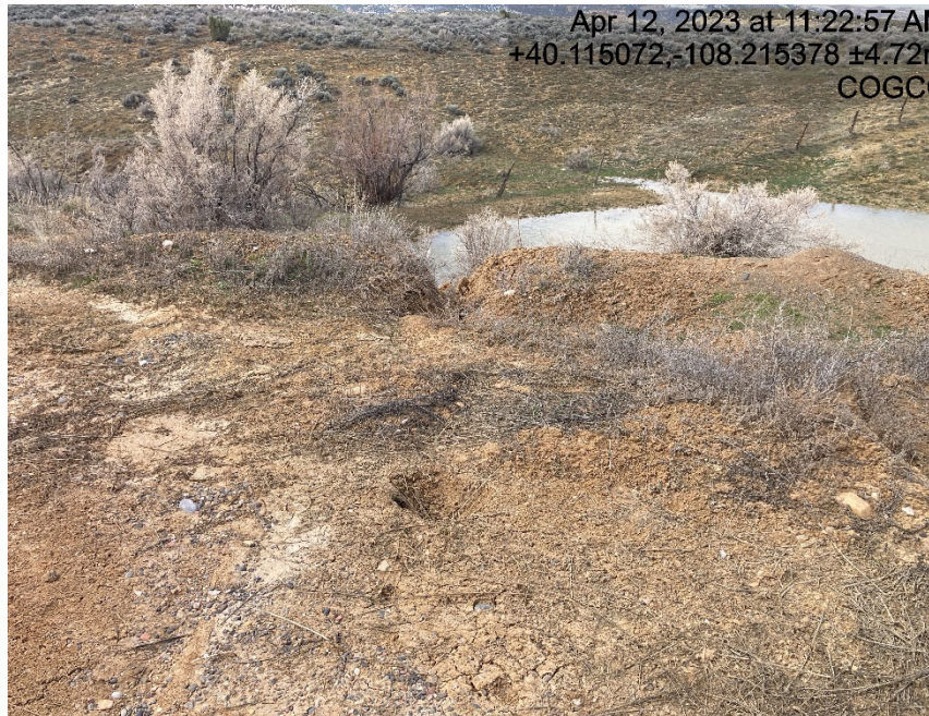
Erosion channel from location