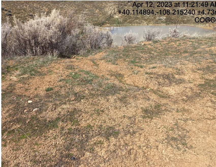
Erosion from location with sediment migration/lack of BMP'S