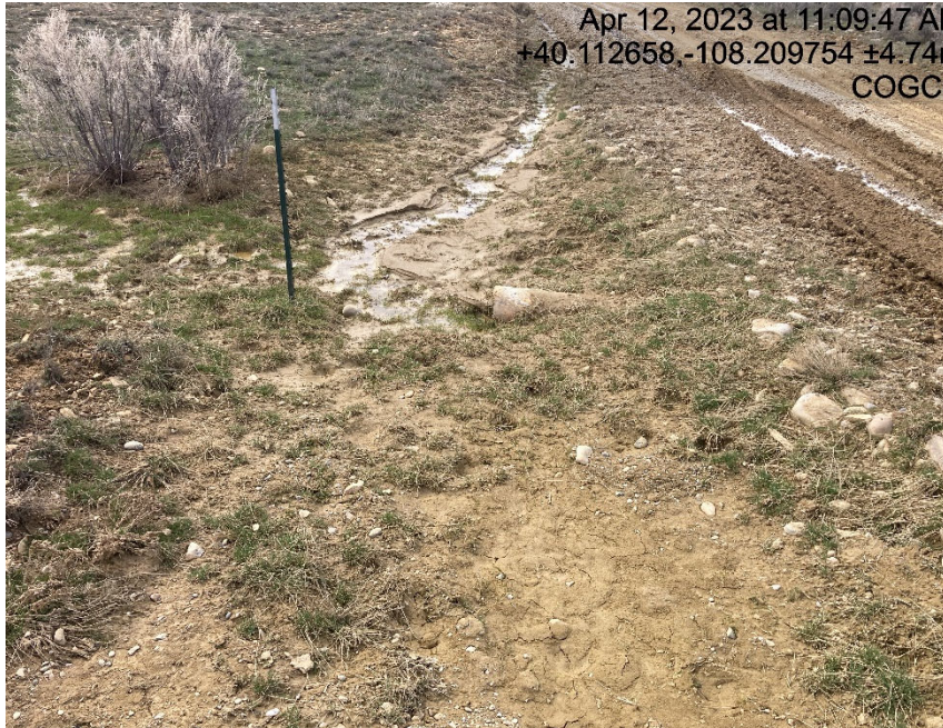
Inlet of culvert failing and sediment migration from access road