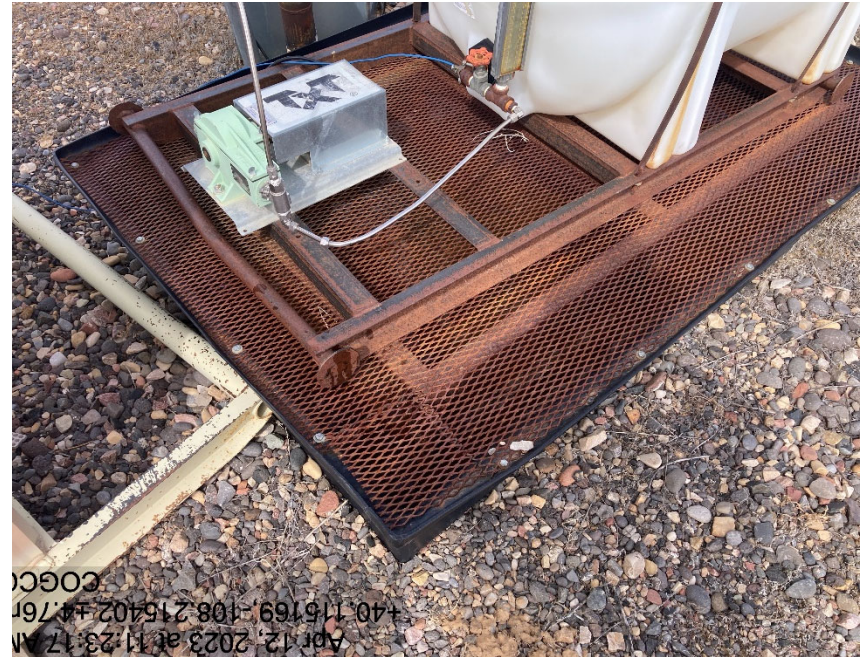
Chemical containment is full of fluid