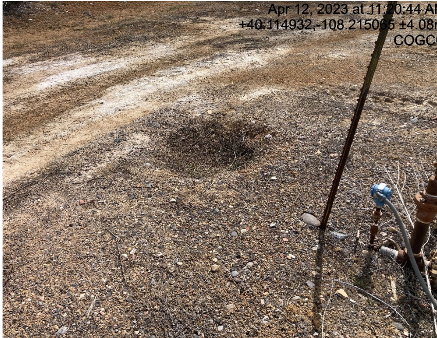
Sink hole next to well head (rathole)