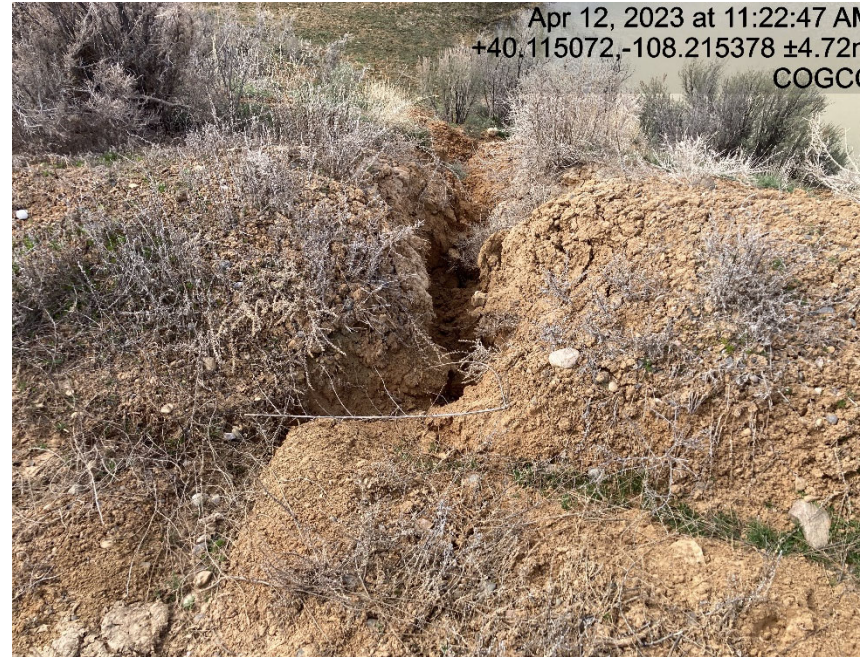
Erosion channel from location