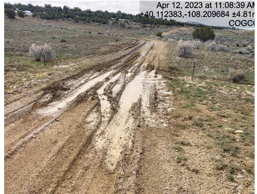
Access road lack of and/or insufficient BMP's, Lack of stabilization/compaction