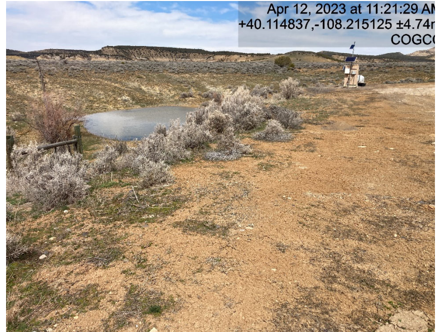
Lack of BMP's