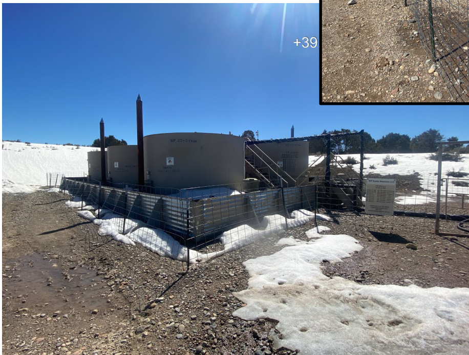
Photo 2. Photos show production areas.