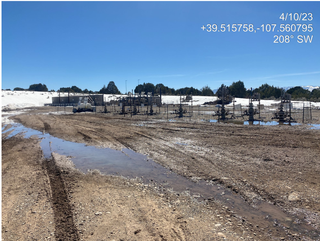
Photo 1. Photo taken from the entrance shows an overview of the location.