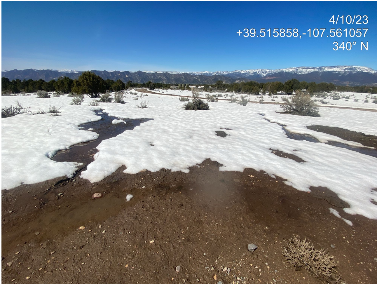
Photo 6. Photo shows what appears to be interim areas at the north of the location.