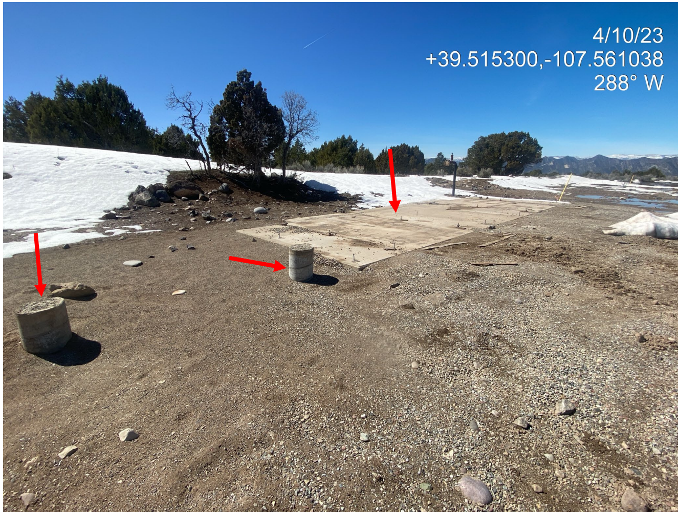
Photo 5. Photo shows concrete equipment no longer in use.