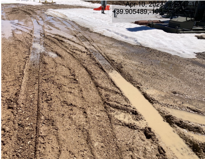
Lack of stabilization/ compaction