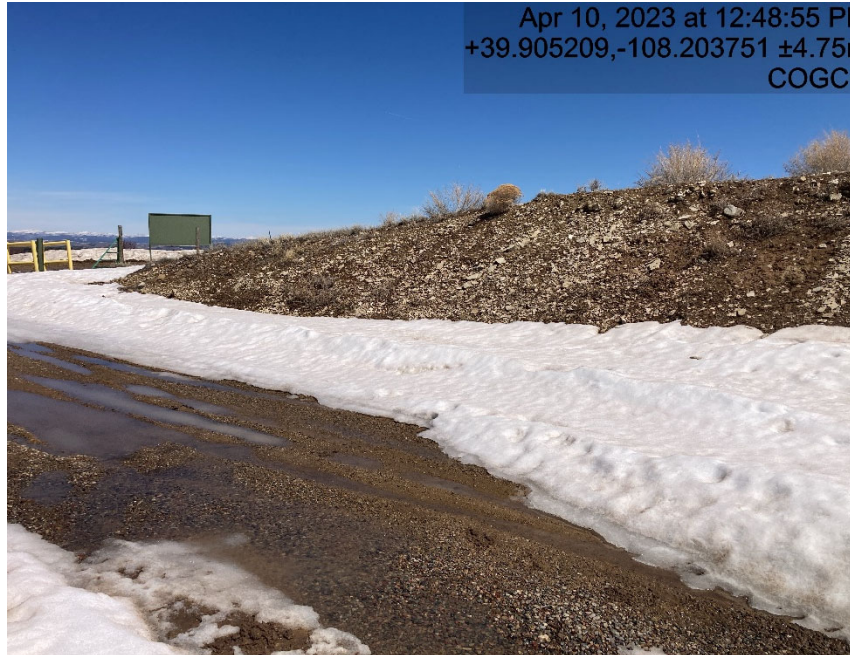
Cut slope lacks stabilization/ erosion