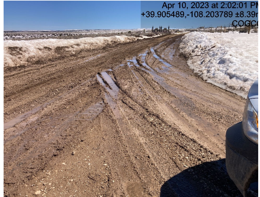
Access road entrance to location