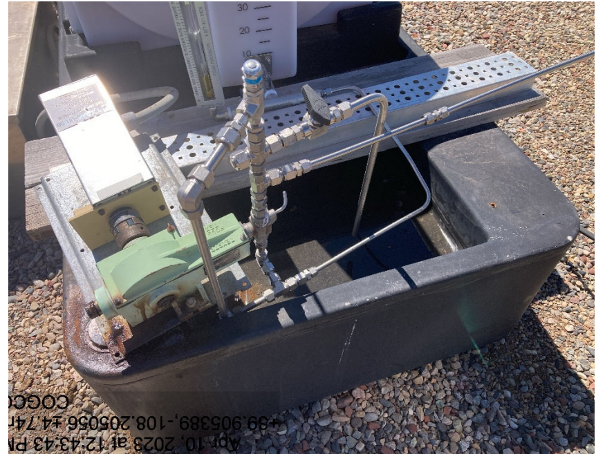
Chemical containment is full of fluid