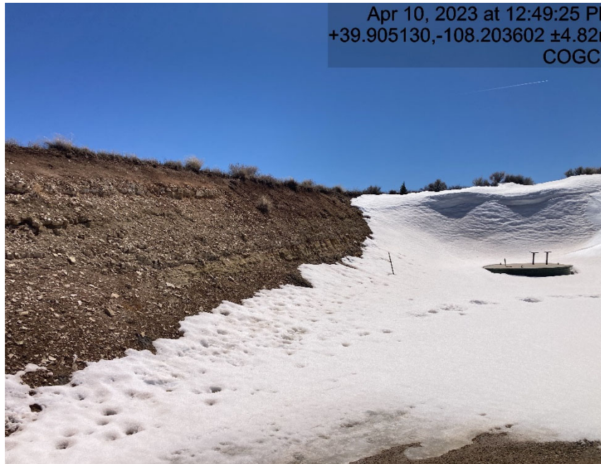
Cut slope lacks stabilization/ erosion some still snow covered