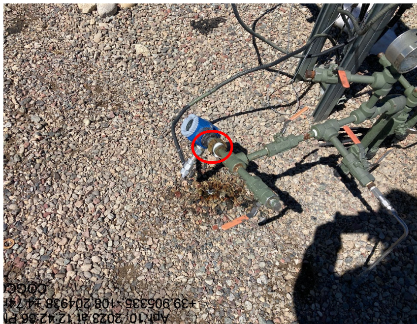
Leaking fitting and stained soil