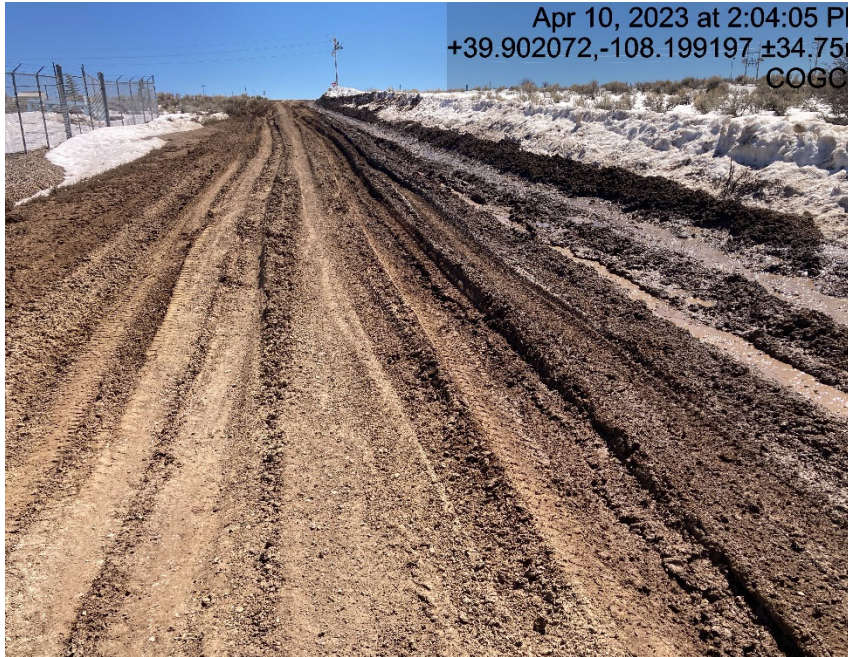
Lease road lacks compaction/ stabilization