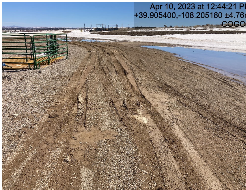
Lack of stabilization/ compaction