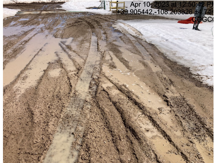
Lack of stabilization/ compaction