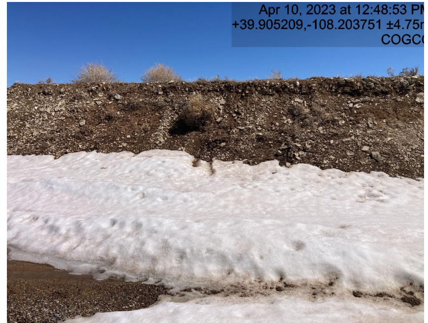
Cut slope lacks stabilization/ erosion