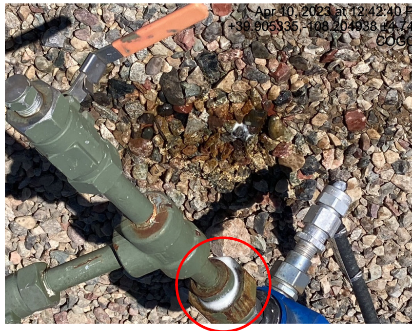
Leaking fitting and stained soil