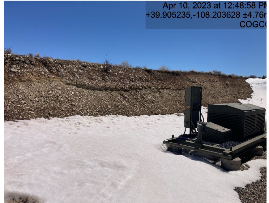
Cut slope lacks stabilization/ erosion