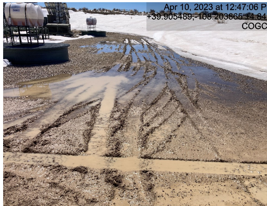
Lack of stabilization/ compaction