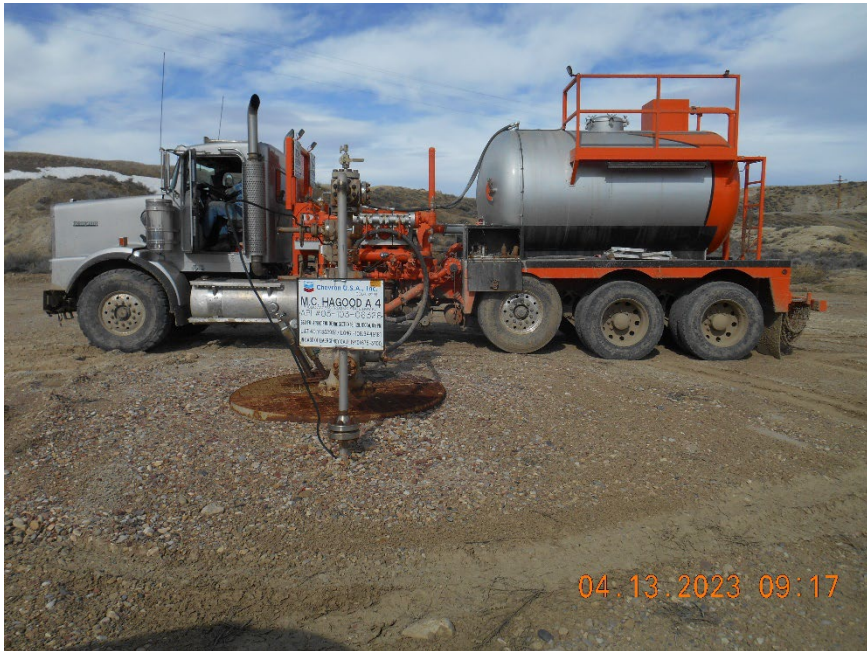
Injection wellhead during MIT