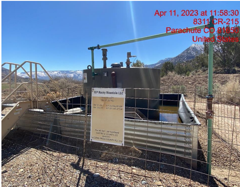
Tank Battery – Photo #02100