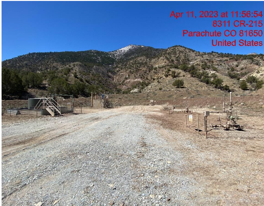
Location – Photo #02096