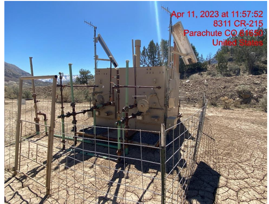
Separator – Photo #02099