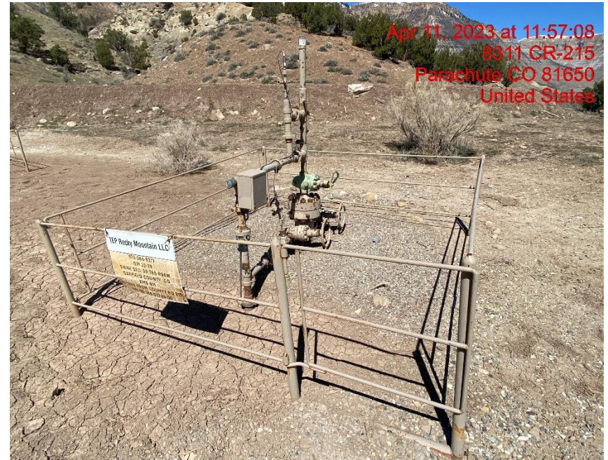
Wellhead – Photo #02097