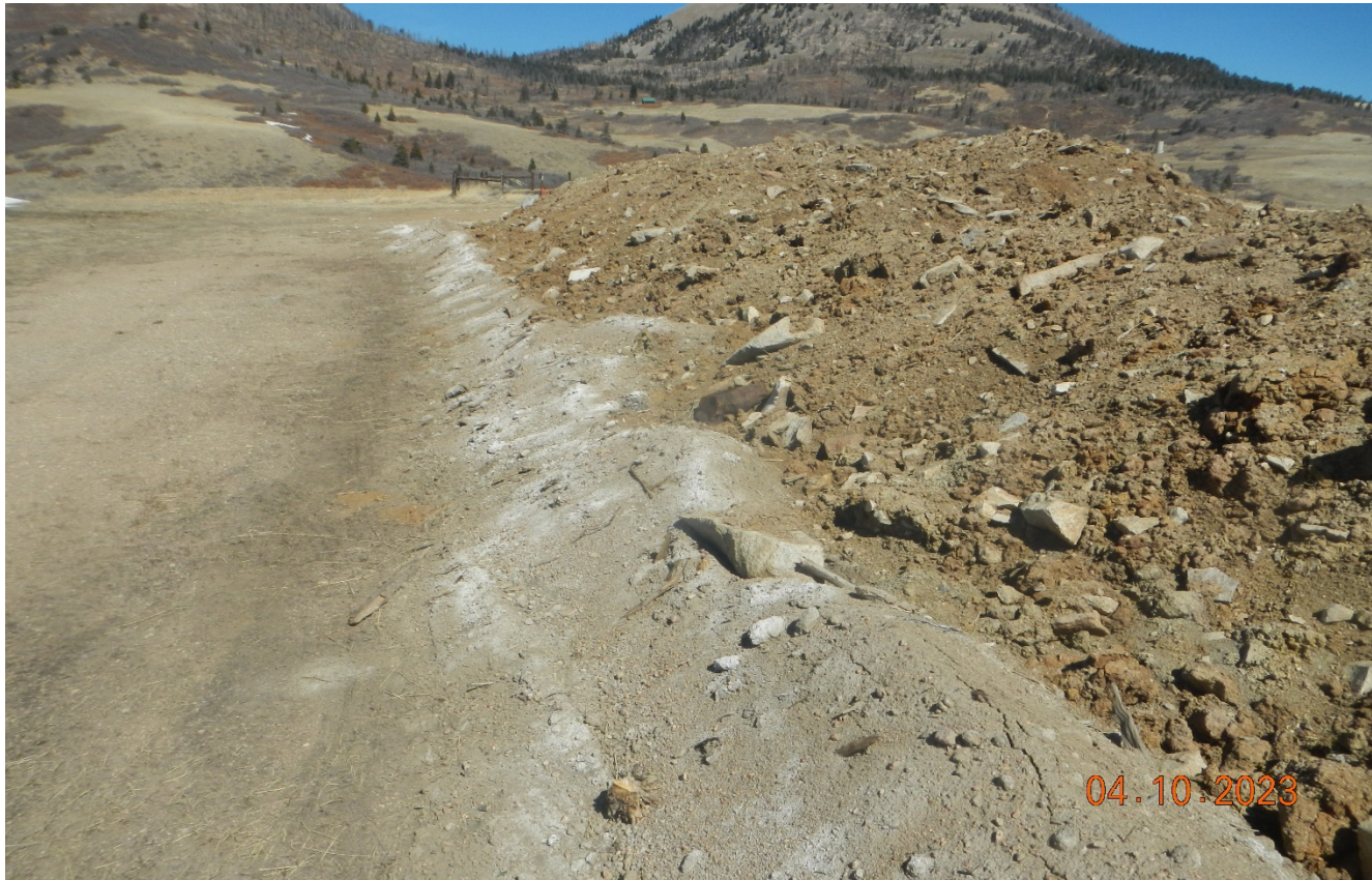
Photo 4. The excavated material is not properly stored with liner and sufficiently sized berms. Material is overtopping the berm in this area.