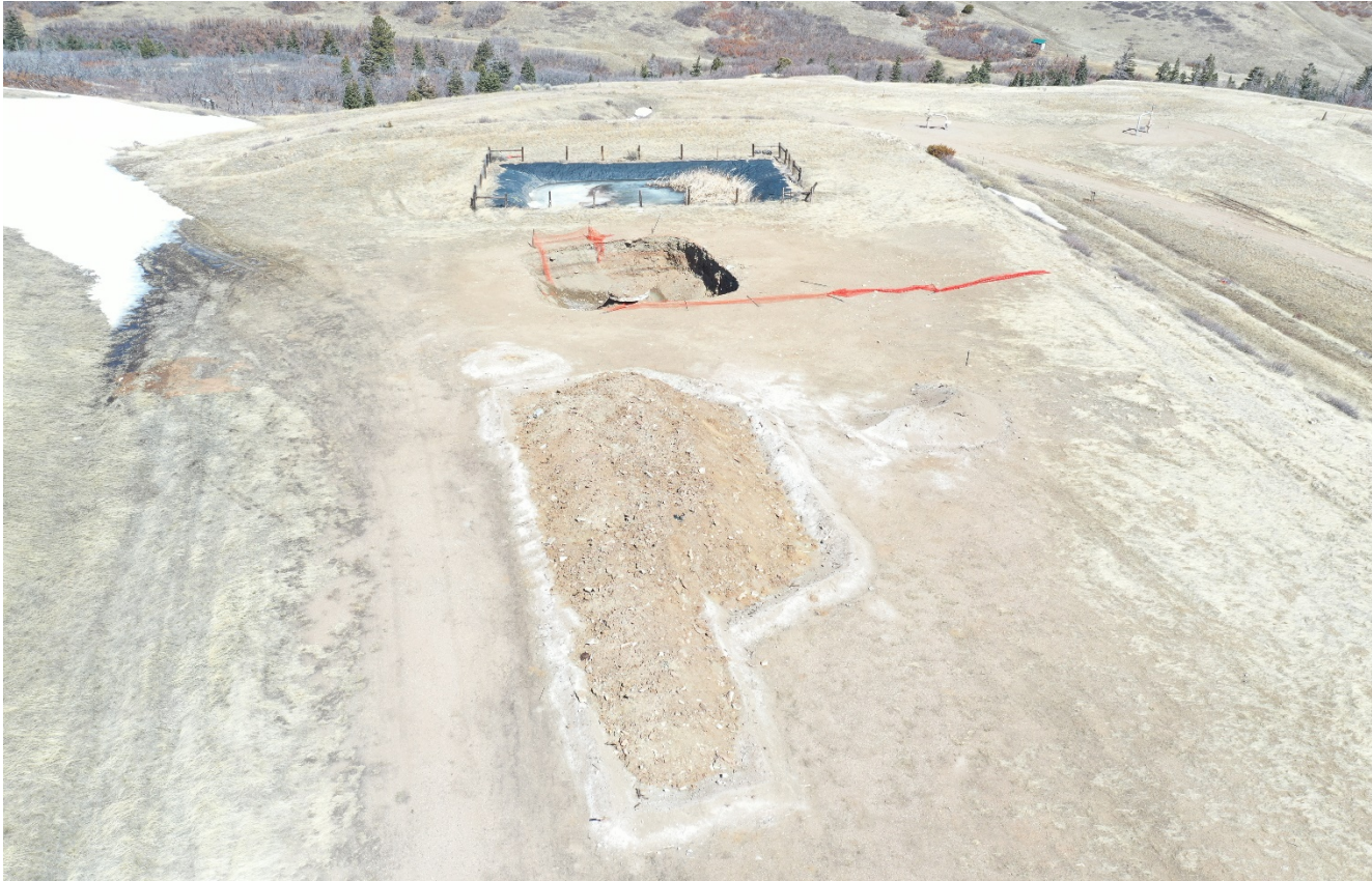
Photo 6. Drone aerial photo facing northwest toward the wellsite.