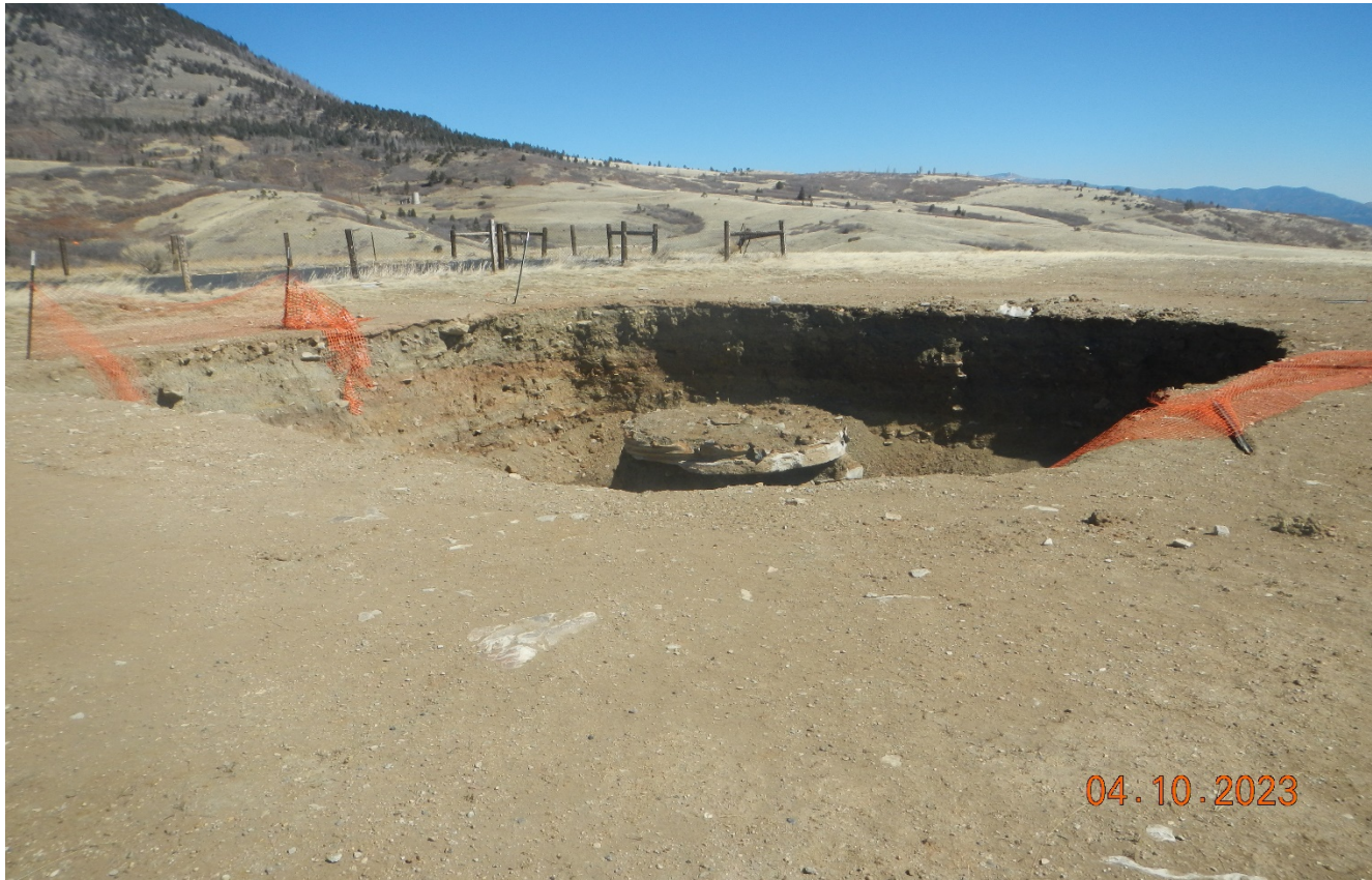
Photo 5. Facing north toward the excavated area at the wellhead. The wellhead will need to be cut an capped far enough below grade to allow proper recontouring.