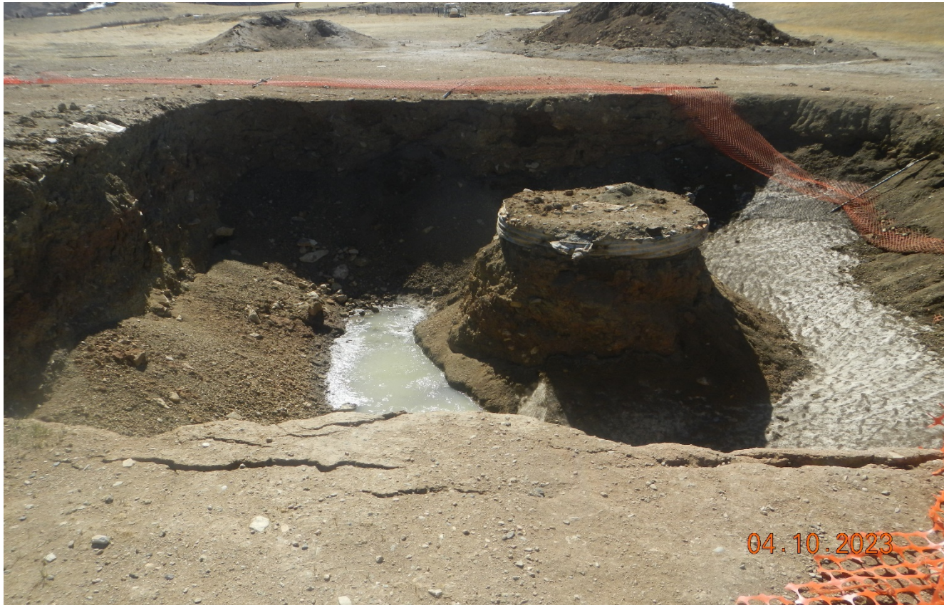
Photo 2. There is a large excavation around the wellhead approx. 10ft deep by 15'w. The excavation has vertical sides that wildlife could easily fall into and the safety fence is in disrepair.