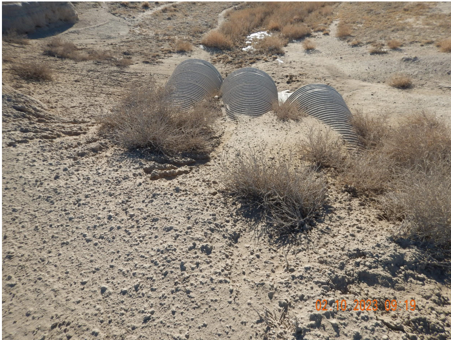
Photo 2. Photo taken from intersection of the access road and Geary Creek, facing South. Photo illustrates sediment discharge into Geary Creek without stormwater BMPs.