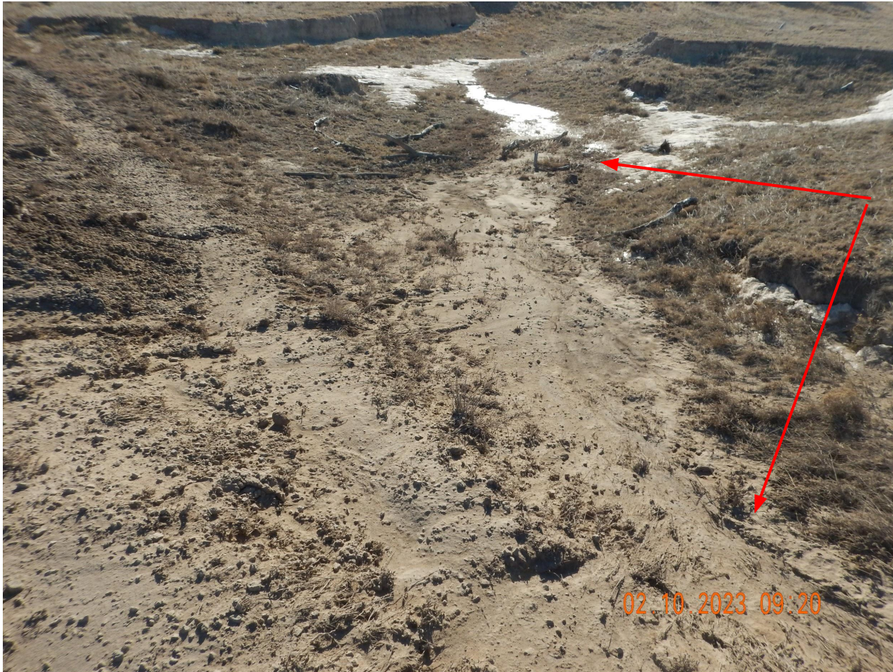
Photo 4. Photo taken from Geary Creek, facing South. Photo illustrates sediment discharge into Geary Creek.