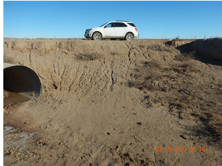
Photo 3. Photo taken from Geary Creek, facing North. See comments under Photo 2.