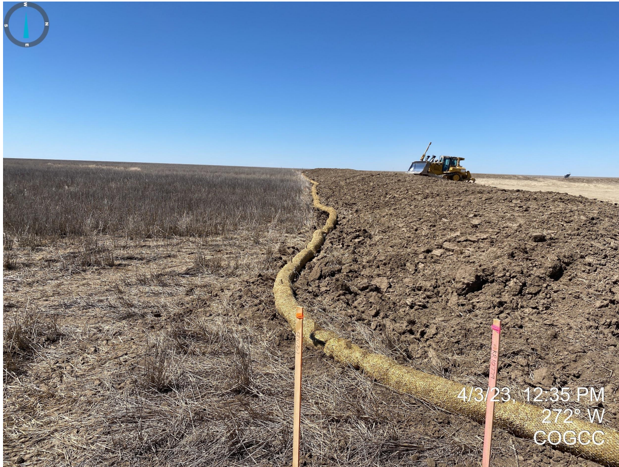
Photo 10. Facing west from the southeast corner; see comments in Photo 5.