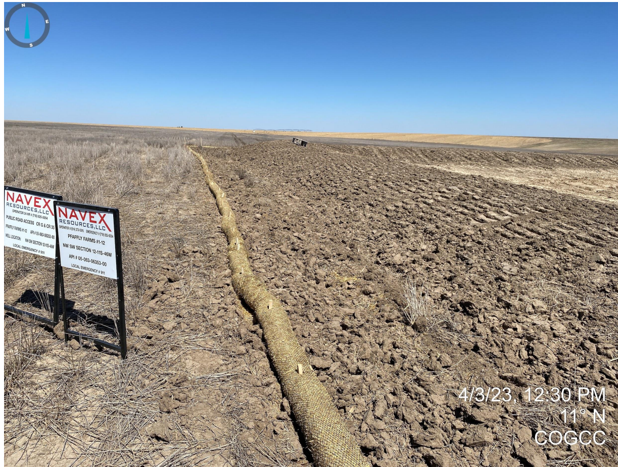
Photo 5. Facing north near the access road/location entrance. Photo illustrates that temporary stormwater BMPs (scarifying and straw wattles) were implemented. Photo also illustrates topsoil stockpiles salvaged from the pad area have been temporarily stabilized with equipment tracking observed.