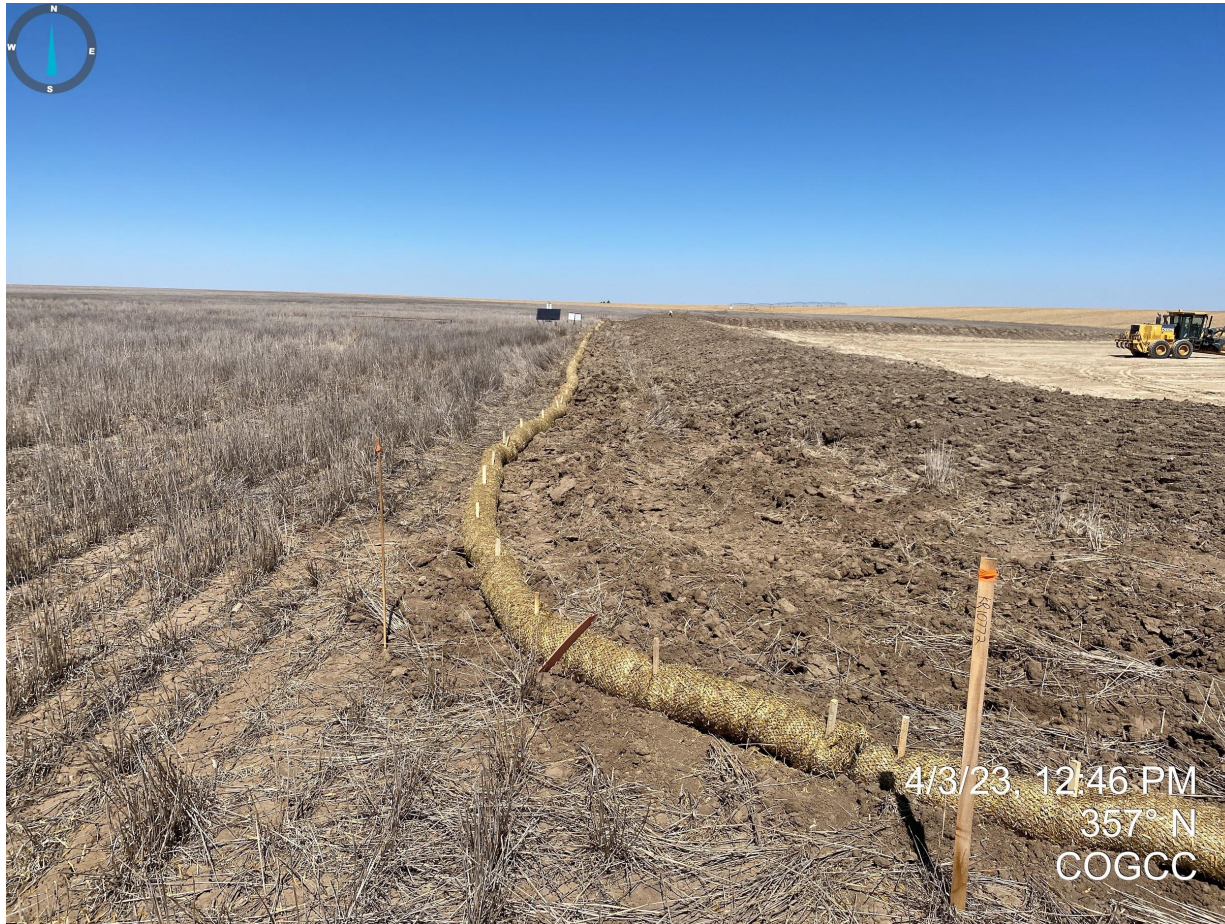
Photo 11. Facing north from the southwest corner, see comments in Photo 5.