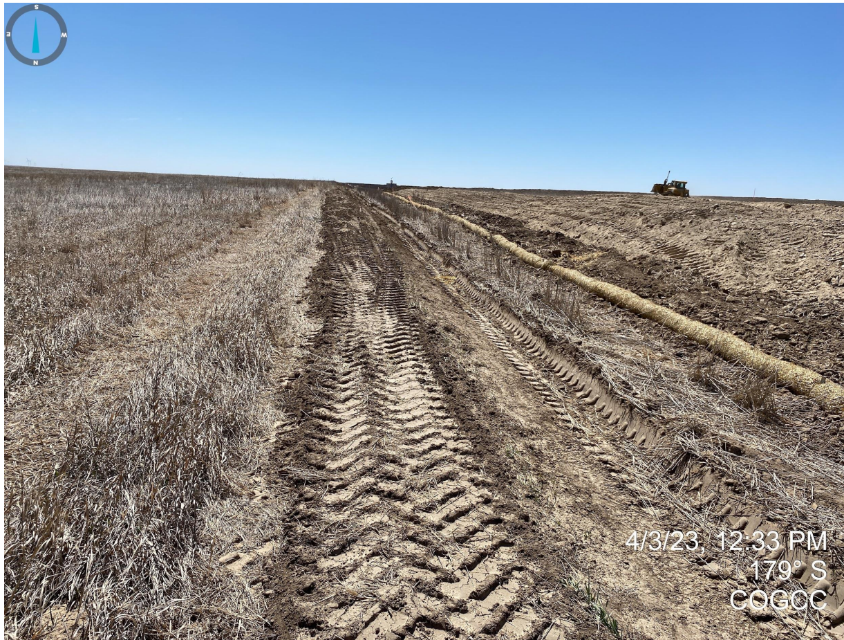
Photo 8. Facing south from the northeast corner. Photo illustrates stormwater ditch BMP on the downslope/eastern portion of the drilling pad.