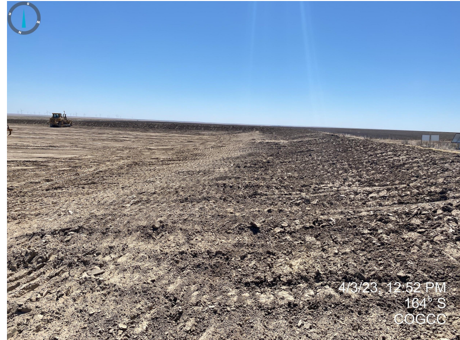
Photos 12 & 13. Overview of drilling pad from the northwest corner of the pad.