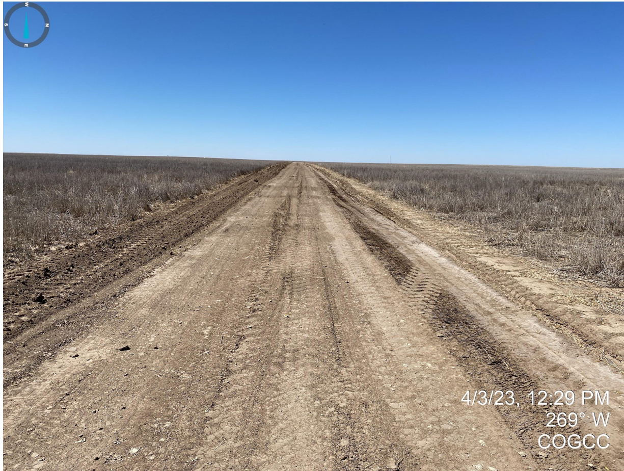
Photo 4. Overview of access road, illustrating that approximately 3" of topsoil was salvaged and stored on the southern side of the road.