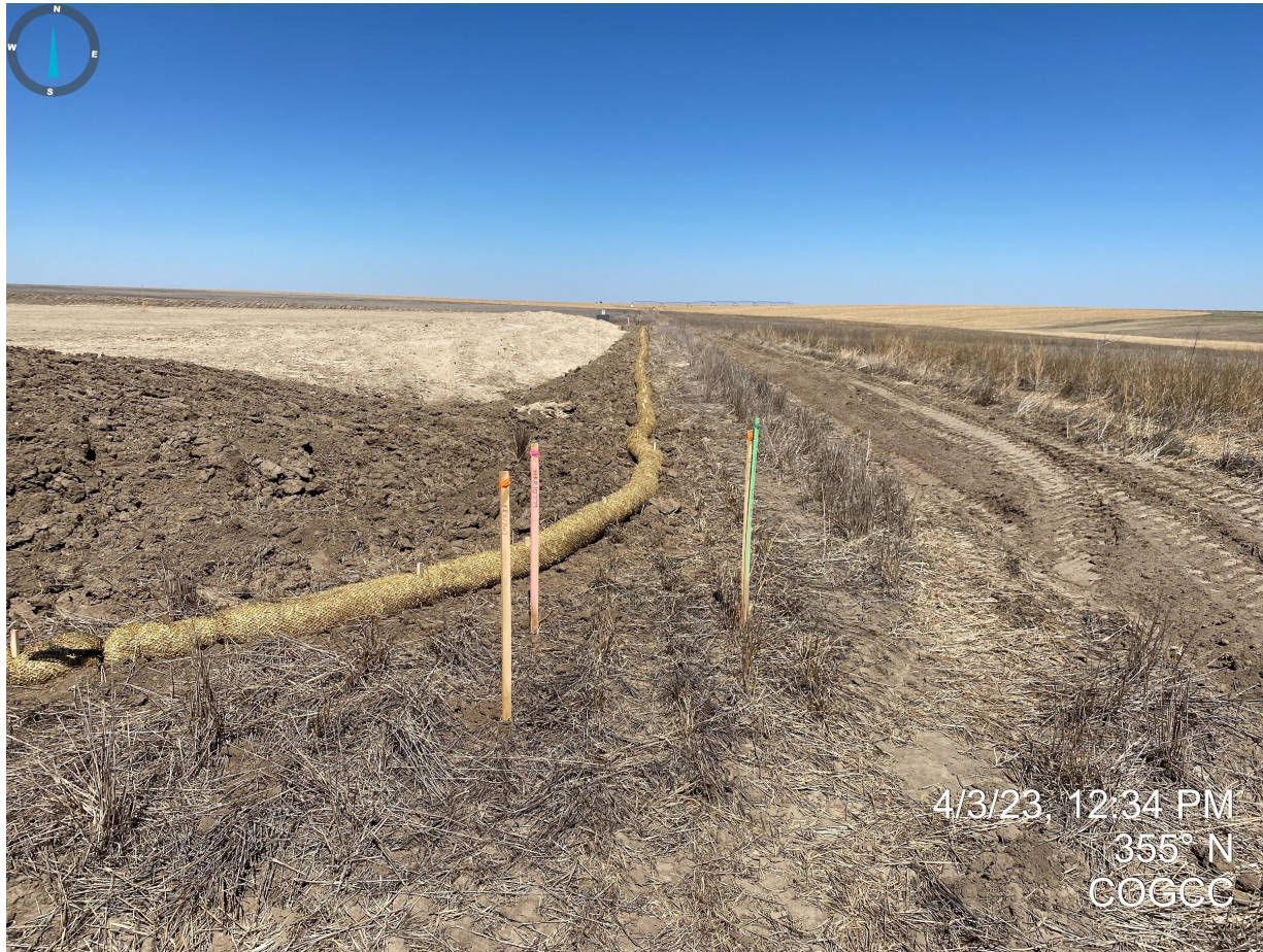
Photo 9. Facing north from the southeast corner of the location. See comments in Photo 5.