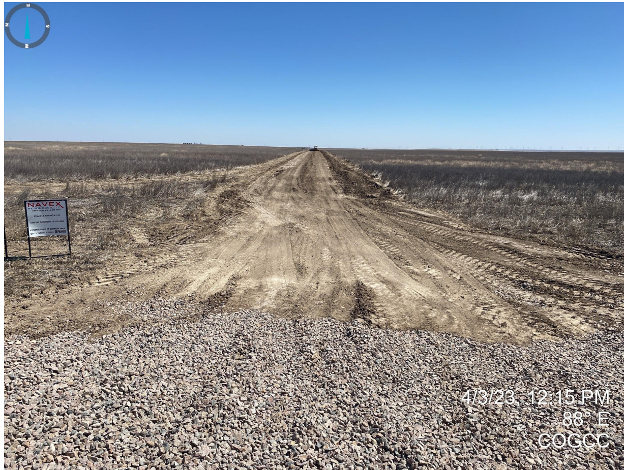
Photo 1. Taken from the location entrance. Location signs and an approved copy of the Form 2A posted on location. Also pictured, vehicle track out pad.