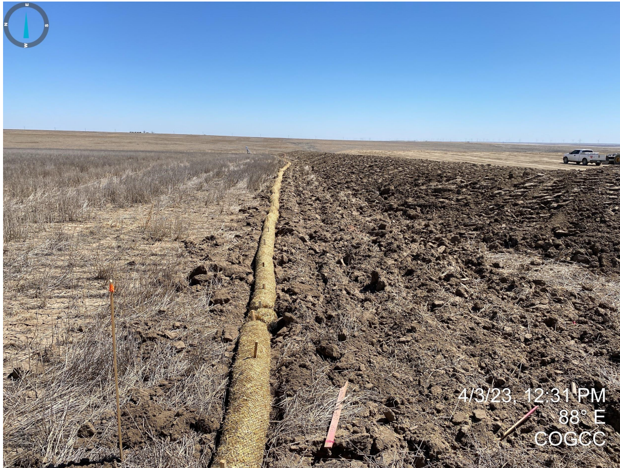
Photo 6. Facing east from the northwest corner; see comments in Photo 5.