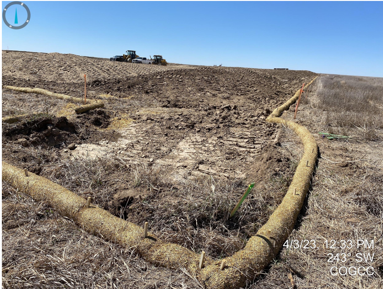
Photo 7. Facing southwest from the northeast corner; see comments in Photo 5.