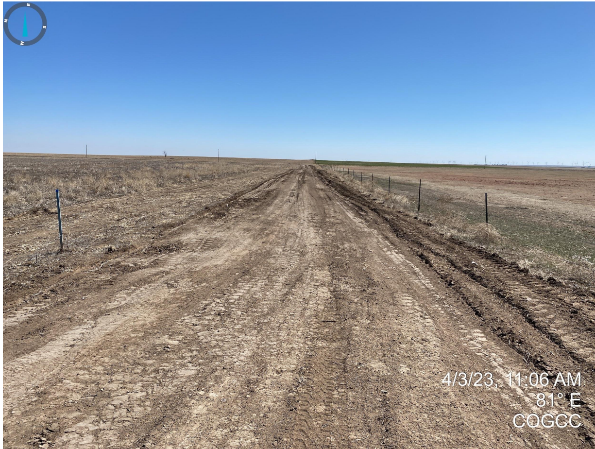
Photo 2. Facing east along the access road. It does not appear that all of the topsoil has been salvaged from the access road. See Photos 3 & 4 for additional information.