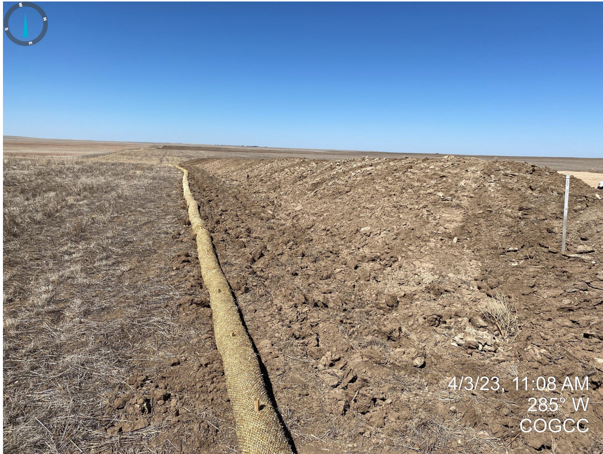
Photo 6. Facing west from the southeast corner of the location. Photo illustrates that the topsoil stockpiles have been temporarily stabilized with equipment tracking; longer term stabilization techniques should be implemented. Additionally, temporary stormwater BMPs (scarifying and straw wattles) observed around the entire pad.