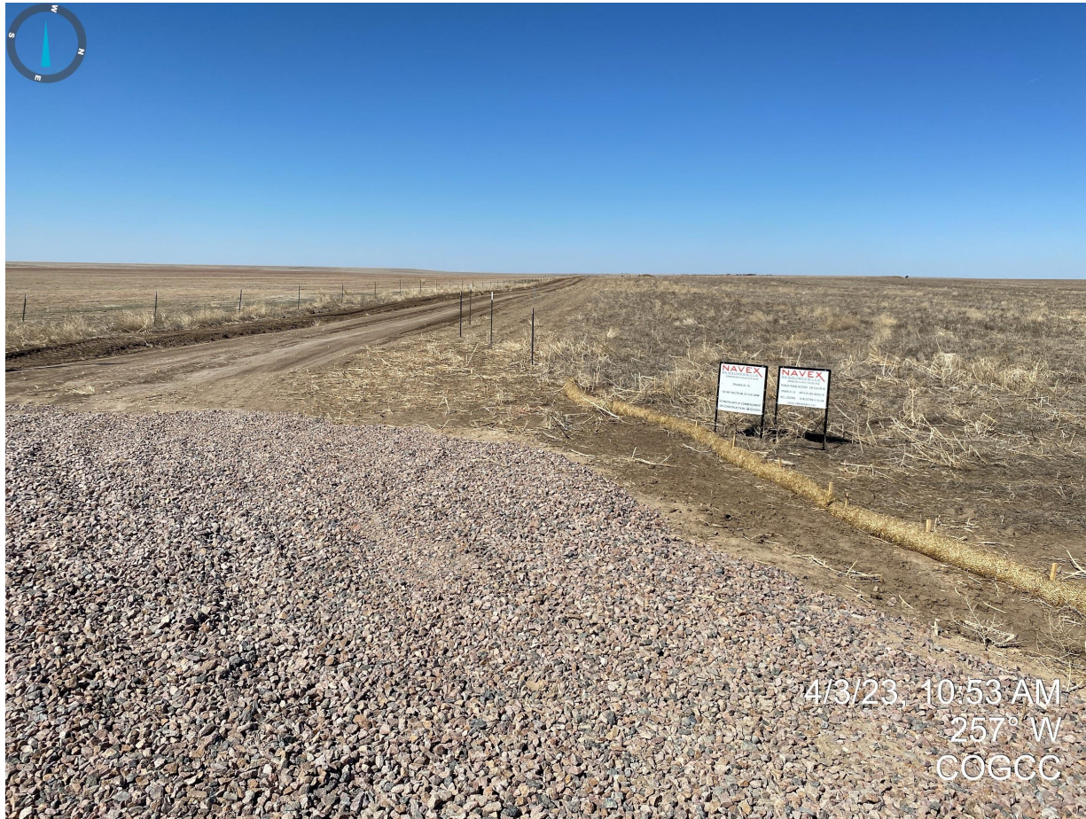
Photo 1. Location signs and approved Form 2A posted at the entrance to the location.