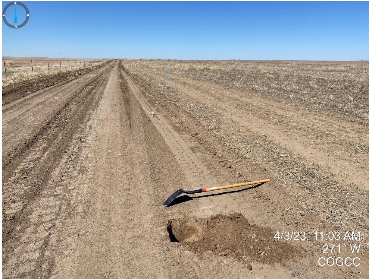
Photo 5. Overview of pothole from access road.