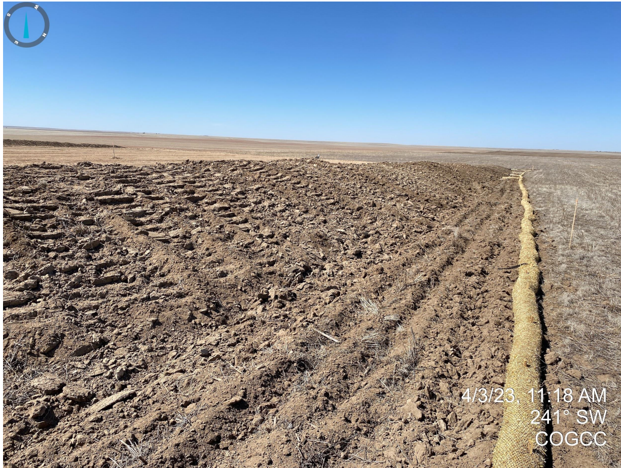
Photo 11. Facing southwest from the northern portion; see comments in Photo 6.