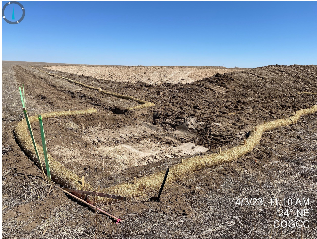
Photo 9. Facing northeast from the southwest corner; see comments in Photo 6.