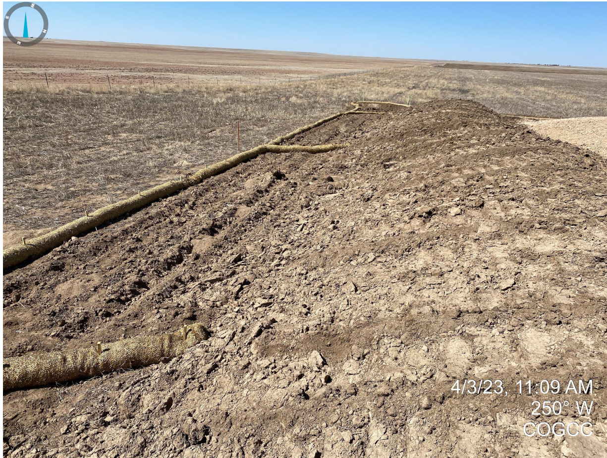
Photo 8. Facing west from the southern portion; see comments in Photo 6.