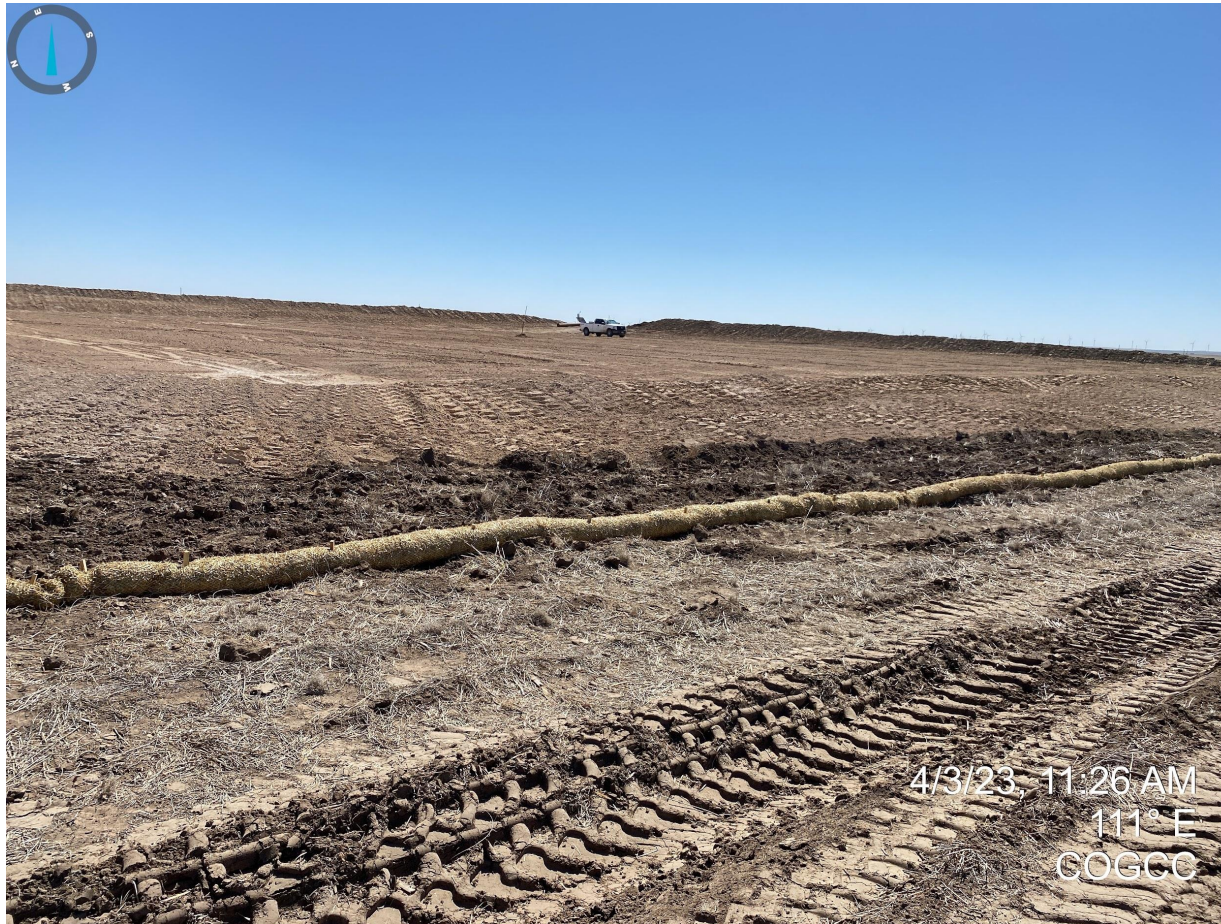
Photo 12. Facing east towards the drilling pad. Photo illustrates cut and fill slopes appear to be stabilized with stormwater BMPs implemented at the western edge of the disturbance area; scarifying, straw wattles, and ditch and berm pictured.