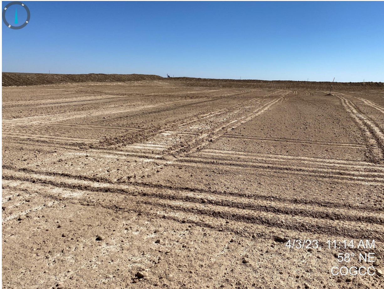
Photo 13. Overview of drilling pad.