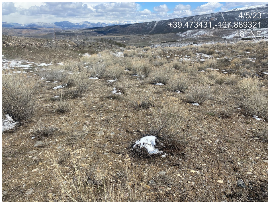
Photo 10. Photos show interim areas.