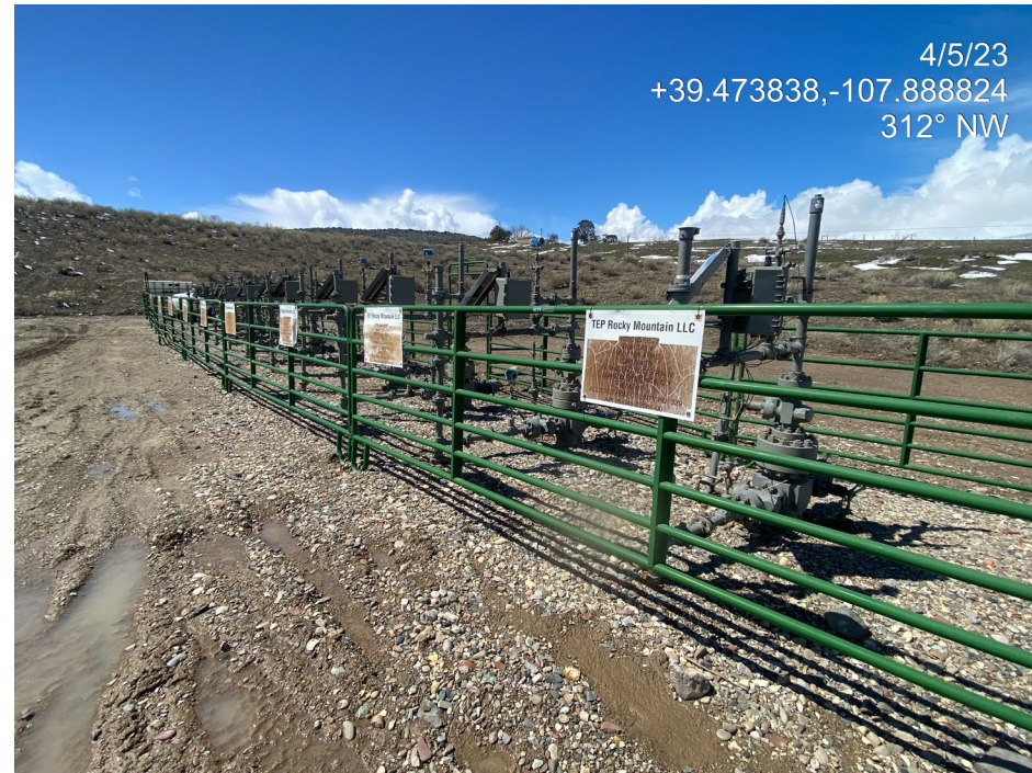
Photo 2. Photos show production areas.