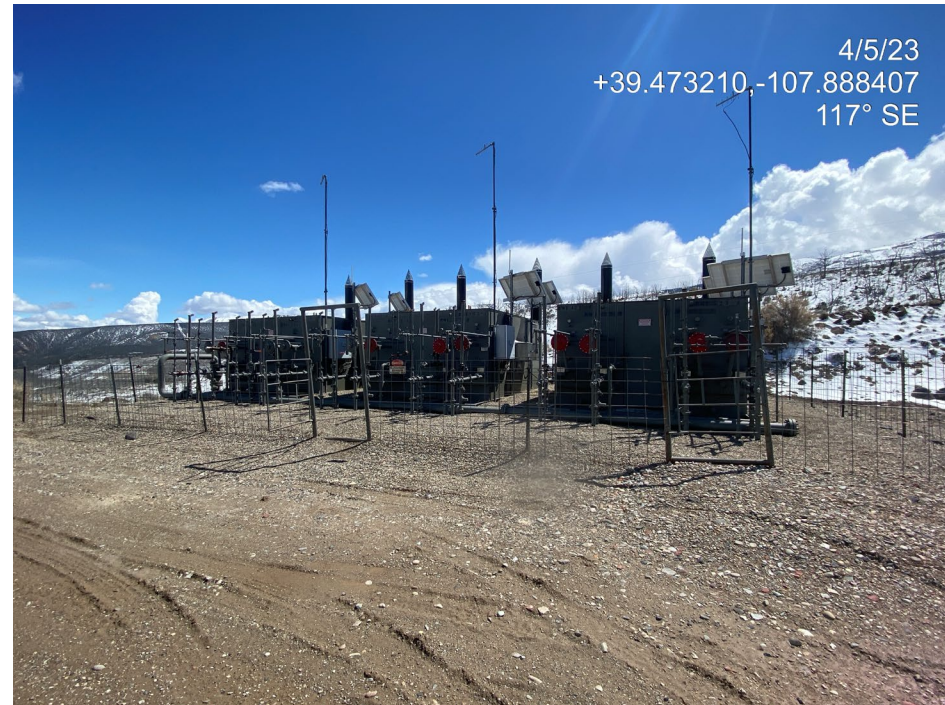
Photo 3. Photos show production areas.