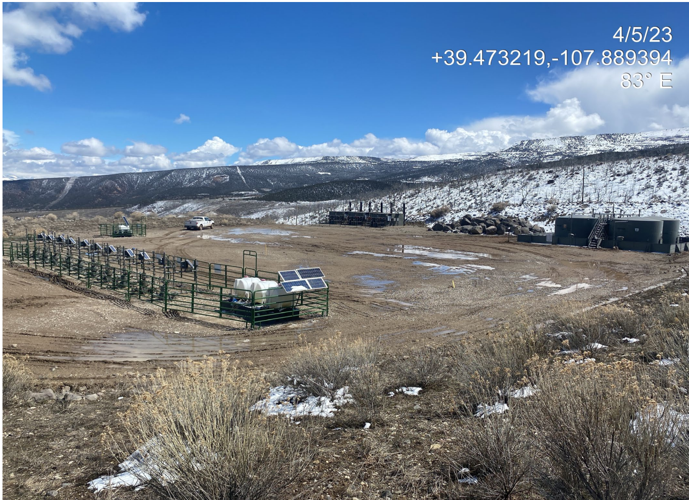
Photo 1. Photo taken from the west shows an overview of the location.