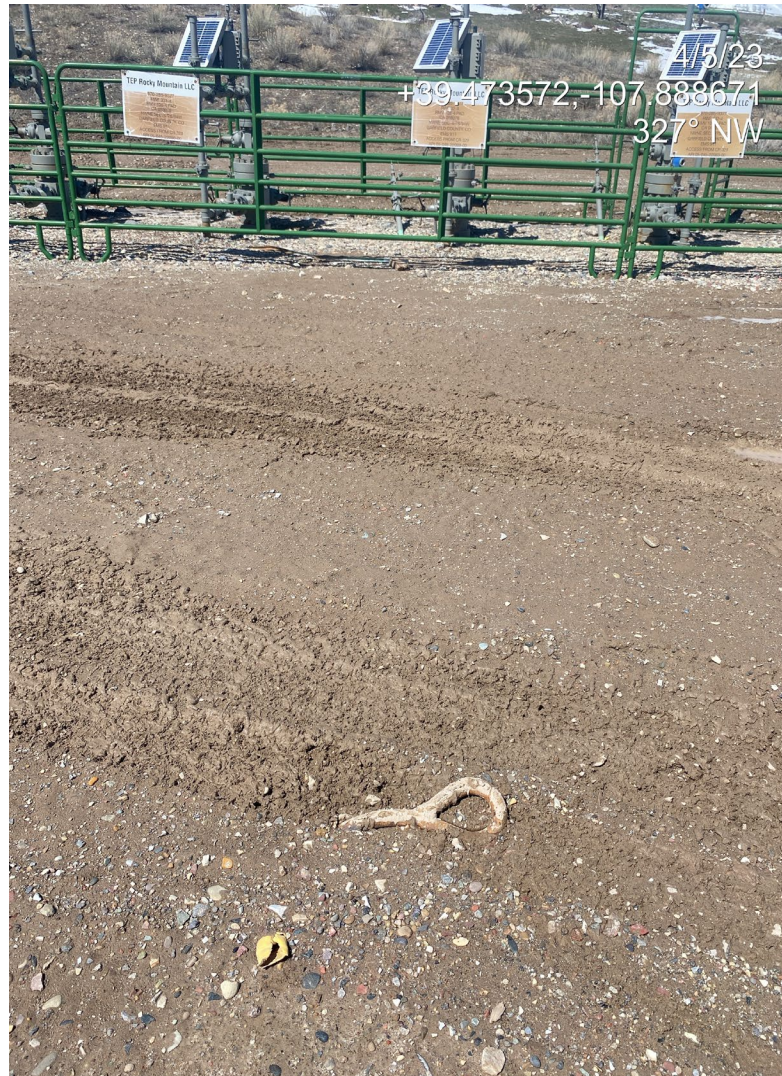
Photo 6. Photo shows an unmarked anchor to the south of the wells.