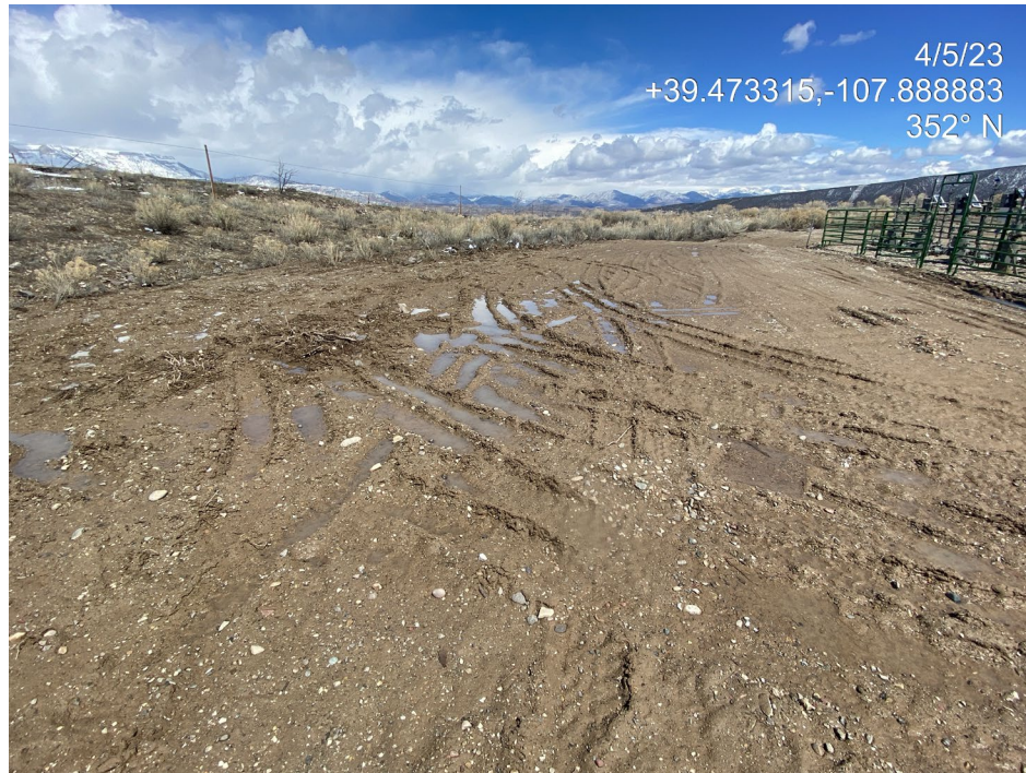
Photo 8. Photos show lack of stabilization/compaction from previous inspection (left) and current inspection (right).