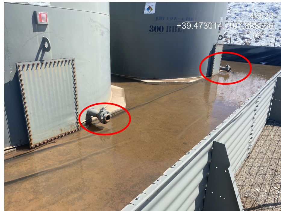
Photo 4. Photo shows bull plugs not installed on tank drain lines.