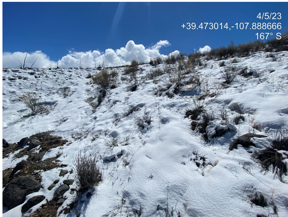
Photo 9. Photos show slopes at the south of the location are snow covered.