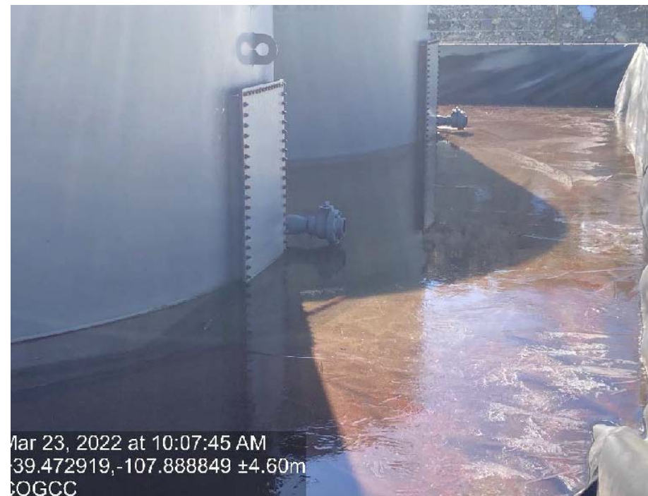
Photo 5. Photo shows bull plugs not installed on tank drain lines from previous inspection.