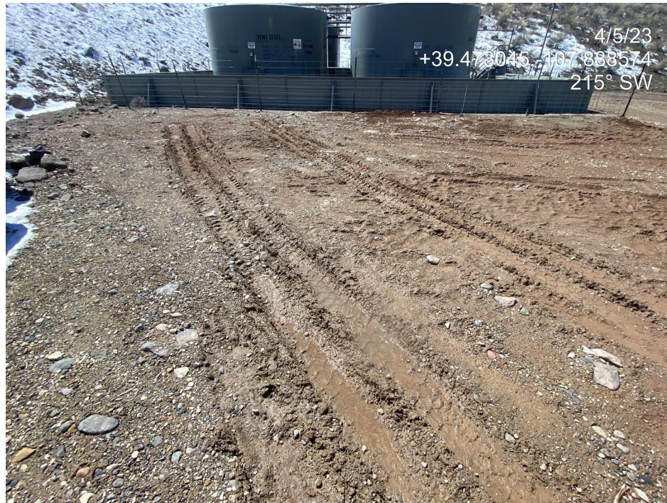
Photo 7. Photos show lack of stabilization/compaction from previous inspection (left) and current inspection (right).